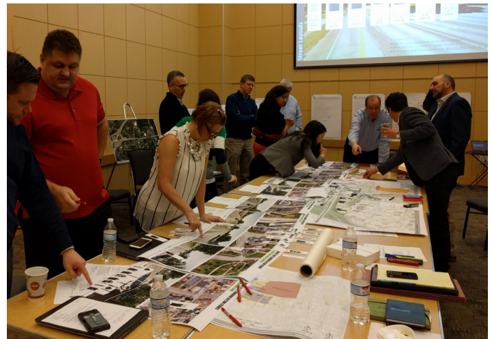
Alternatives Workshop: January 23, 2017

A charrette provides a forum for ideas and offers the unique advantage of giving immediate feedback to the designers. More importantly, it allows everyone who participates to be a mutual author of the plan.