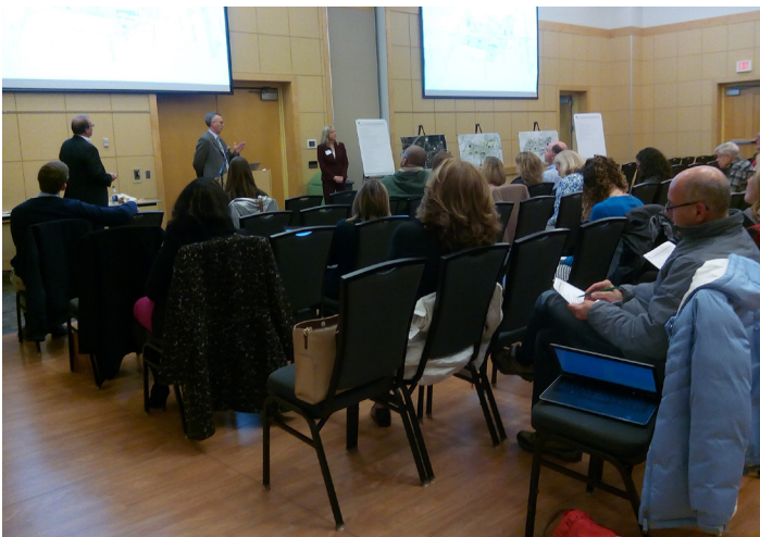
Public Meeting 1: January 18, 2017

A hands-on design workshop was conducted on day two of the public charrette (January 23, 2017). The purpose of this workshop was to work with the consultant team to preview and further develop three preliminary planning framework alternatives for the study area. Participants included Dublin City staff (while not specifically advertised