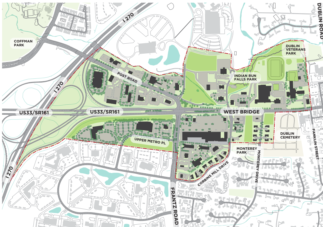
West Bridge Street Corridor Framework Plan Study Area

Upon its completion in fall 2017, the West Bridge Street Corridor Framework Plan will provide a roadmap to guide implementation, while building upon the Bridge Street District vision and encouraging public and private investment that continues to attract jobs, housing and services that benefit the entire community.