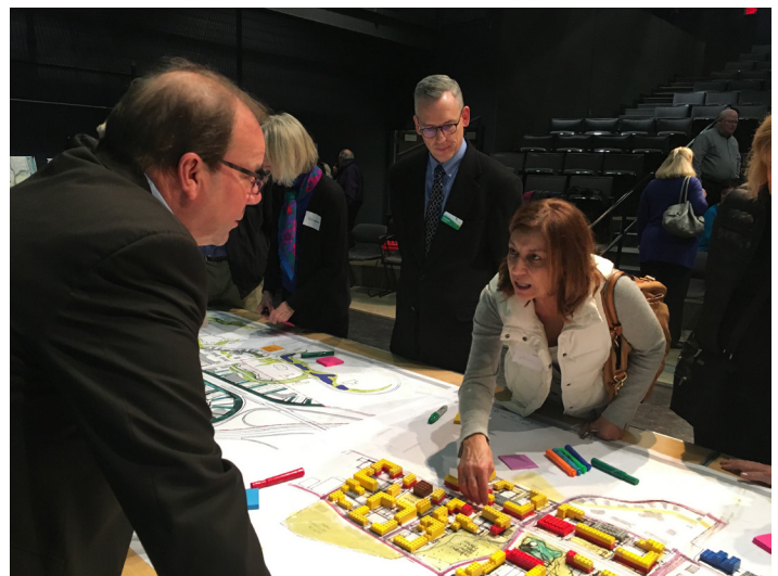
Public Open House Engagement: January 24, 2017