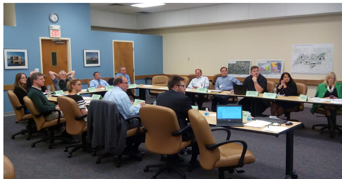
Working Group Engagement: November 3, 2016

To get input from key stakeholders within the study area, representatives from the Historic District Business Association, Casto Development, Carrowmoor HOA, Dublin Convention and Visitors Bureau, Olympus Homes, and Dublin City Schools, Toy Barn, and Waterford HOA were invited to be part of the stakeholder Working Group. The consultant team has met with this group twice during the first phase and will interface with this group throughout the process.