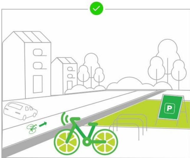
Do park near a bikerack or designated area.