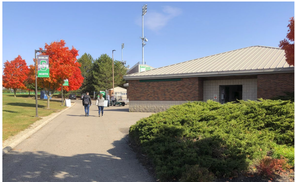
Above: Existing Stadium Concessions/Toilet Building (South of Stadium, One of Two)

It is the intent to match existing brick and mortar color as well as the color of the lighter buff colored split-faced CMU base. Unfortunately, the split-faced CMU base has not weathered well over the years (areas of discoloration), therefore, we propose cast stone instead with a starter course of natural stone to avoid wicking.