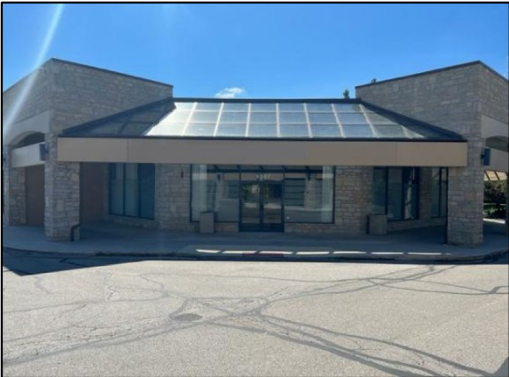
Existing Tenant Space