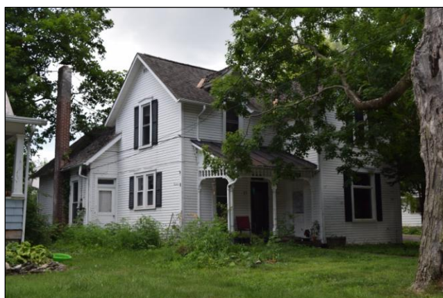
27 N Riverview St, looking northwest

District: Yes Local Historic Dublin district Contributing Status: Recommended contributing National Register: Recommended Dublin High Street Historic District, boundary increase Property Name: N/A