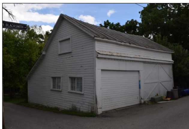
27 N Riverview St, carriage barn, looking southeast