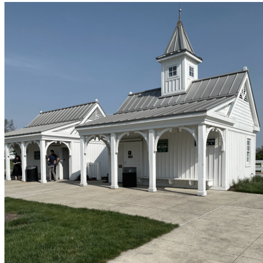
EXISTING NORTHEAST RESTROOMS

THE DESIGN INTENT FOR THE PROPOSED RESTROOM AND CONCESSIONS BUILDING IS TO MATCH THE EXISTING ARCHITECTURAL STYLE AND MATERIALS AT DARREE FIELDS PARK.