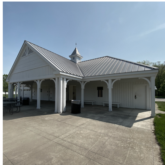
EXISTING MIRACLE FIELD RESTROOMS