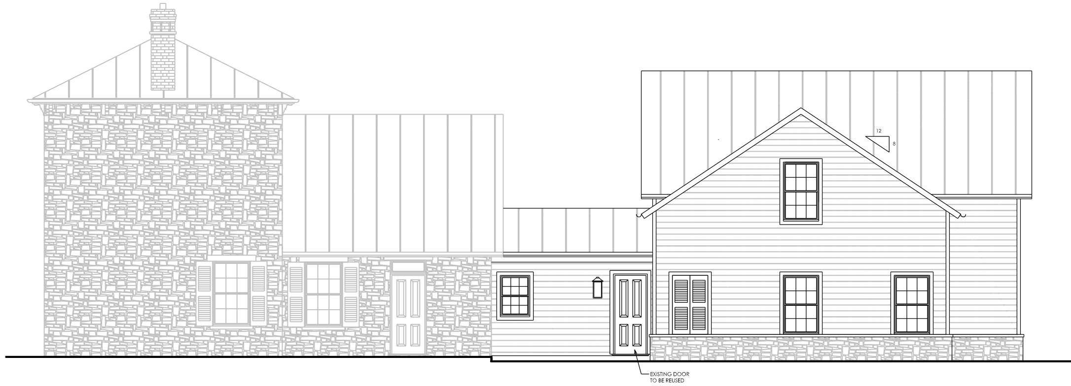
RIGHT ELEVATION SCALE: 1/8" = 1'-0"