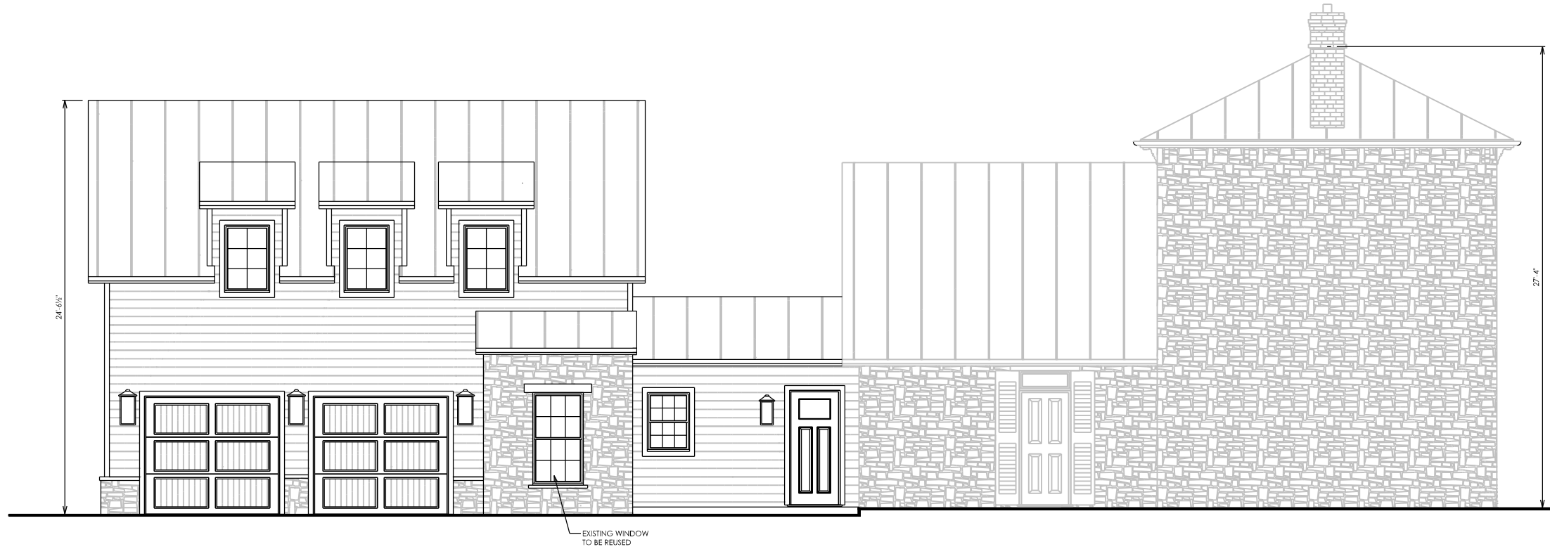
LEFT ELEVATION SCALE: 1/8" = 1'-0"