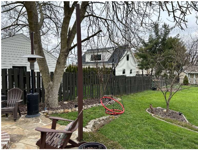
Back Yard Looking North-East