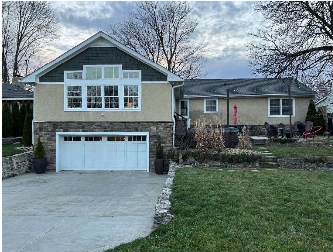
Rear Elevation (East)