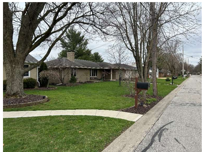
Adjacent Neighbor(s) Looking South-East