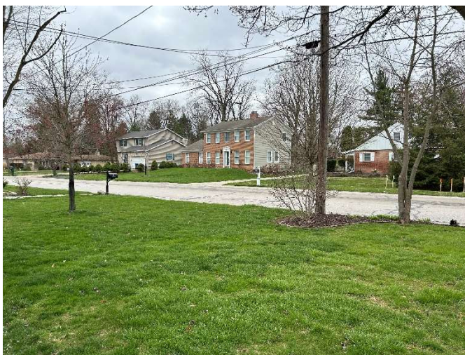
Front Yard Looking South-West