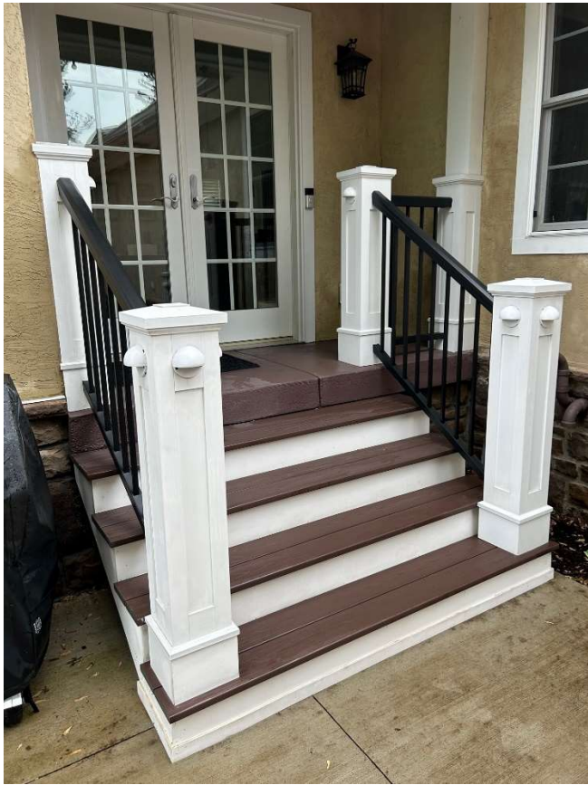
Existing rear porch stoop, concrete, stairs, treads, railing, post. New to match Existing.