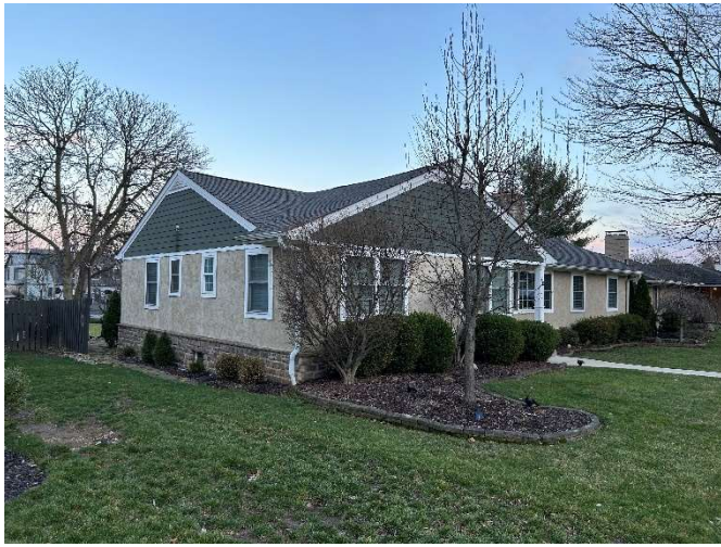
Front Corner Elevation (North-West)