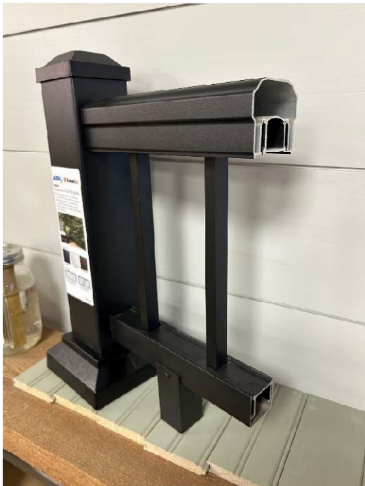
Black aluminum stoop/stair railing profile. New to match Existing.