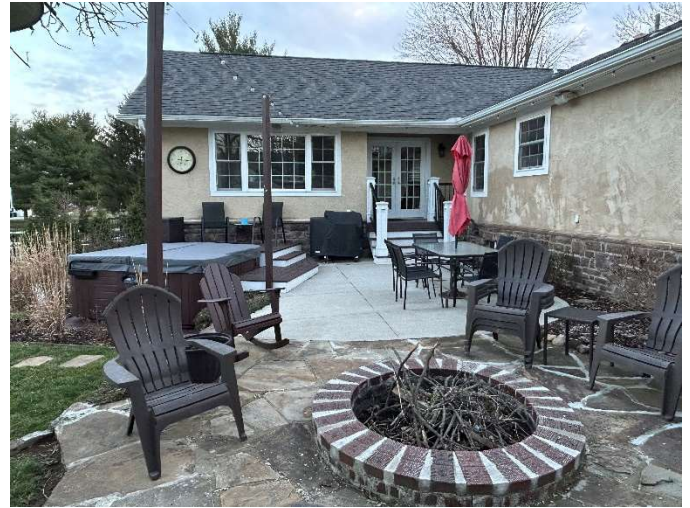
Rear Corner Elevation (North)