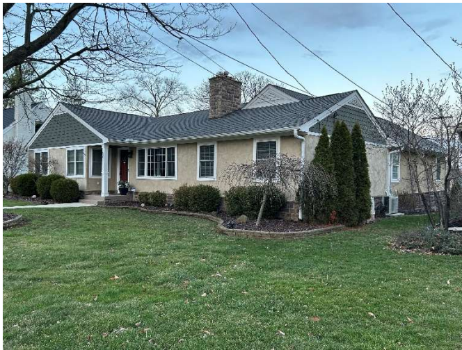
Front Corner Elevation (South-West)