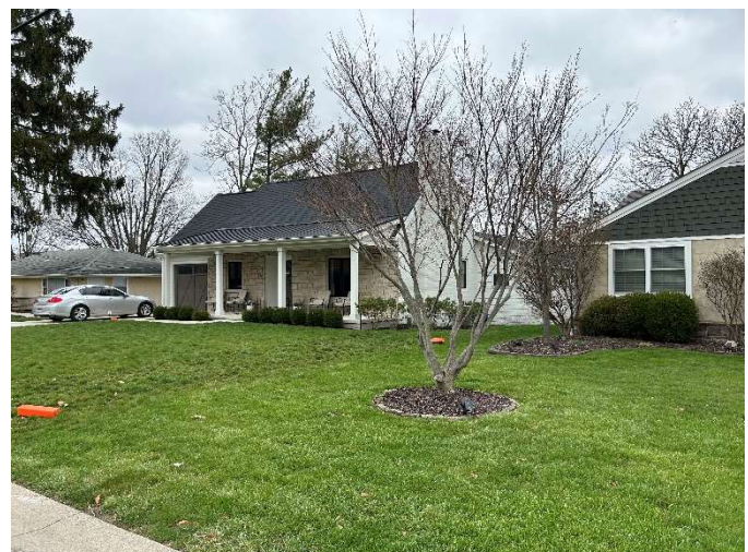
Adjacent Neighbor(s) Looking North-East