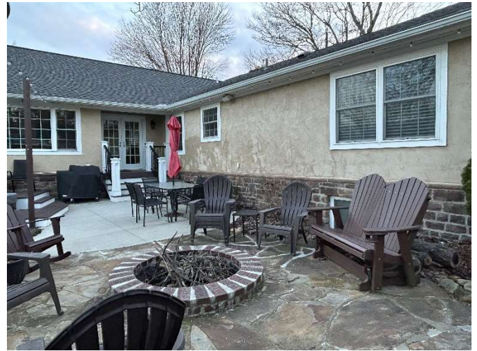
Rear Corner Elevation (North-East)