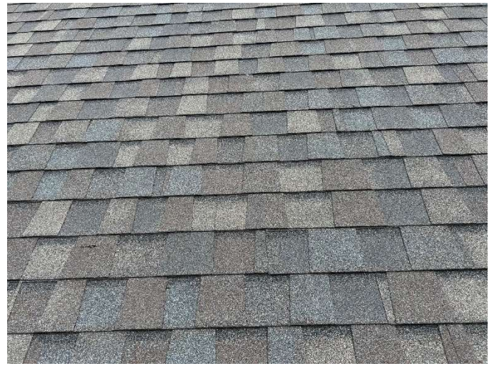
Existing Roof – New to match Existing