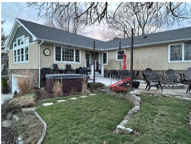
Rear Corner Elevation (North-East)