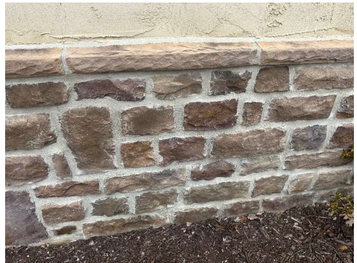
Existing - Stone, Sill, Stucco material New to match Existing