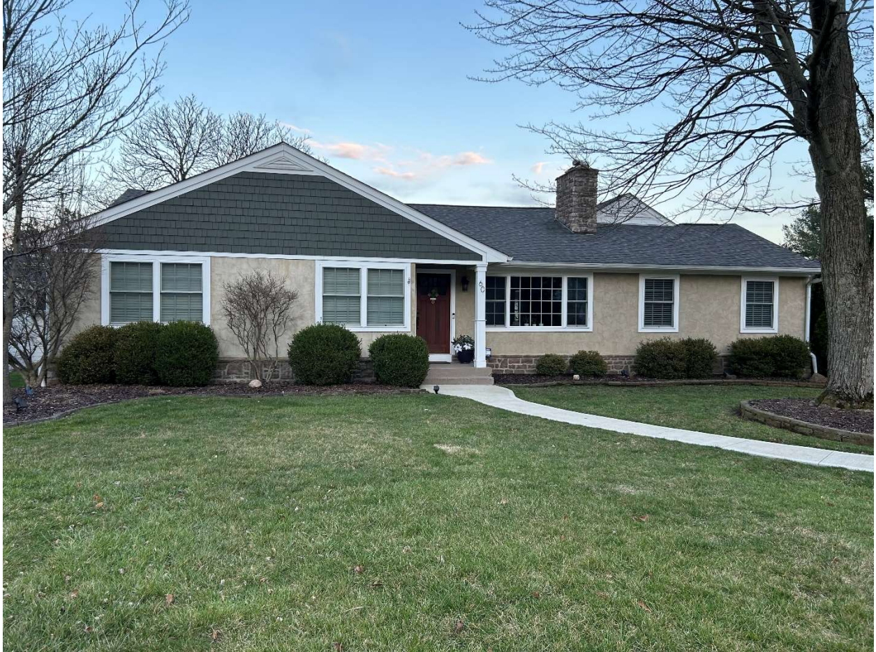
Front Elevation (West Facing Façade)