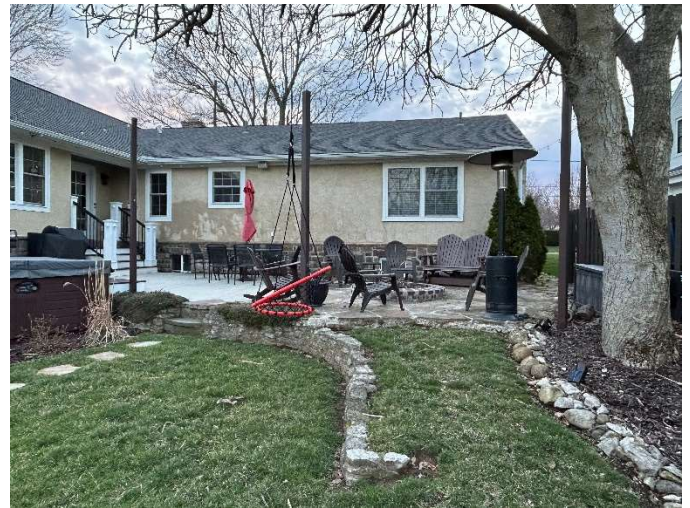
Rear Elevation (East) – Project Addition Area