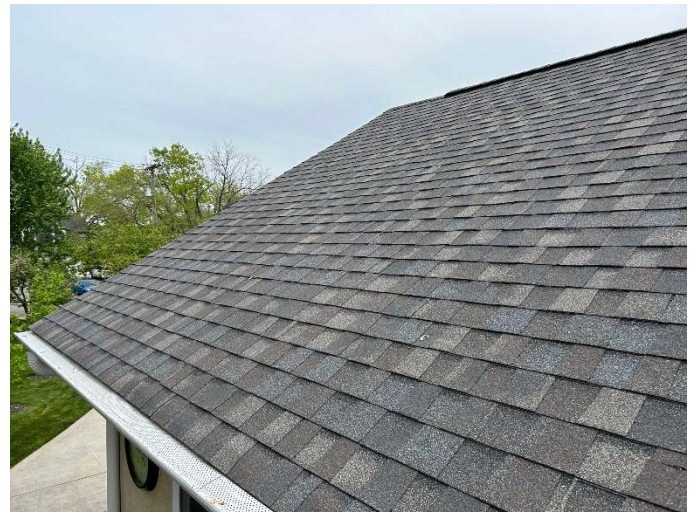
Existing Roof – New to match Existing