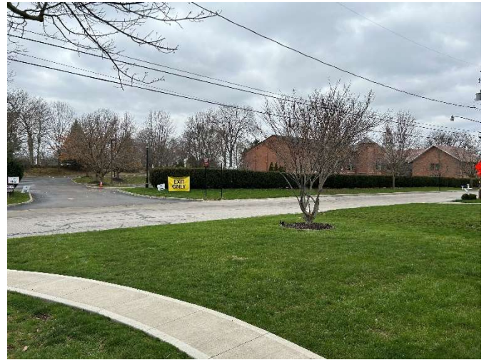
Front Yard Looking North-West (Church)