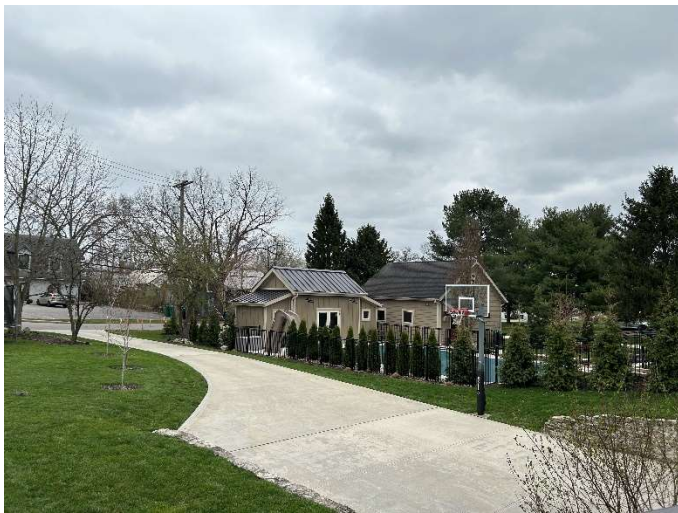
Back Yard Looking South-East