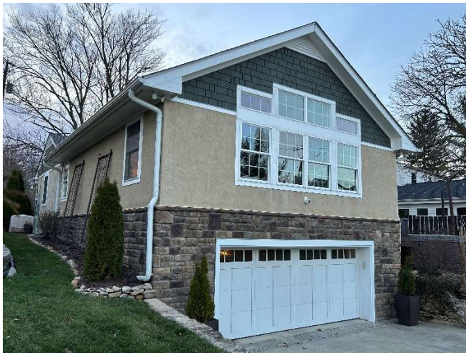
Rear Corner Elevation (South-East)