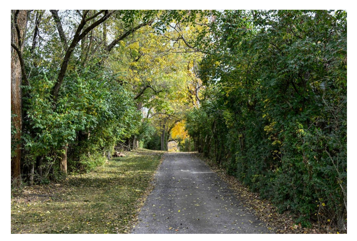
Example 1 (Private Driveway)