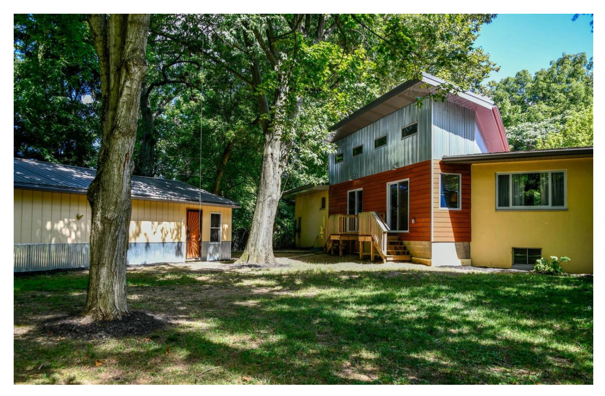
Example 5 (6721 Dublin Road, Previous Dwelling & Structure)