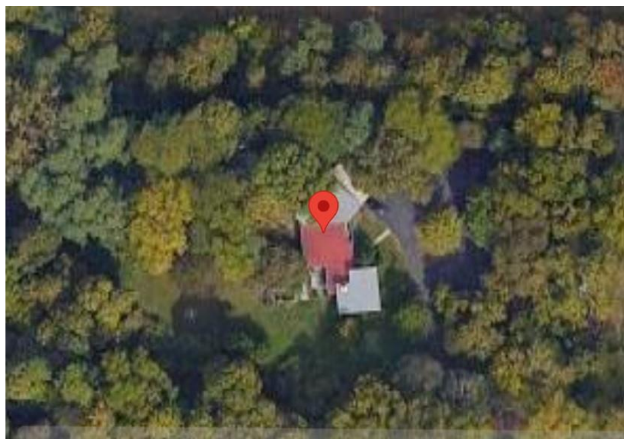
Example 7 (6721 Dublin Road)