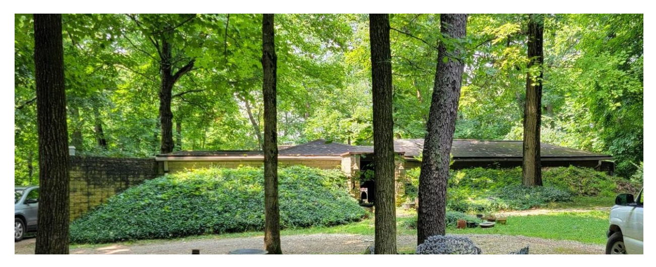
Example 3 (Neighbor to the West)