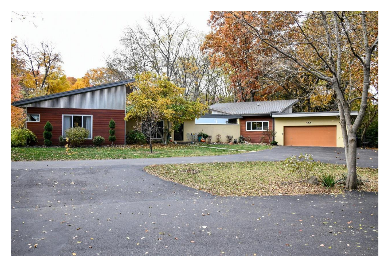
Example 4 (6721 Dublin Road, Previous Dwelling)