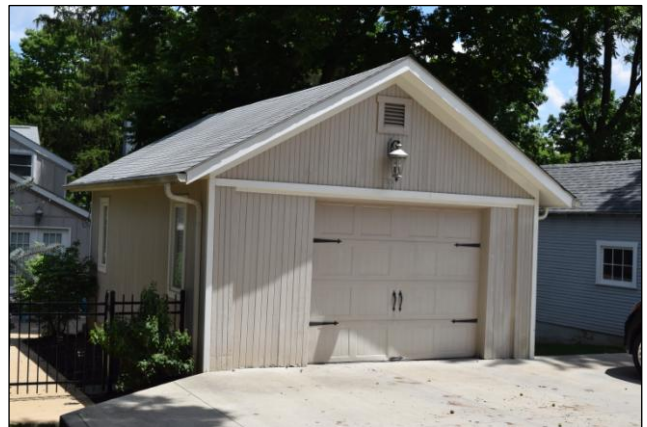
55 S Riverview St, garage, looking southeast