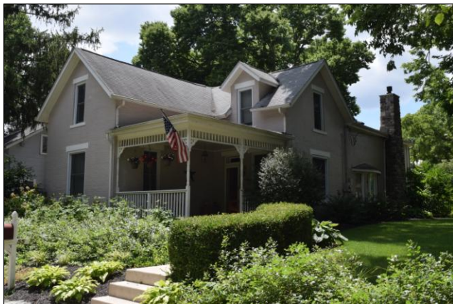
55 S Riverview St, looking southwest