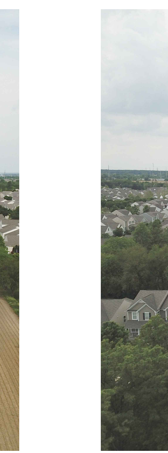
View 3: Southern Boundary Looking West