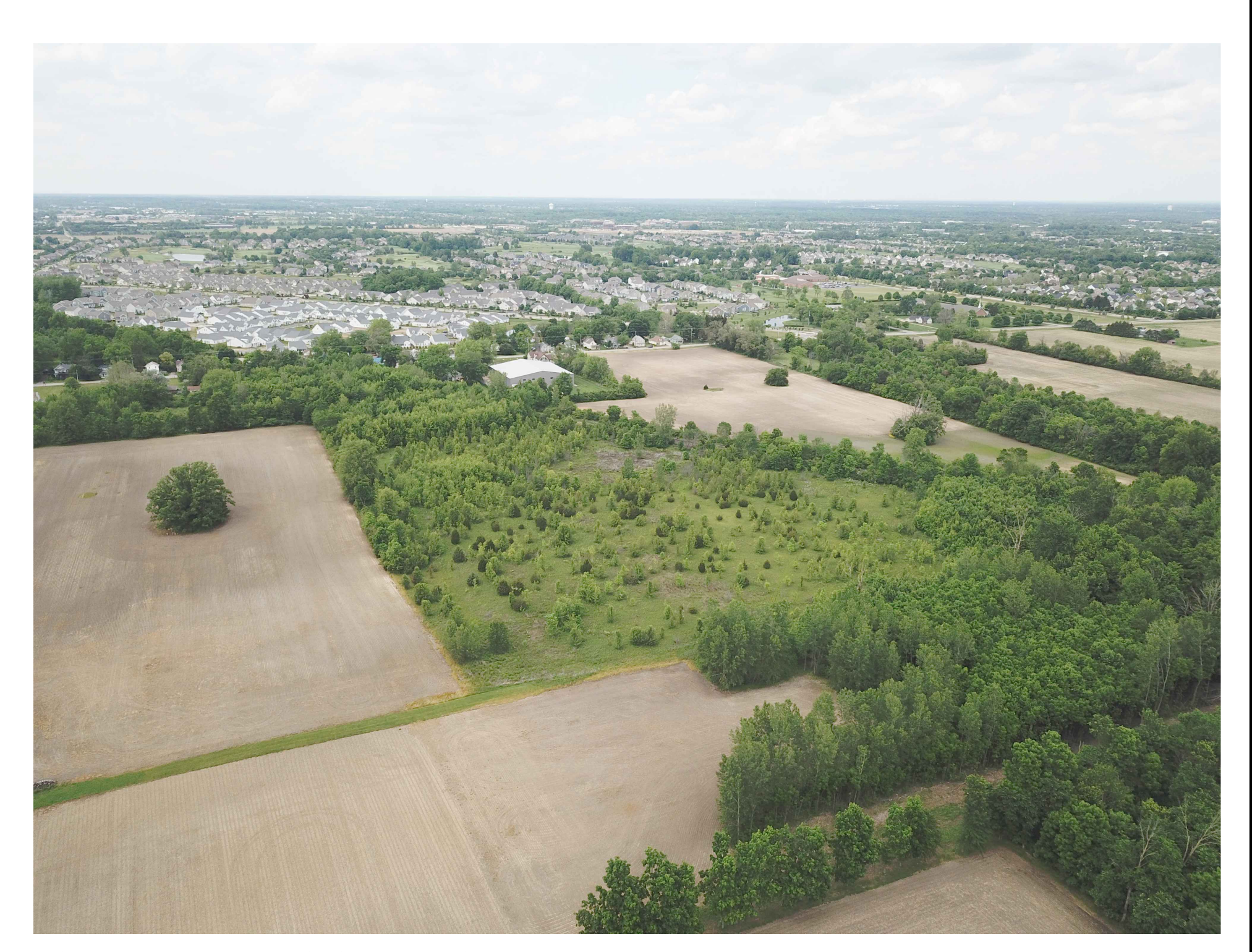
View 6: Center of Site Looking North-East