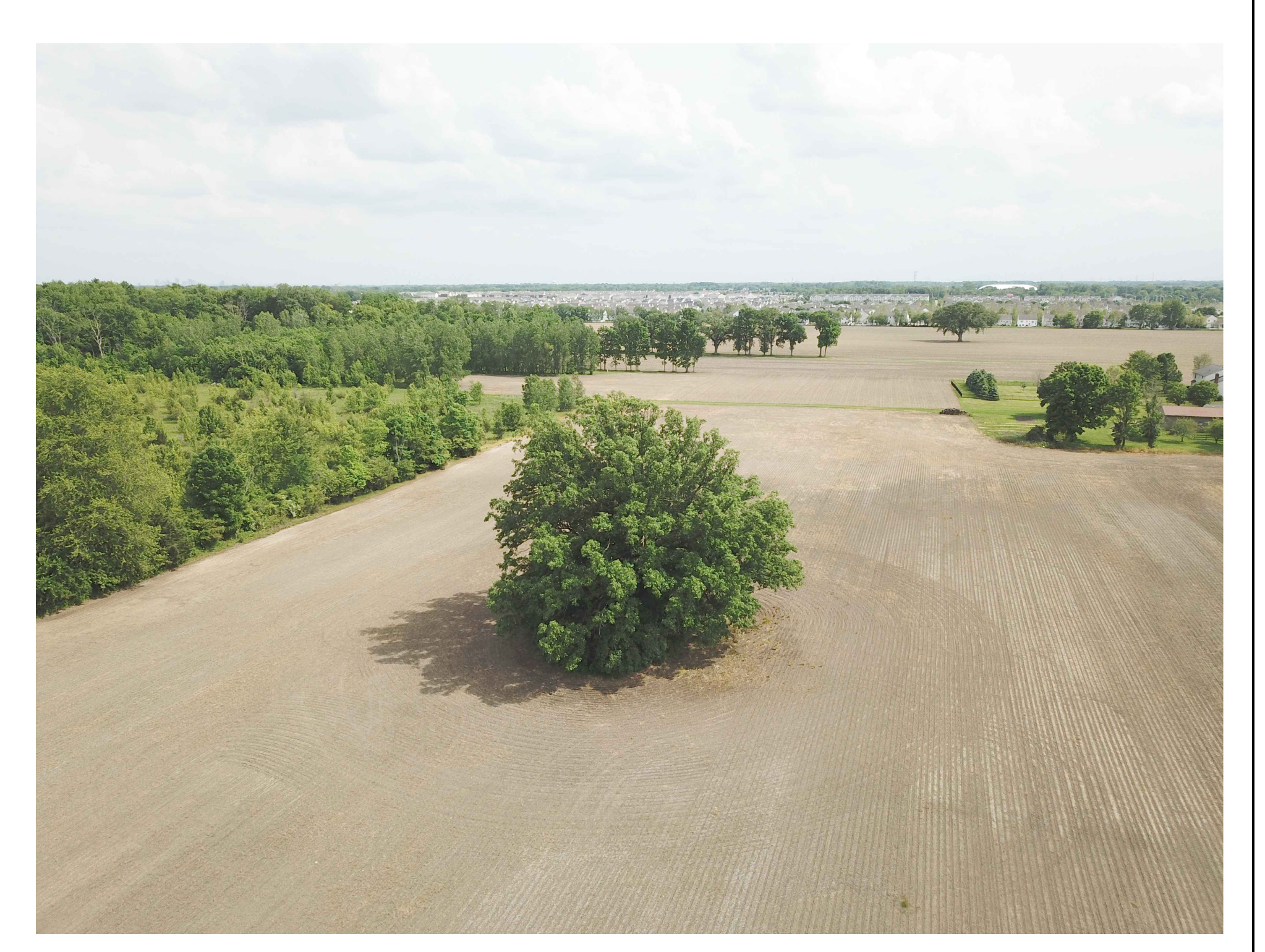
View 6: Northern Boundary Looking South