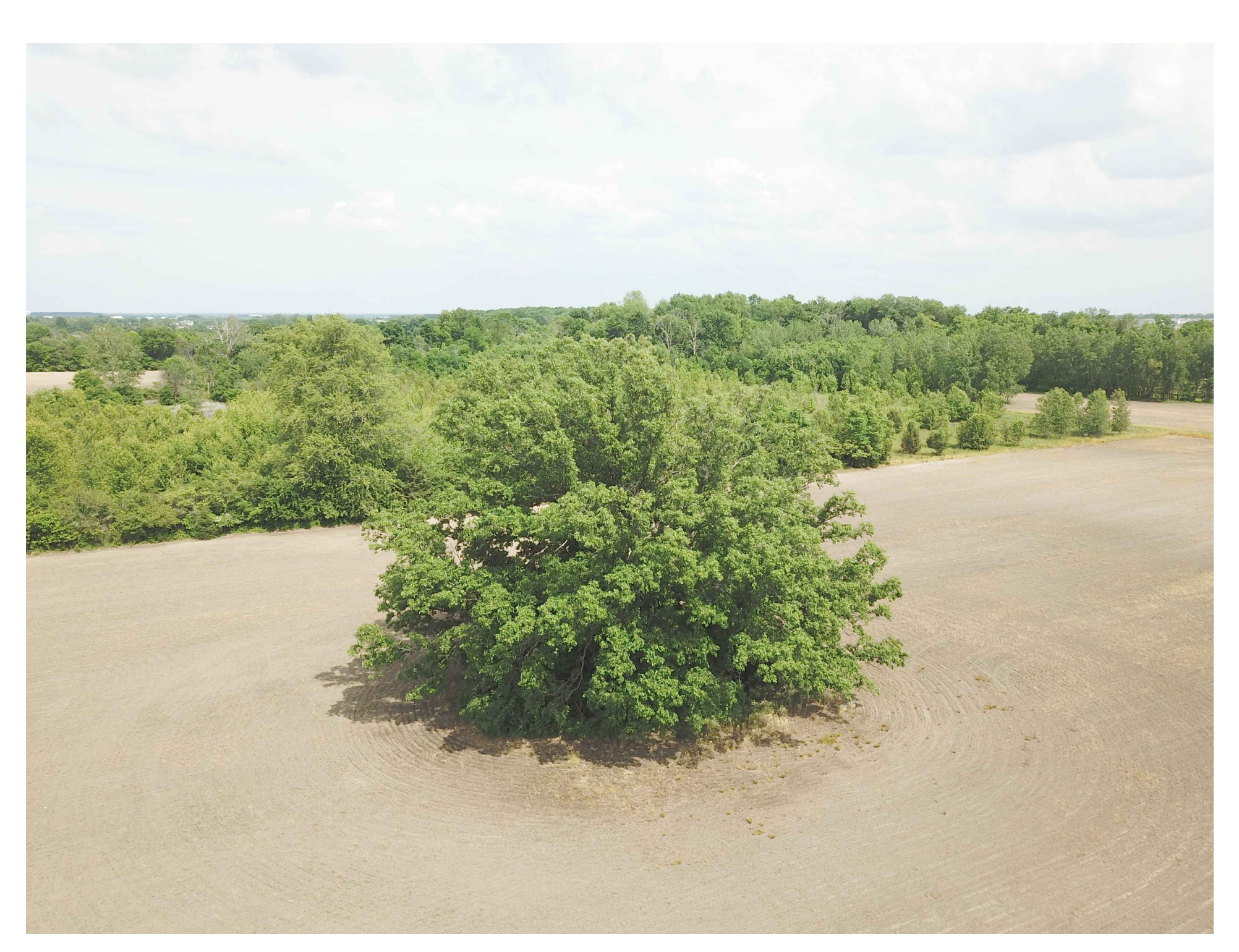
View 11: Northern Site Landmark Tree