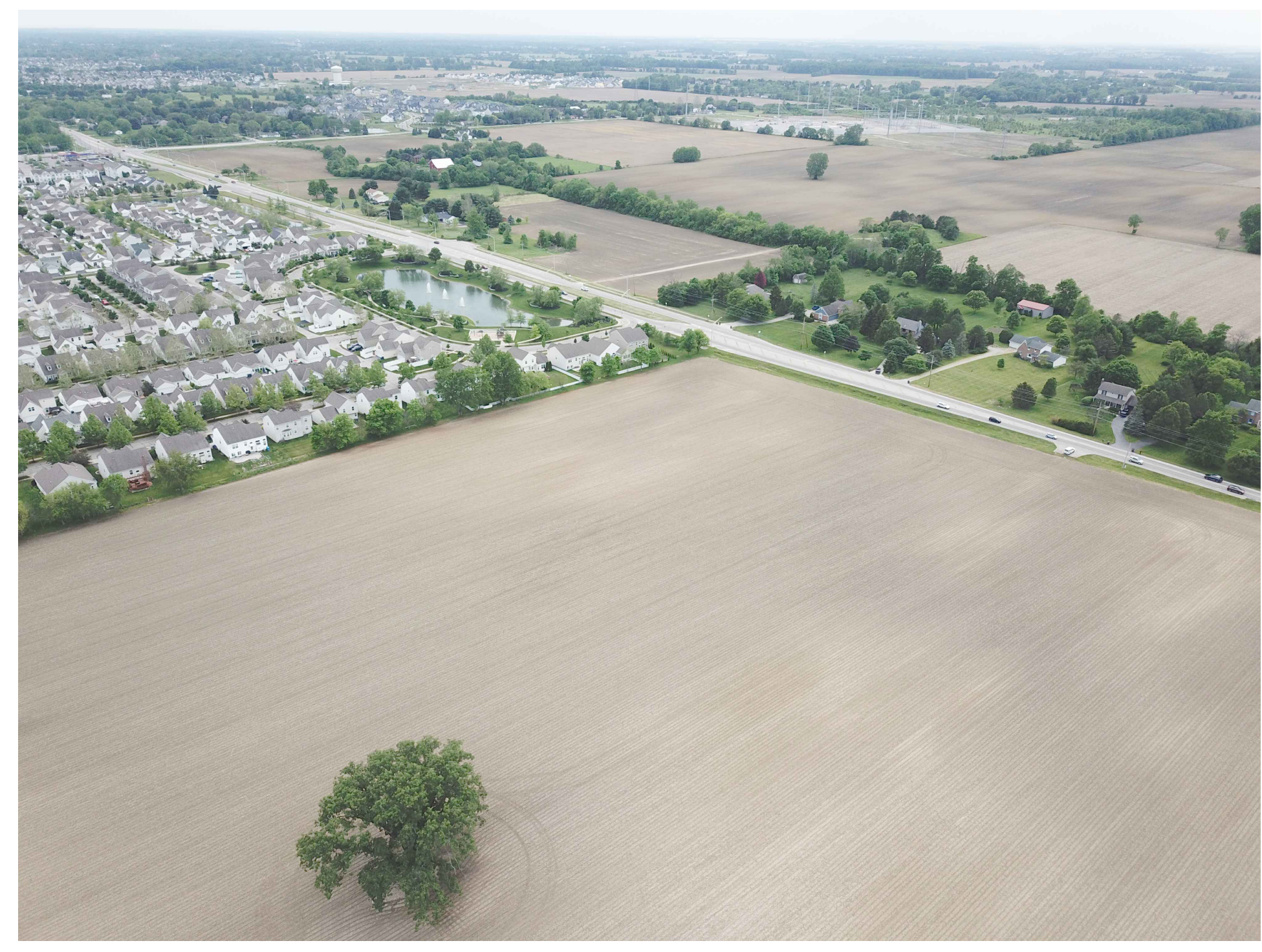
View 8: Center of Site Looking Southwest