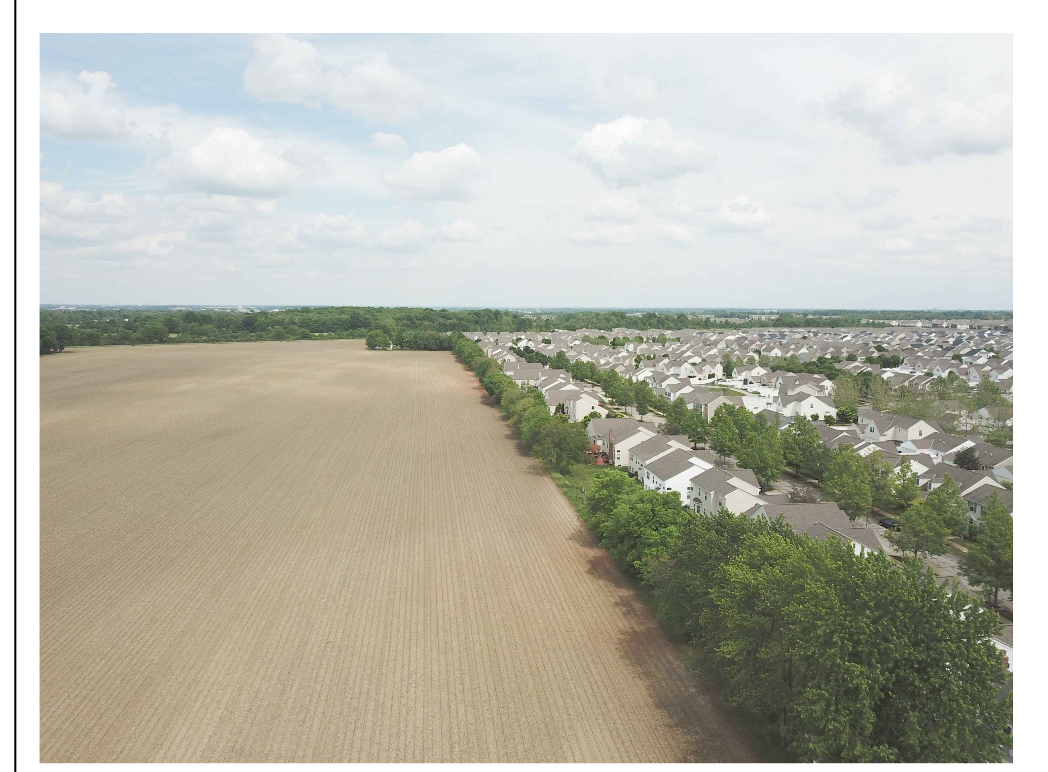
View 1: Southern Boundary Looking East