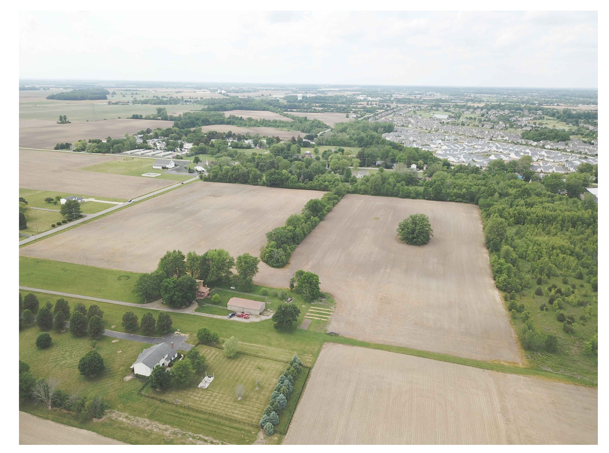
View 5: Center of Site Looking North-West