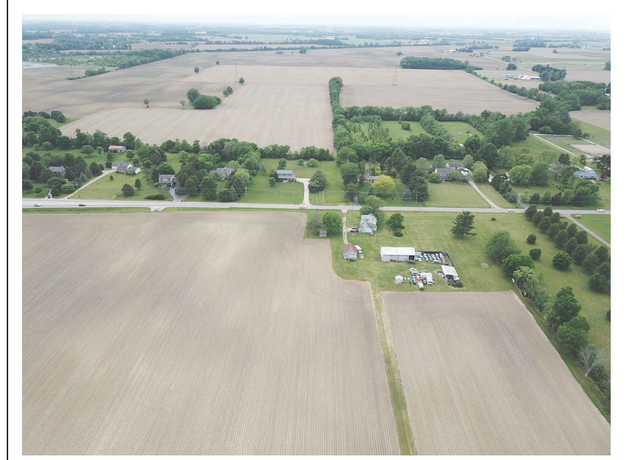
View 7: Center of Site Looking West