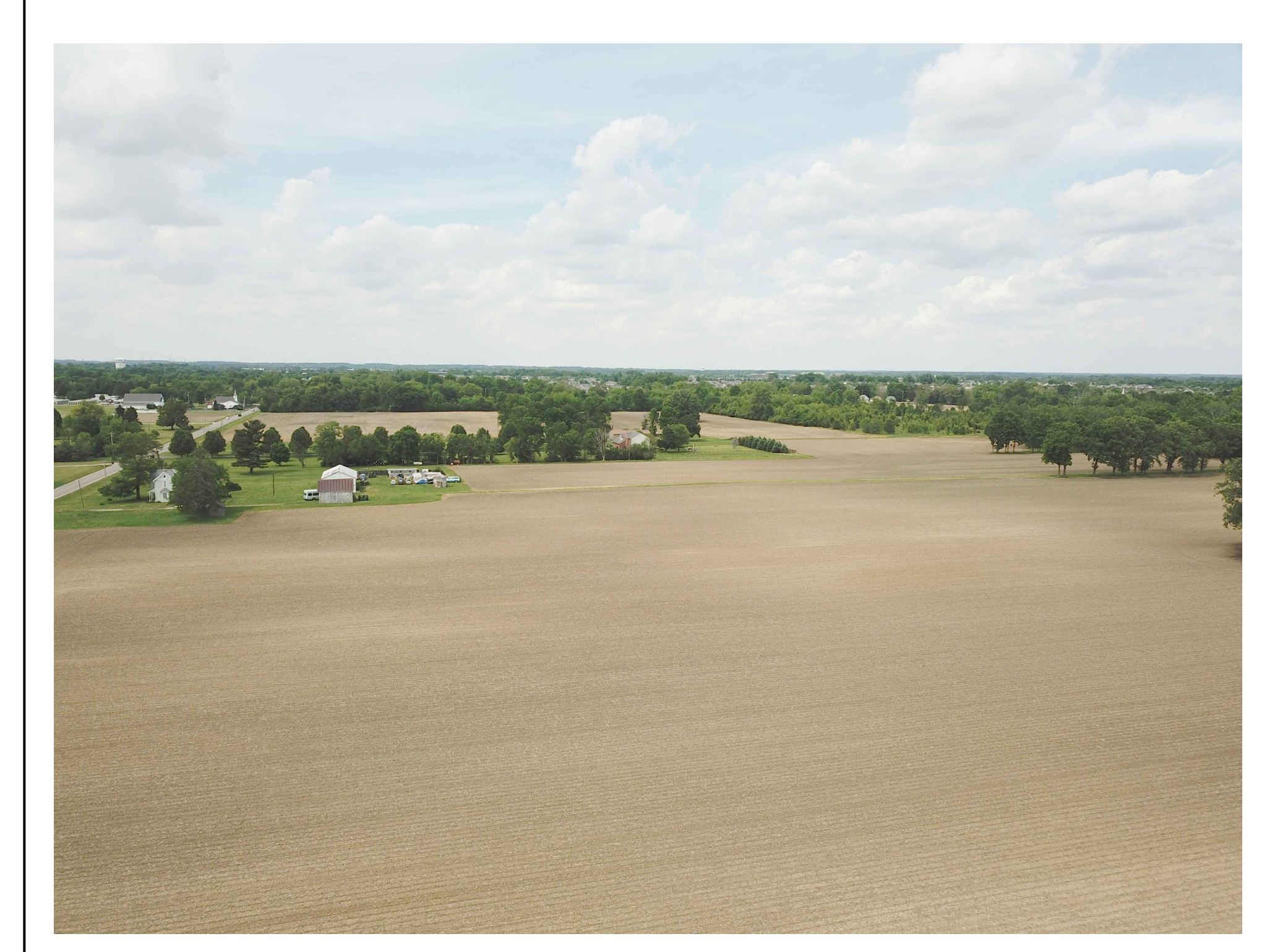
View 4: Southern Boundary Looking North