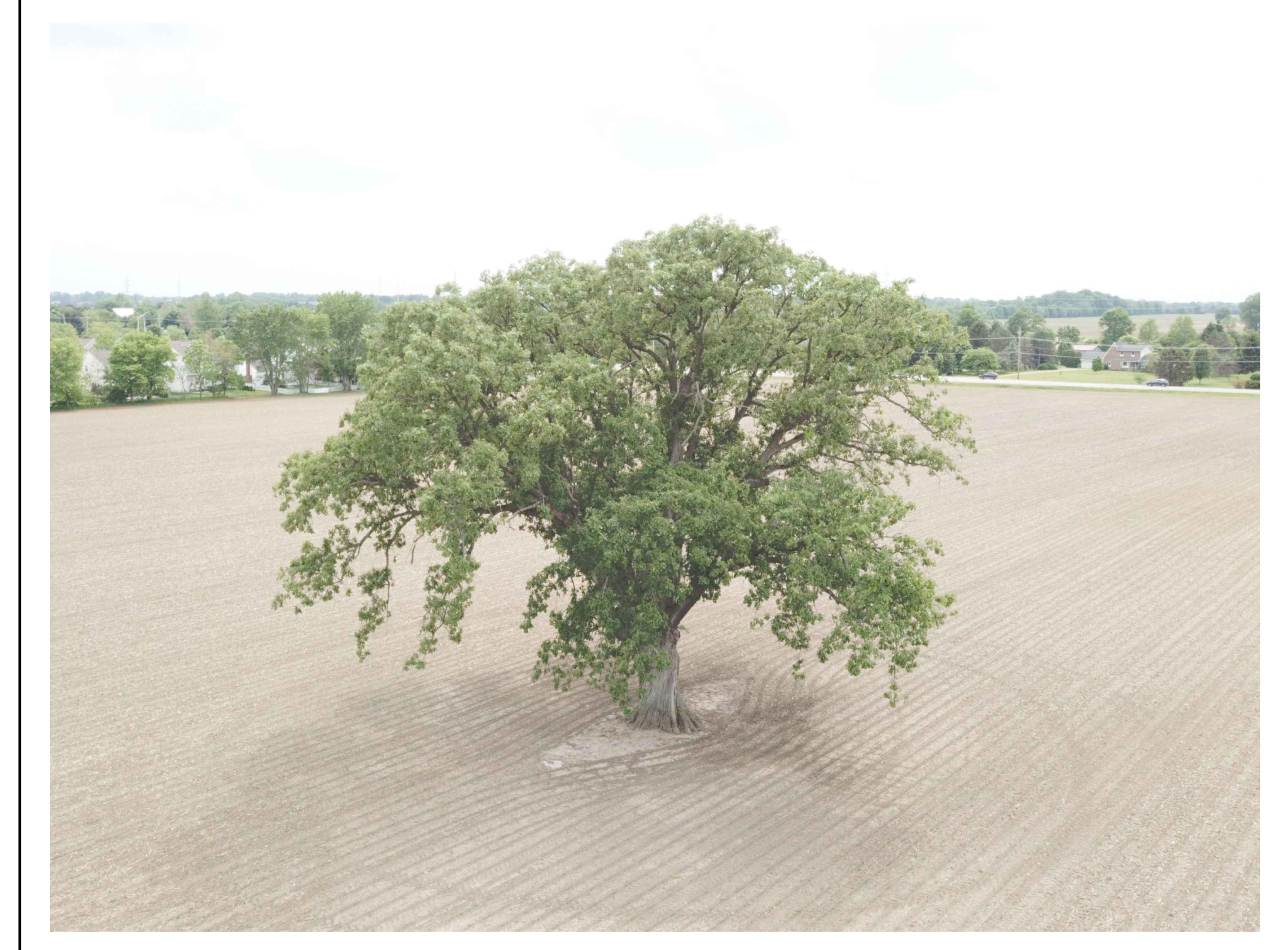
View 10: Southern Site Landmark Tree