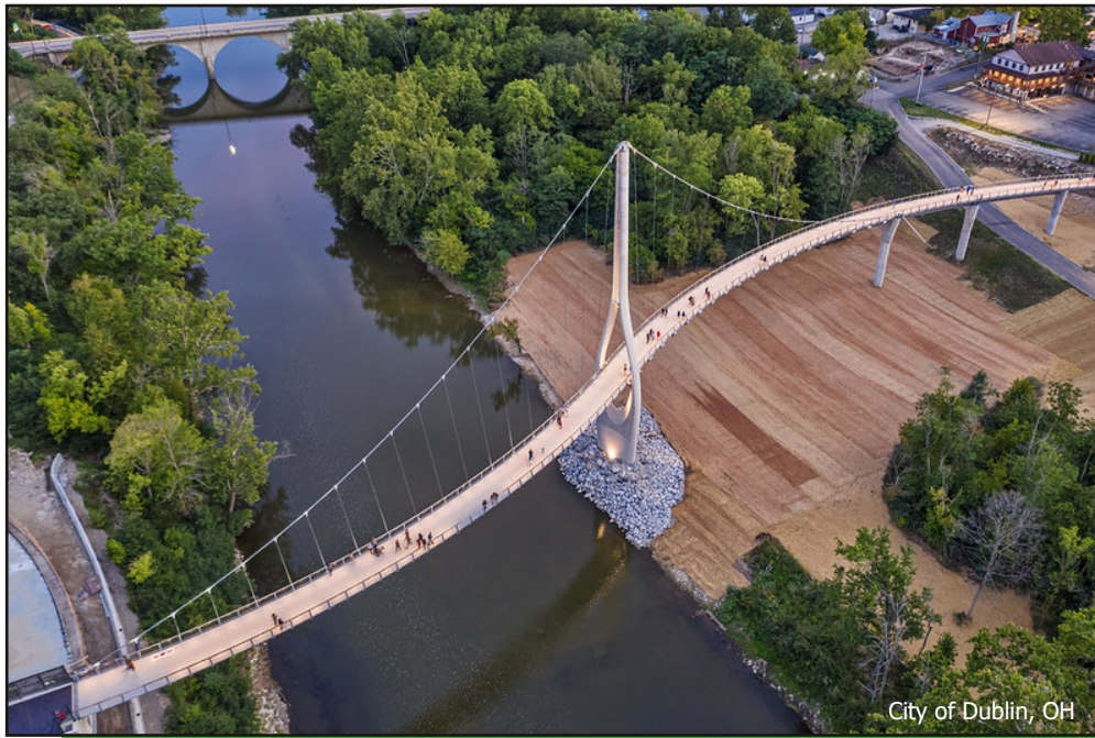
Dublin Link Pedestrian Bridge

i. PROPER SCALE OF DEVELOPMENT: Ensure the proper height, scale and massing of buildings within the Historic District to ensure the quaint nature of the area.