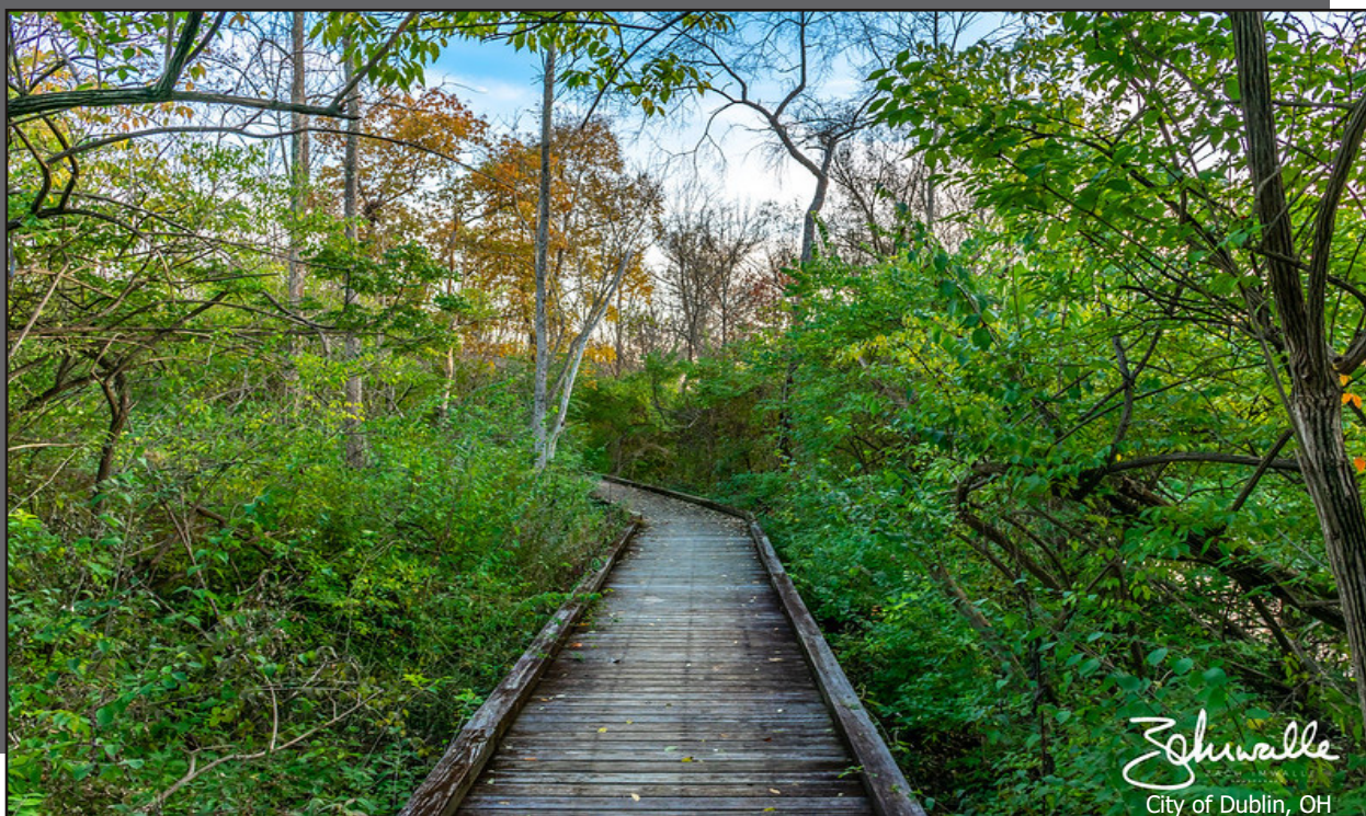
Existing Indian Run Falls Park Boardwalk