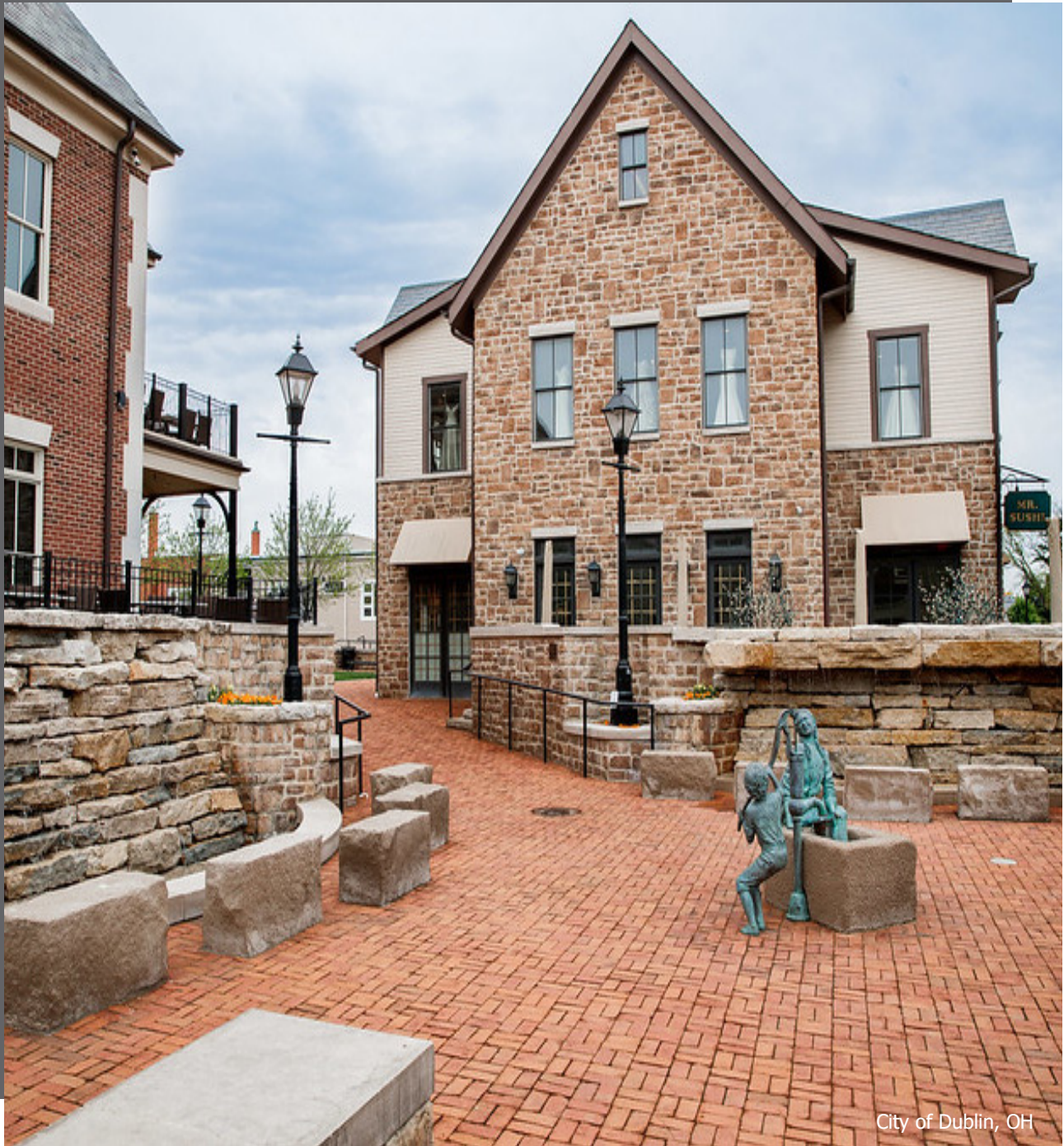
City of Dublin, OH

The Task Force was appointed to present their findings in the enclosed report which includes specific recommendations to City Council. The