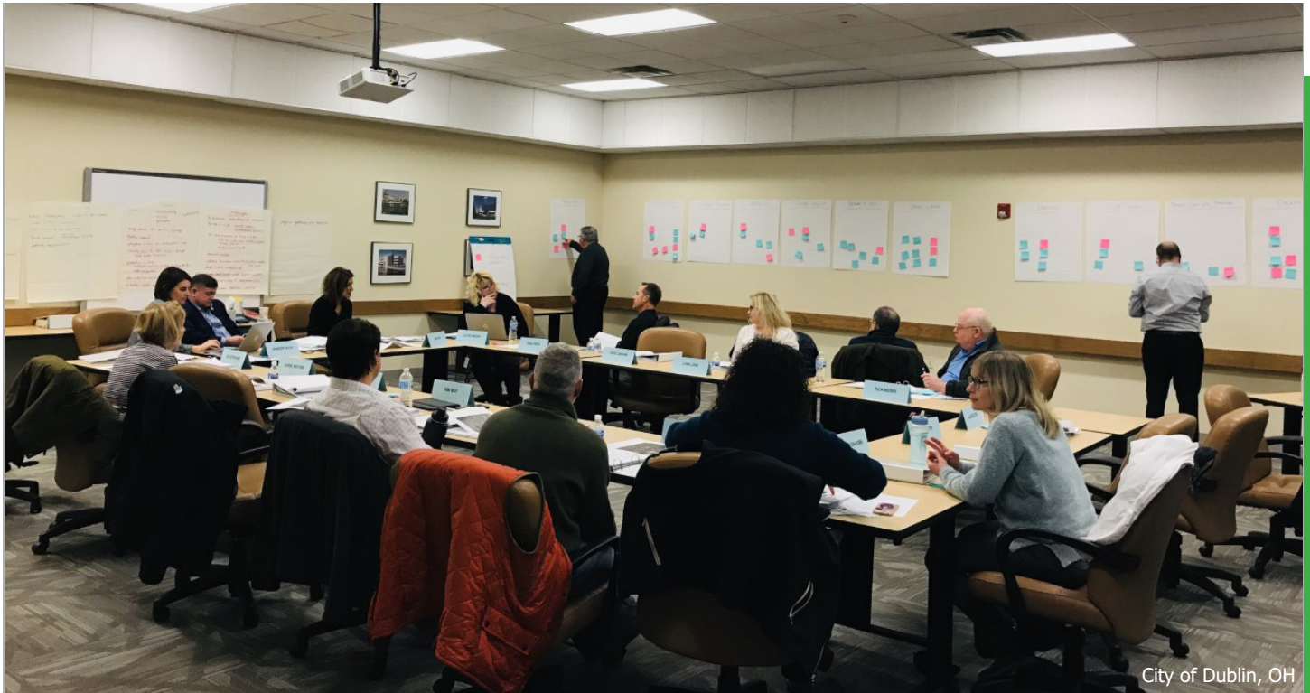
City of Dublin, OH