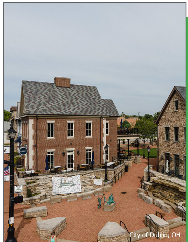
BriHi Development and Plaza