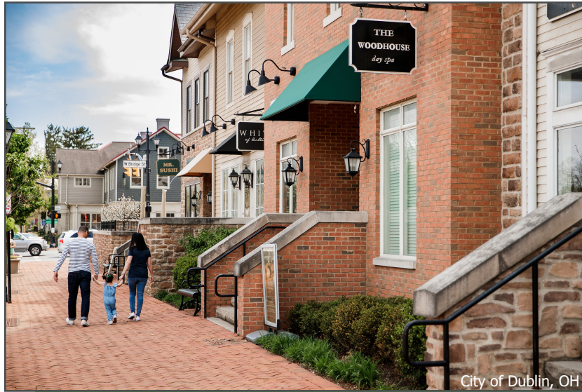
City of Dublin, OH North High Street

k. WAYFINDING: Ensuring that both pedestrian and vehicular movement is easily accessible throughout the District through appropriate signage and wayfinding.