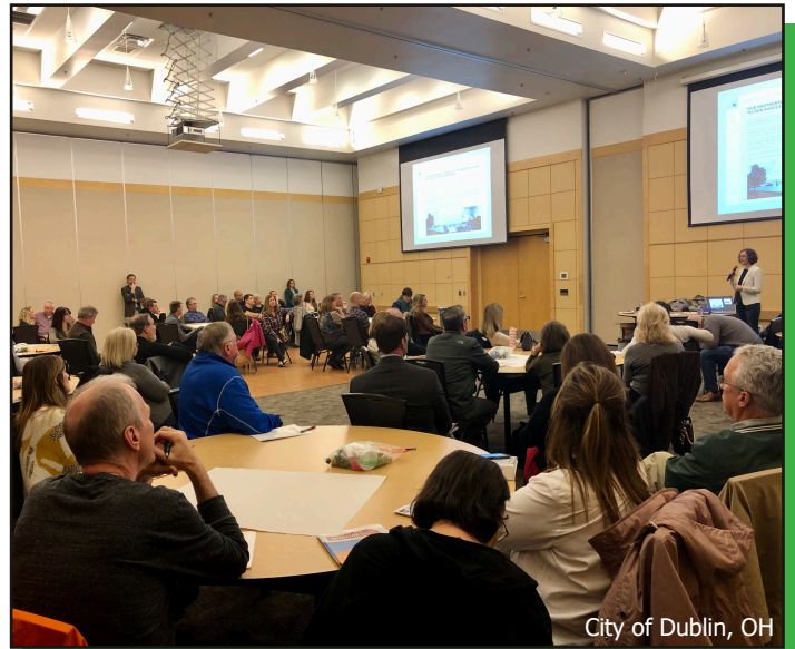
City of Dublin, OH

The first three meetings were educational in nature and included introductory comments from the City Manager and the Mayor, as well as other members of City Council as to the purpose and expectations of the Task Force. The meetings included an overview of planning principles by City staff that outlined the purpose and utilization of a Comprehensive Plan, as well as Special Area Plans in evaluating development proposals that were presented to the various Boards and Commissions, including City Council. The meetings also included a speaker series that involved our Economic Development and Finance teams to outline economic incentives and programs related to the Historic District. The presentation series also included presentations from various interest groups of the District including the Visit Dublin, the Historic Society, the Historic District Business Association and the Downtown Alliance. These presentations culminated in a two-and-a-half-day event with Heritage Ohio.