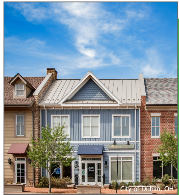
West Bridge Street Streetscape

b. STREETScape: Focus on a streetscape design that is pedestrian friendly and fits the character of the Historic District.