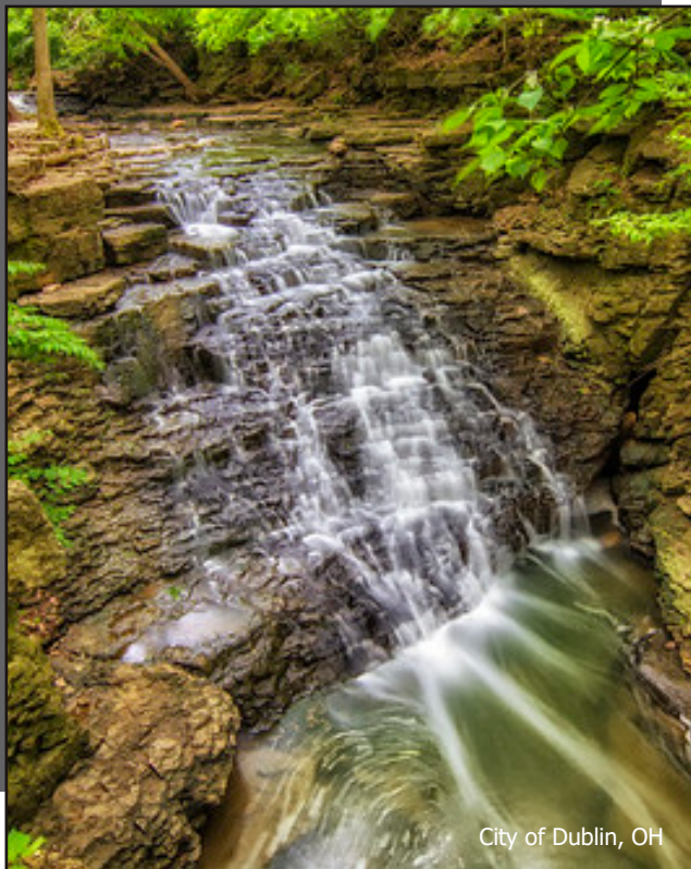
Schwan Falls at Indian Run