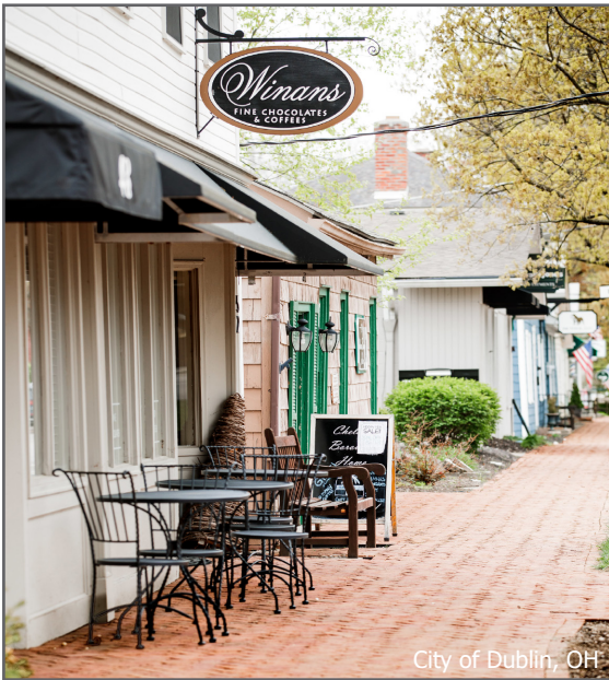
South High Street Sidewalk