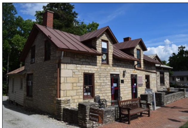
16 N High St, looking southeast