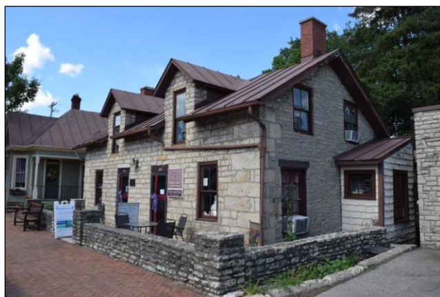
16 N High St, looking northeast

Contributing Status: Recommended contributing Property Name: Dr. McKittrick House/ Zenus Hutchinson House