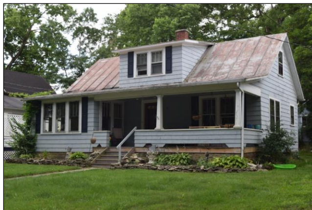
17 N Riverview St, looking southwest

District: Yes Local Historic Dublin district Contributing Status: Recommended contributing National Register: Recommended Dublin High Street Historic District, boundary increase Property Name: N/A