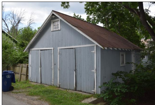
17 N Riverview St, garage, looking northeast