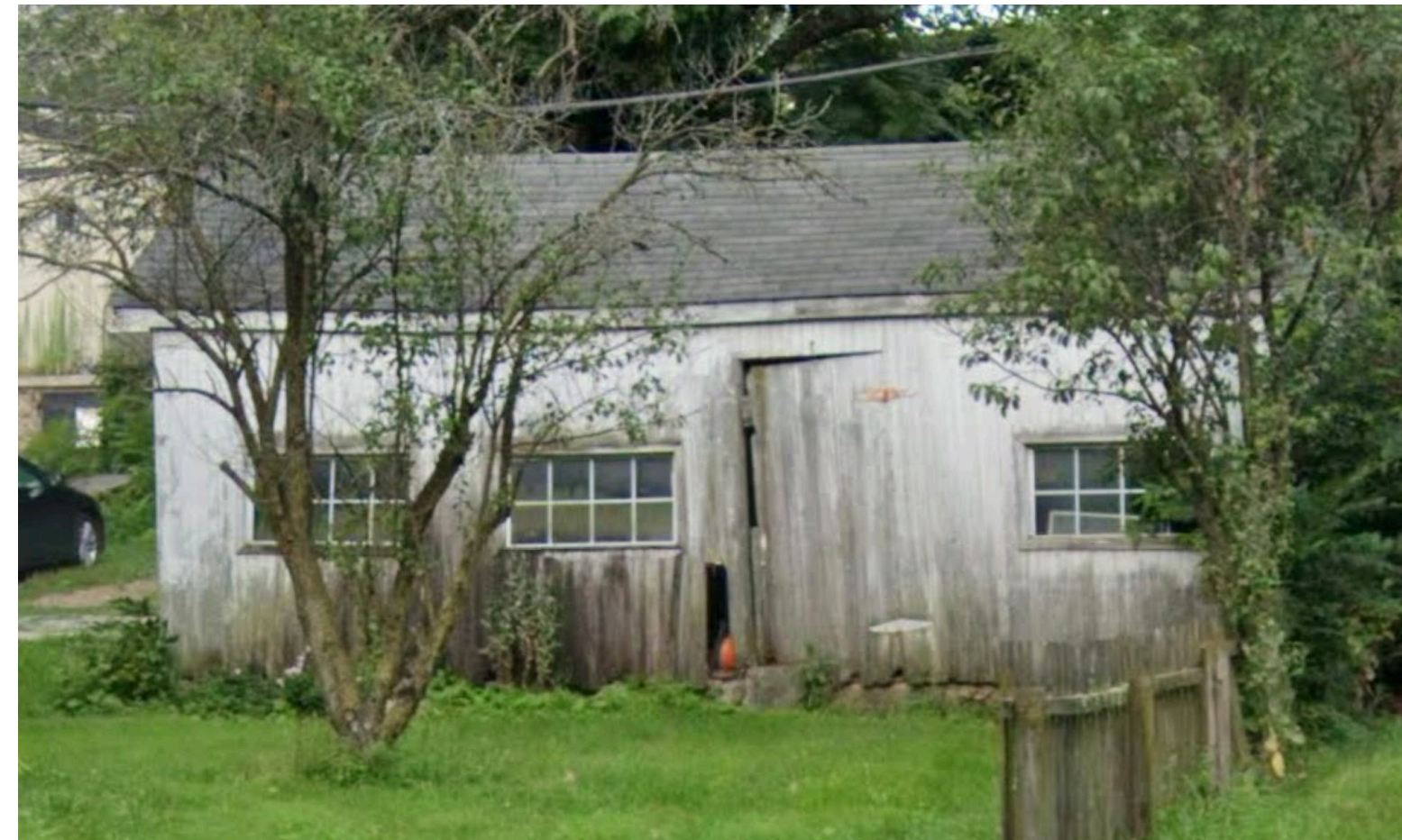
45 N RIVERVIEW STRUCTURE