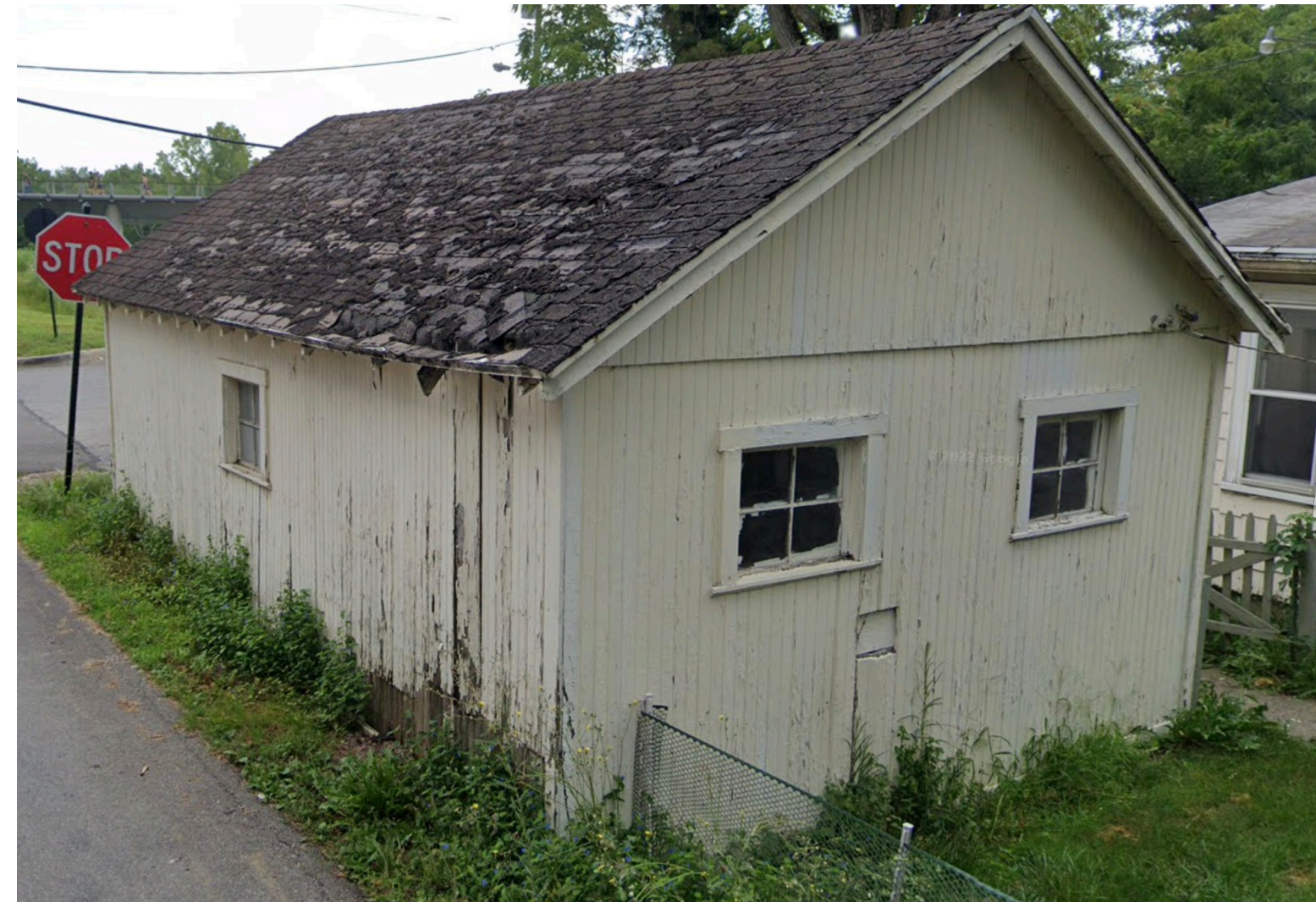
53 N RIVERVIEW STRUCTURE