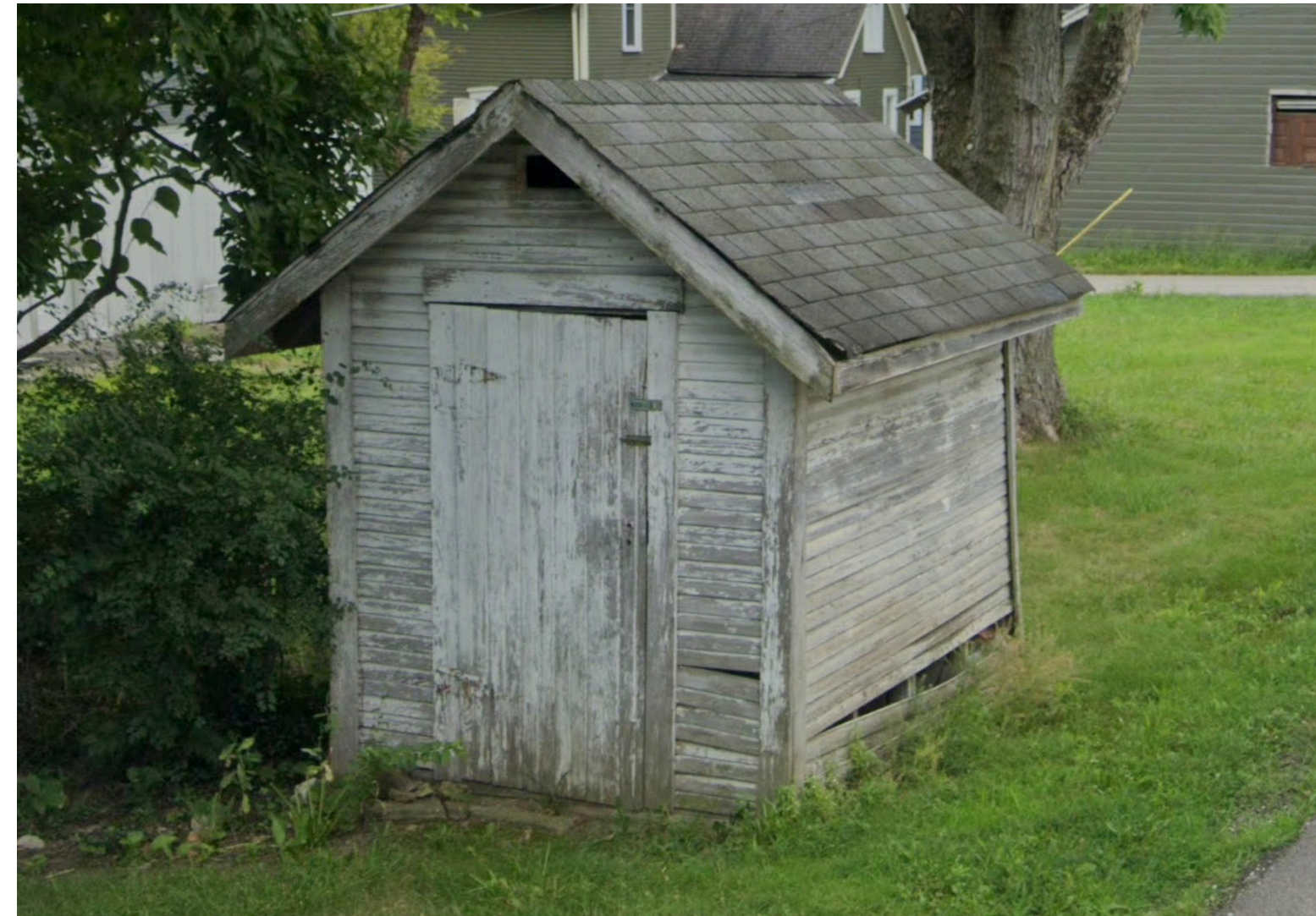
37 N RIVERVIEW STRUCTURE