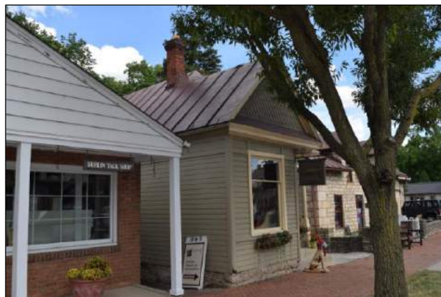
22 N High St, looking northeast