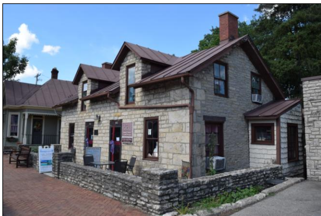
16 N High St, looking northeast

Contributing Status: Recommended contributing Property Name: Dr. McKittrick House/ Zenus Hutchinson House