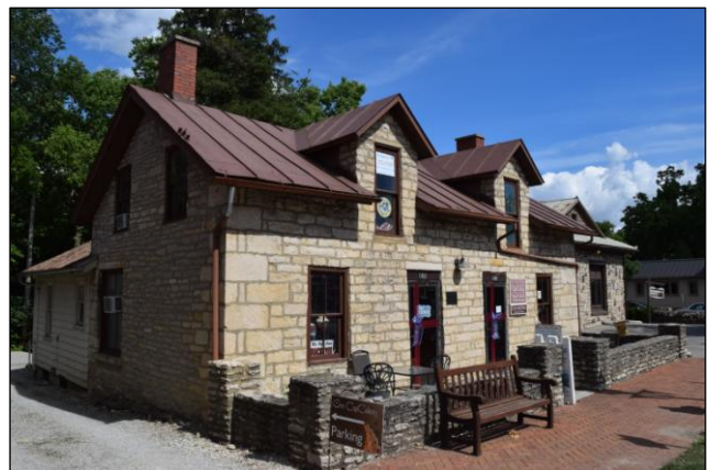
16 N High St, looking southeast