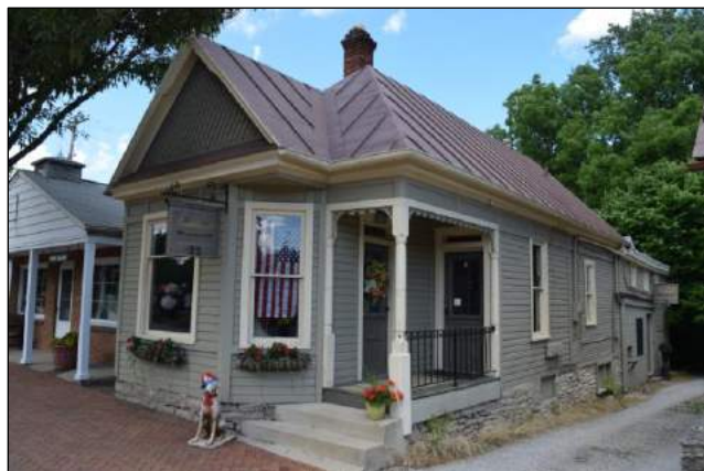
22 N High St, looking southeast