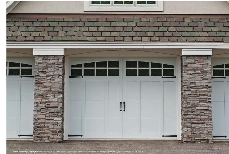
STEEL OVERLAY CARRIAGE HOUSE