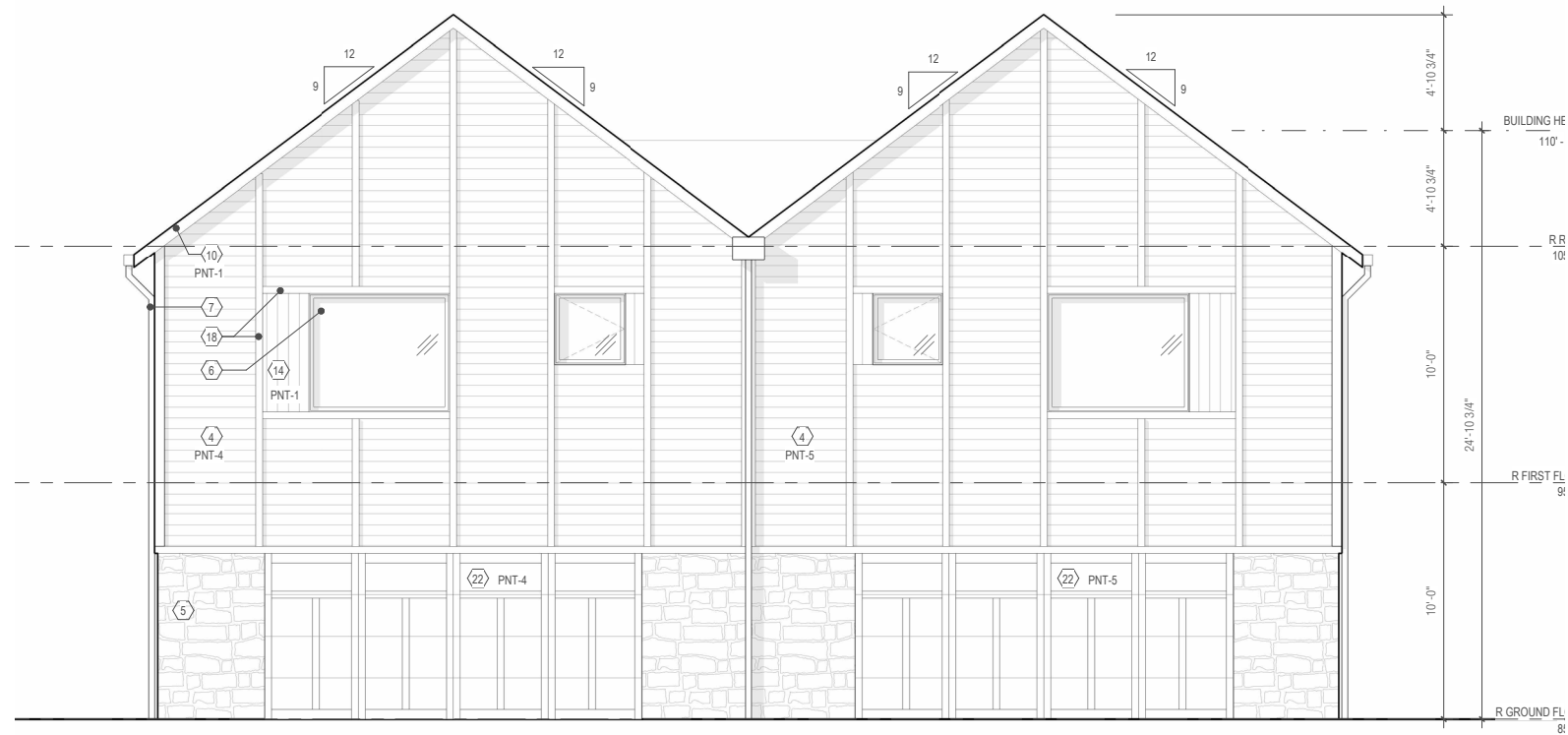
1 RESIDENTIAL BUILDING ELEVATION WEST 1/4" = 1'-0" SCALE : 1/8" = 1'-0" 0' 2' 4' 8' 16'