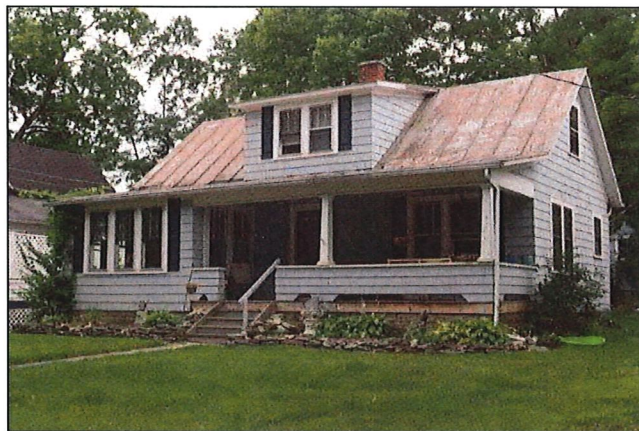
17 N Riverview St, looking southwest

District: Yes Local Historic Dublin district Contributing Status: Recommended contributing National Register: Recommended Dublin High Street Historic District, boundary increase Property Name: N/A