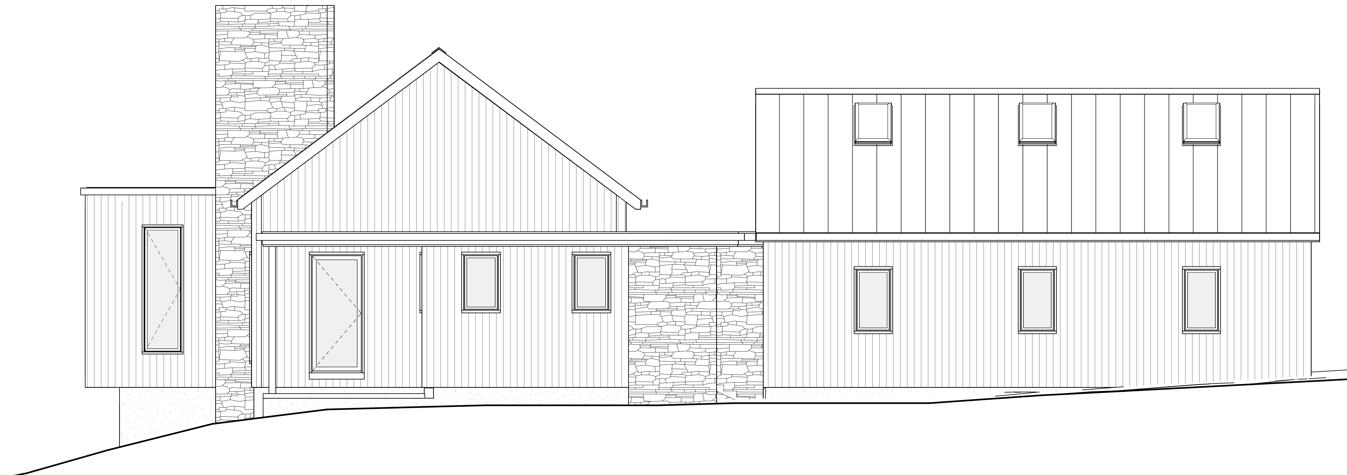
WEST ELEVATION 1/4" = 1'-0"

PROGRESS DRAWINGS NOT TO BE USED FOR CONSTRUCTION 10.31.2024