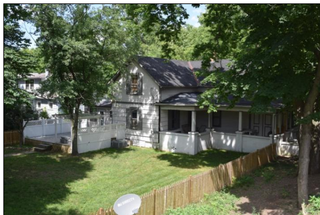
40 E Bridge St, looking northwest

District: Yes Local Historic Dublin district Contributing Status: Recommended contributing National Register: Recommended Dublin High Street Historic District, boundary increase Property Name: N/A