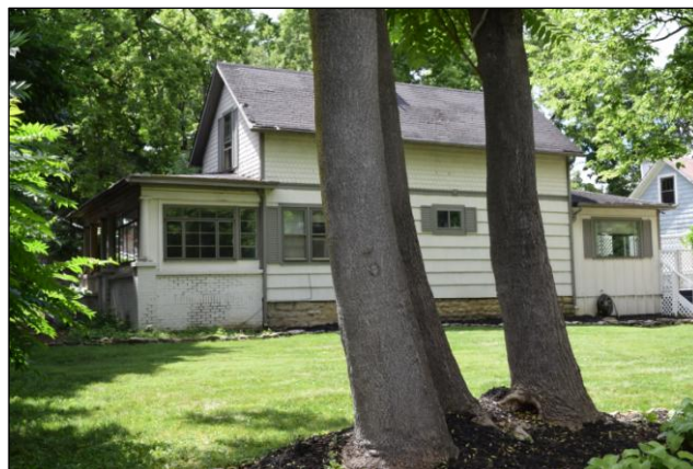
40 E Bridge St, looking northeast