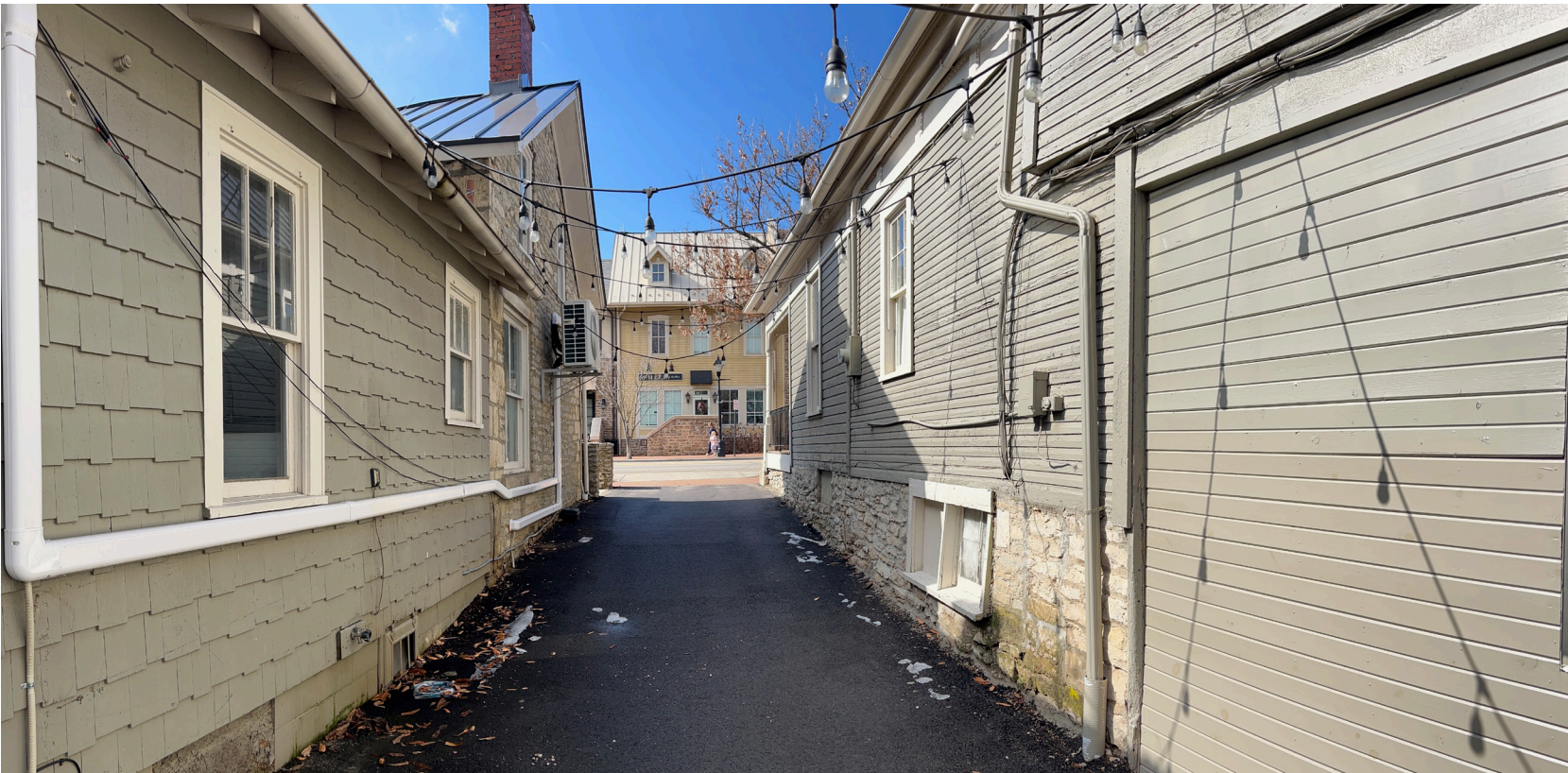
EXISTING ASPHALT DRIVE N HIGH TO REAR LOT ACCESS