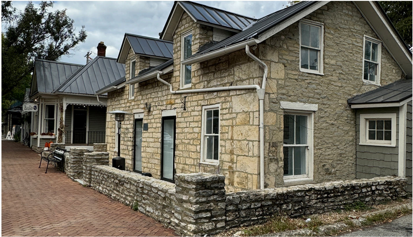
EXISTING STREET FRONT