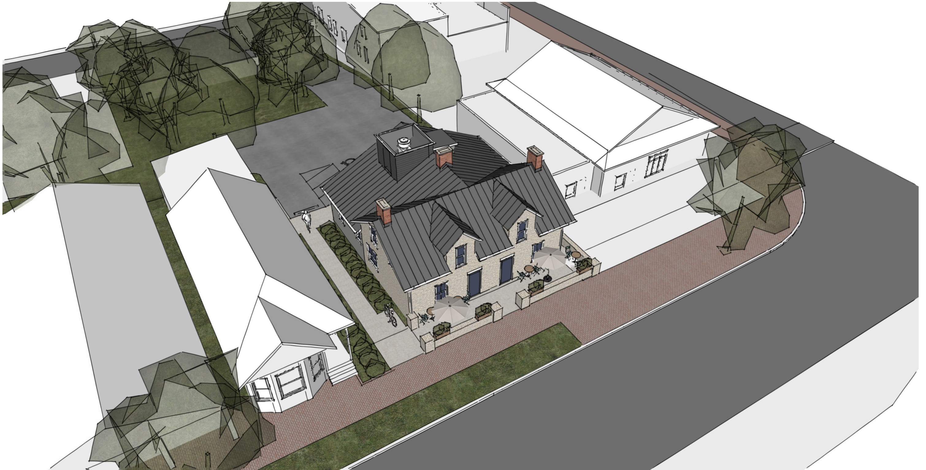
Birdseye View from the Northwest