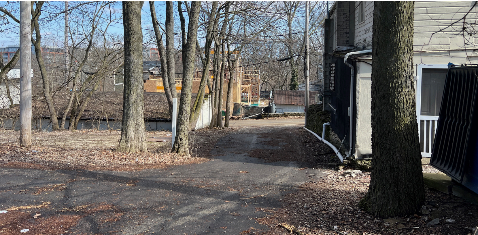
EXISTING ASPHALT DRIVE REAR LOT TO N BLACKSMITH ACCESS