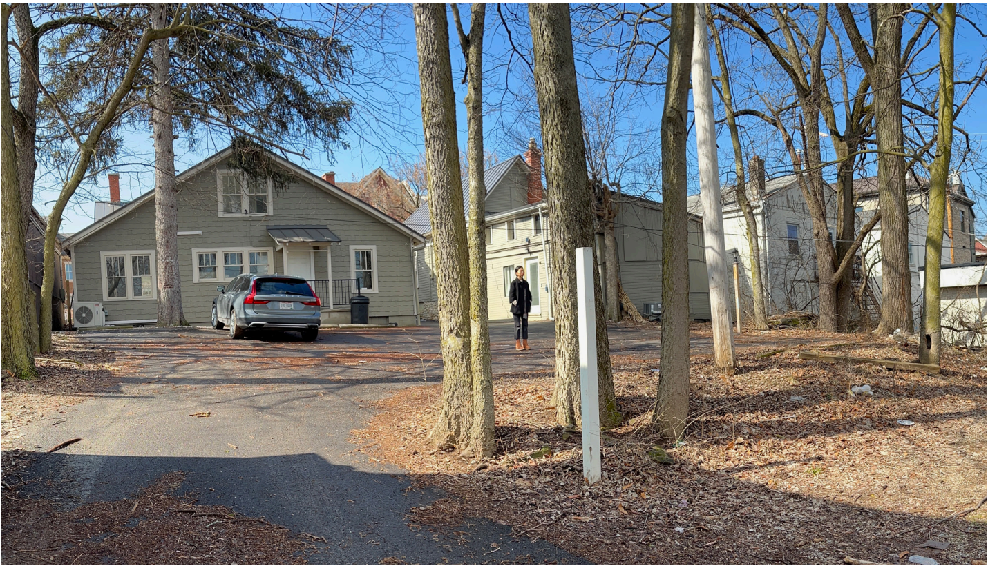
EXISTING REAR LOT