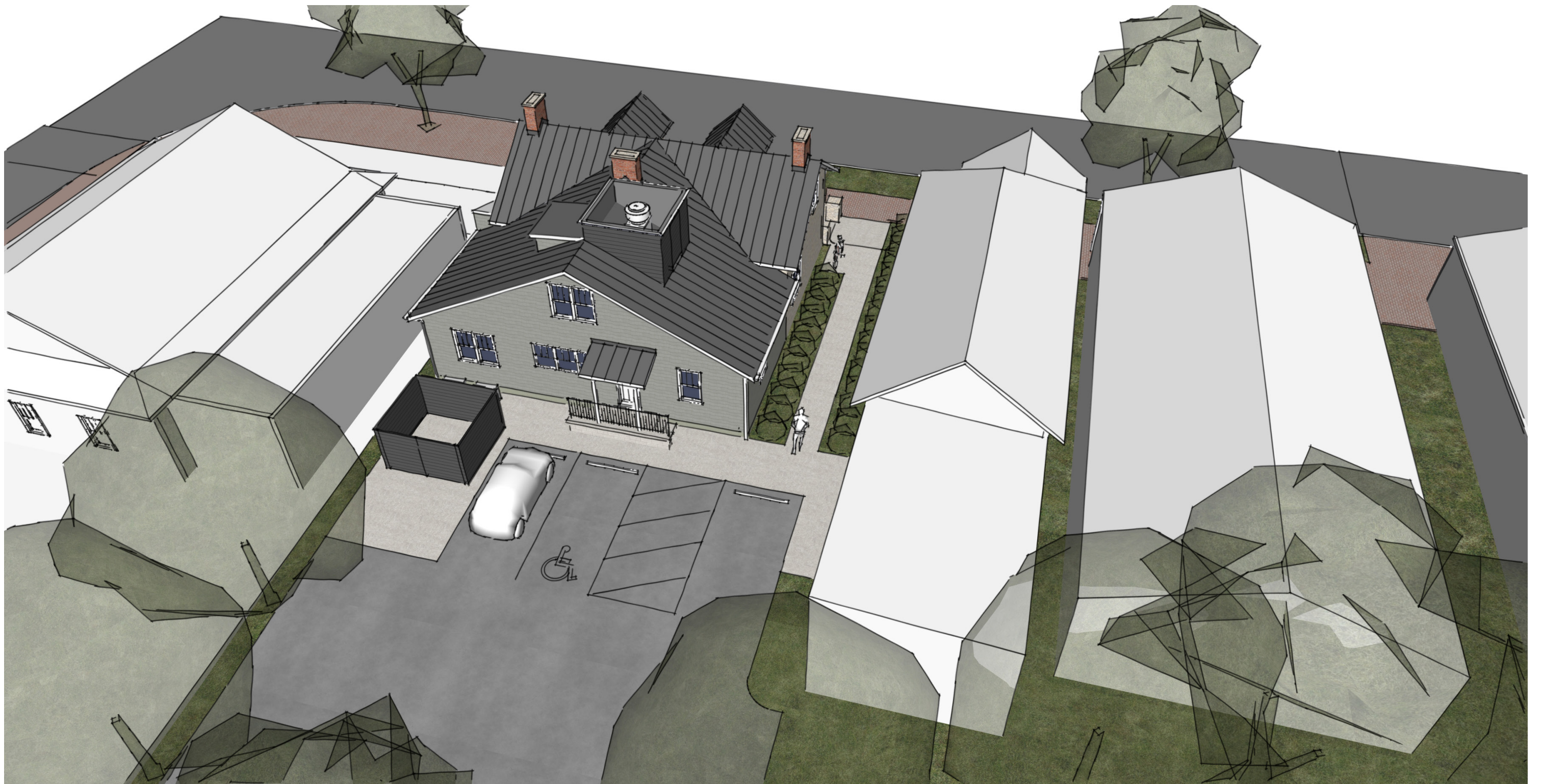
Birdseye View from the East