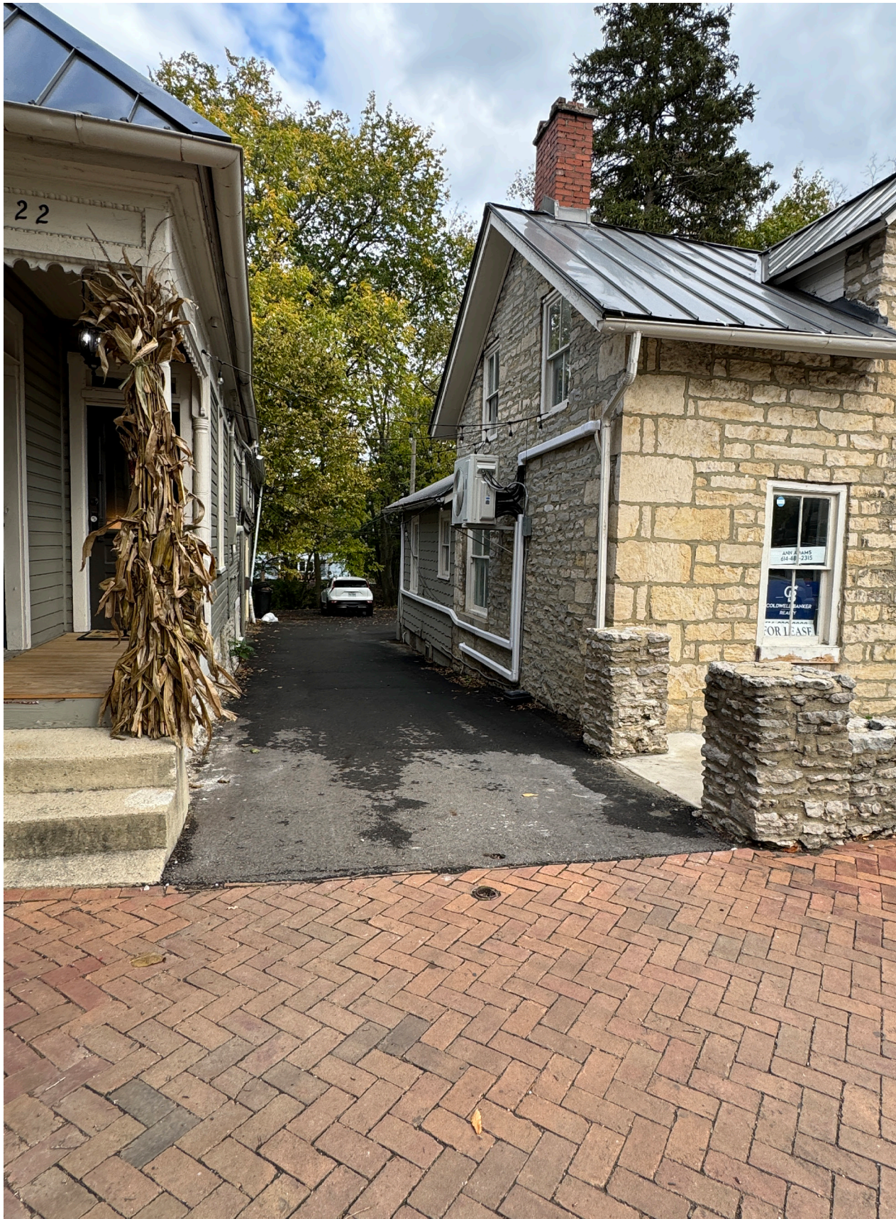
EXISTING ASPHALT DRIVE N HIGH TO REAR LOT ACCESS