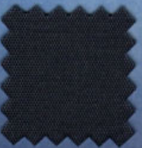
82010-0000 ADMIRAL NAVY