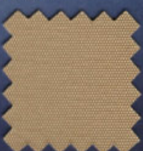
82012-0000 TOASTY BEIGE

FIRESIST™ awning fabric combines state-of-the-art flame retardant performance and UV resistance for the commercial awning, canopy and shade markets.