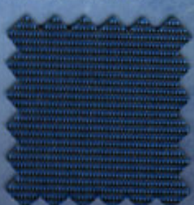
82005-0000 REGATTA TWEED