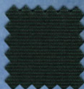
82002-0000 FOREST GREEN TWEED