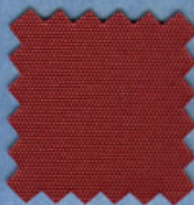
82017-0000 CRIMSON RED