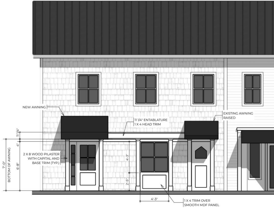
PARTIAL WEST ELEVATION