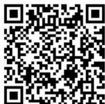
City Manager Report