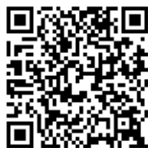
Fiber to Every Home