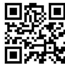
Capital Improvements Program