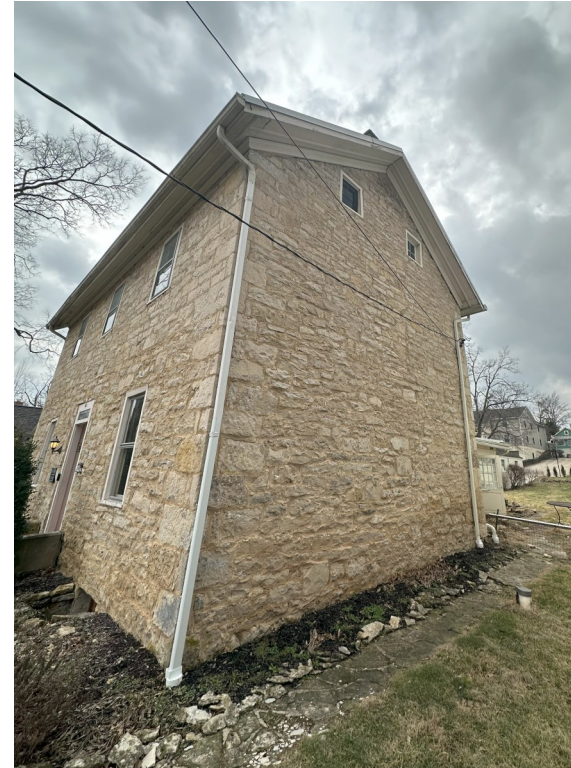
Existing Right Elevations