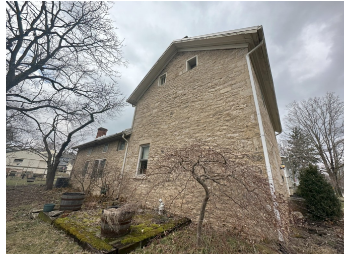
Existing Left Elevations