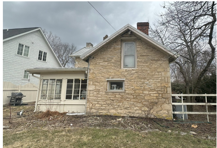
Existing Rear Elevations