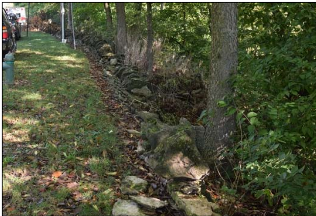
Overview of wall, looking north