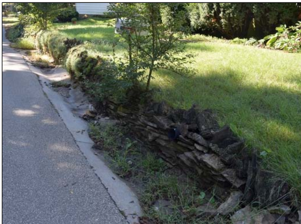
Overview of wall, looking south