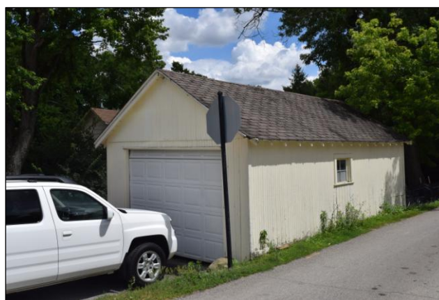
53 N Riverview St, garage, looking northwest