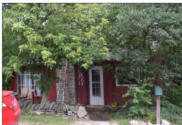
62 N Riverview St, looking northeast