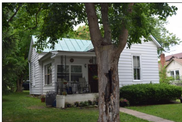
45 N Riverview St, looking northwest

District: Yes Local Historic Dublin district Contributing Status: Recommended contributing National Register: Recommended Dublin High Street Historic District, boundary increase Property Name: N/A