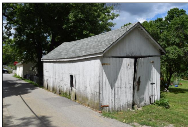
45 N Riverview St, ancillary structure, looking northeast