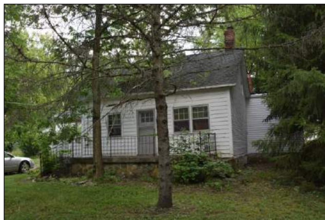
37 N Riverview St, looking west