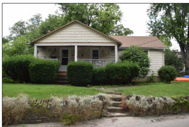
53 N Riverview St, looking southwest

District: Yes Local Historic Dublin district Contributing Status: Recommended contributing National Register: Recommended Dublin High Street Historic District, boundary increase Property Name: N/A