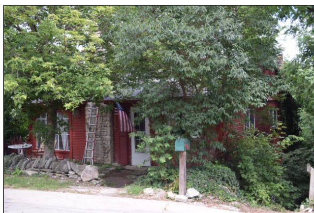
62 N Riverview St, looking southeast

District: Yes Local Historic Dublin district Contributing Status: Recommended contributing National Register: Recommended Dublin High Street Historic District, boundary increase Property Name: N/A