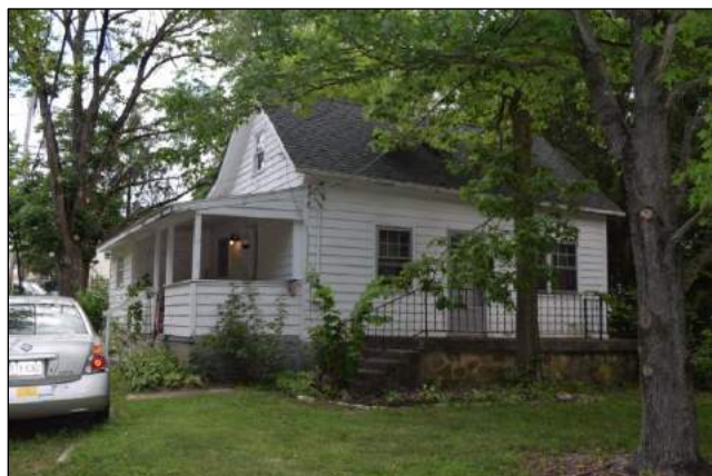
37 N Riverview St, looking northwest

District: Yes Local Historic Dublin district Contributing Status: Recommended contributing National Register: Recommended Dublin High Street Historic District, boundary increase Property Name: N/A