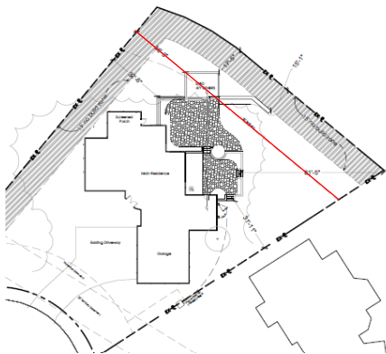
November 20 th -Original request