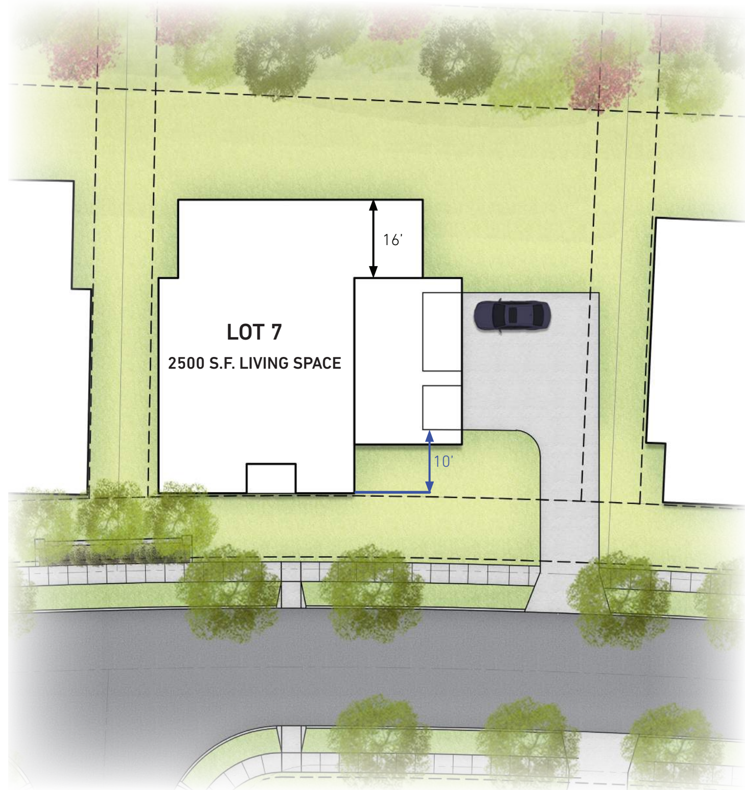
PUD STANDARD 10' SETBACK