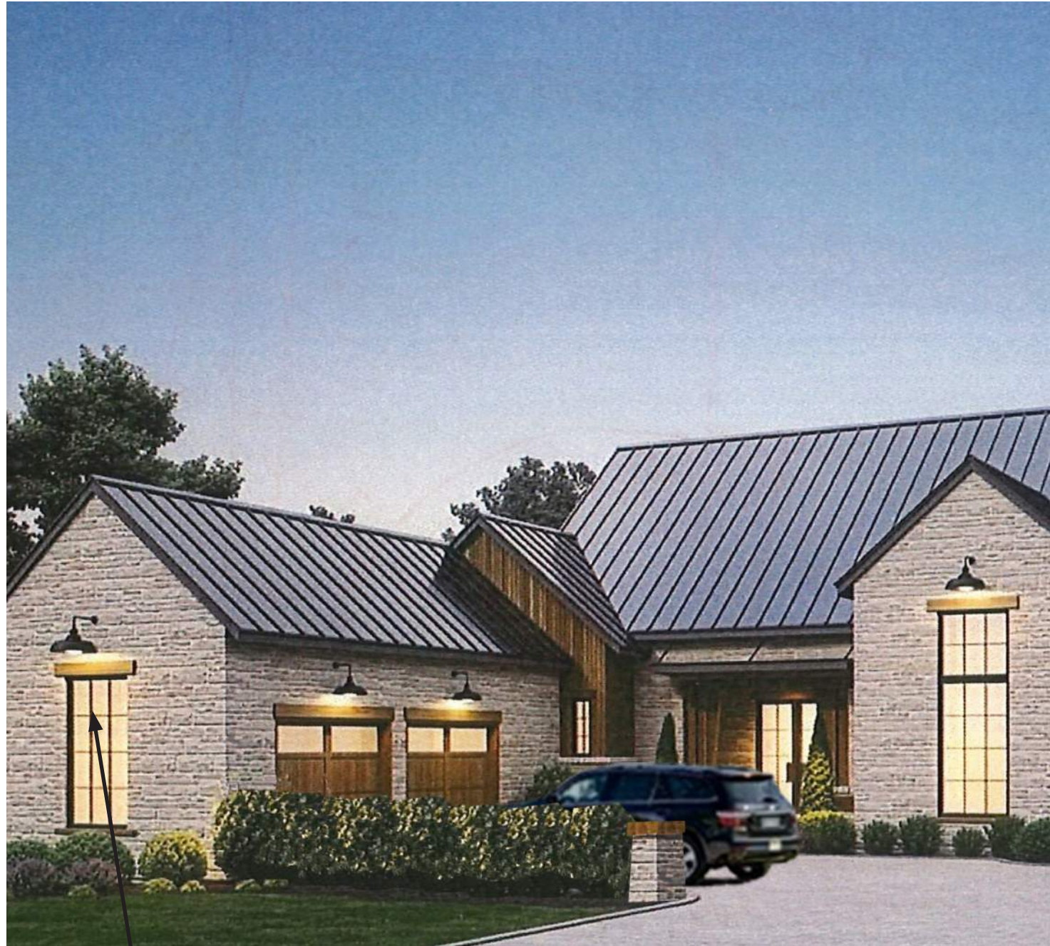
DECORATIVE ARCHITECTURAL FEATURE