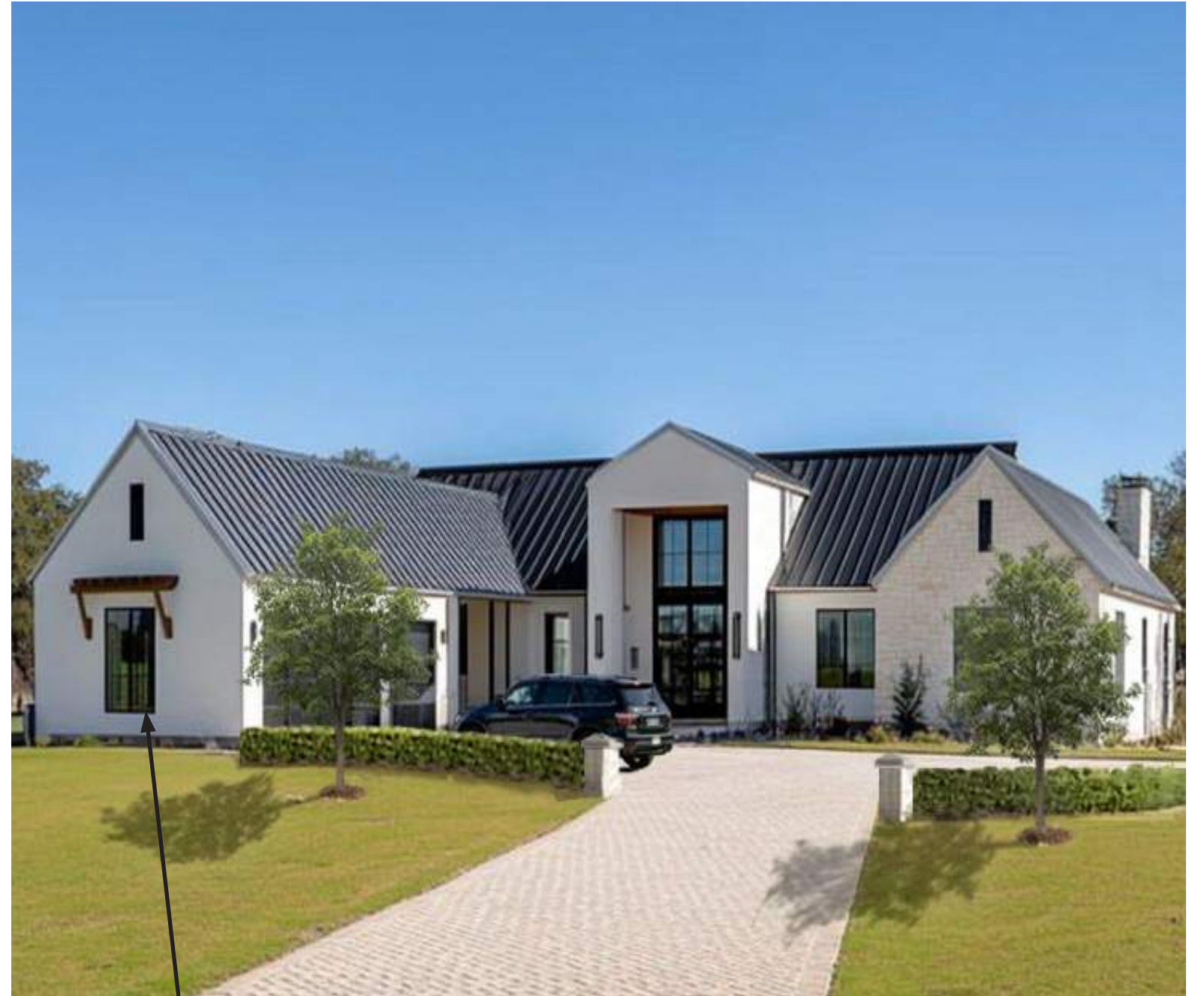
DECORATIVE ARCHITECTURAL FEATURE