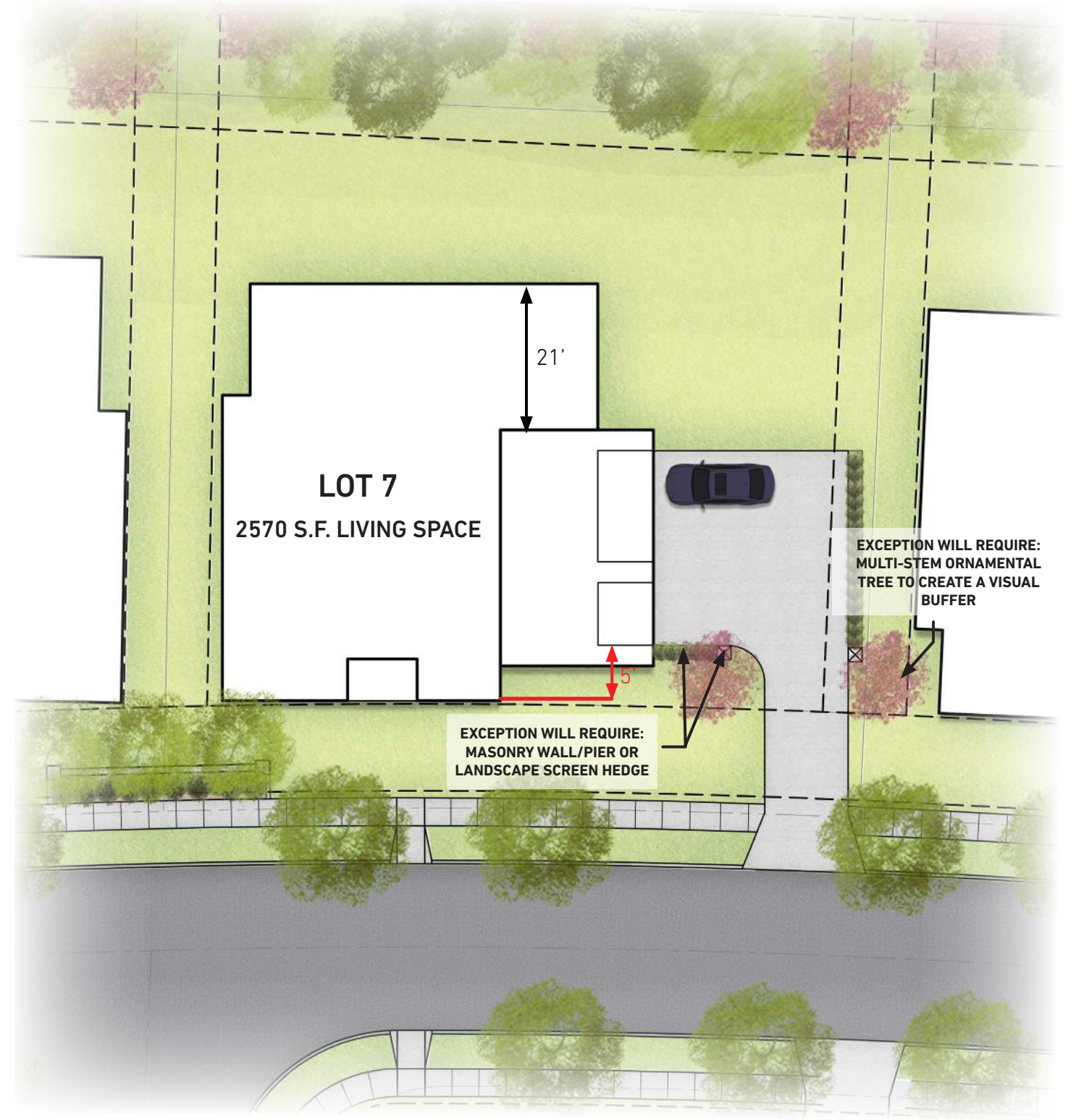
PROPOSED 5' SETBACK