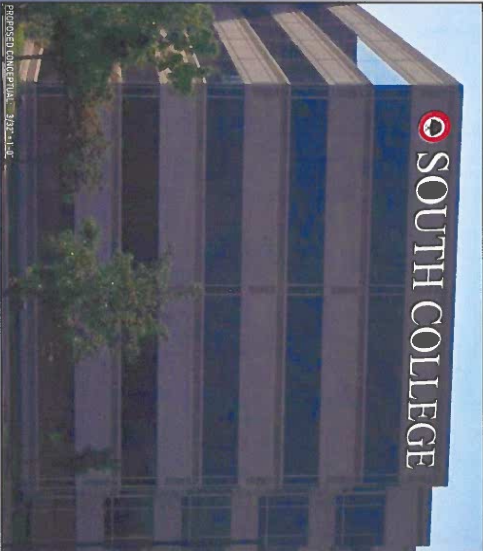
PROPOSED CONCEPTUAL 3/31/11 1-0"