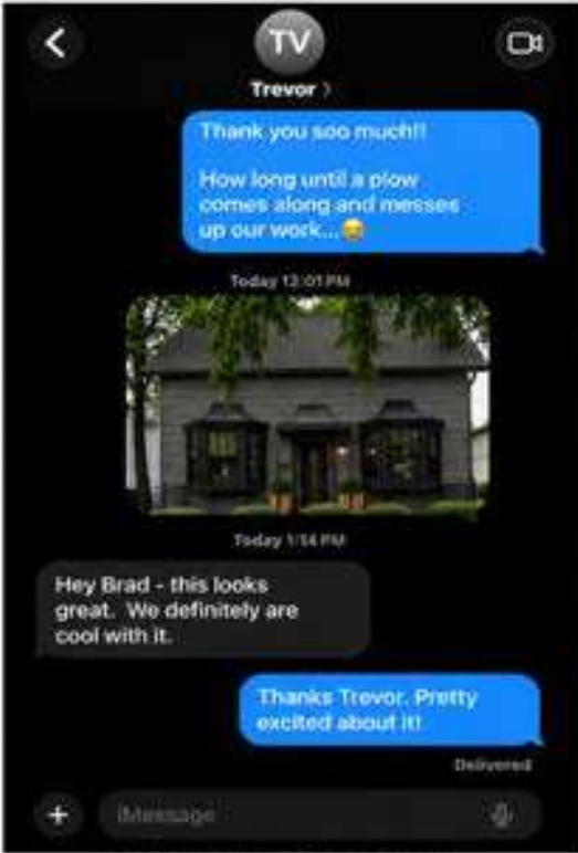
TREVOR VESSEL – 63 S RIVERVIEW