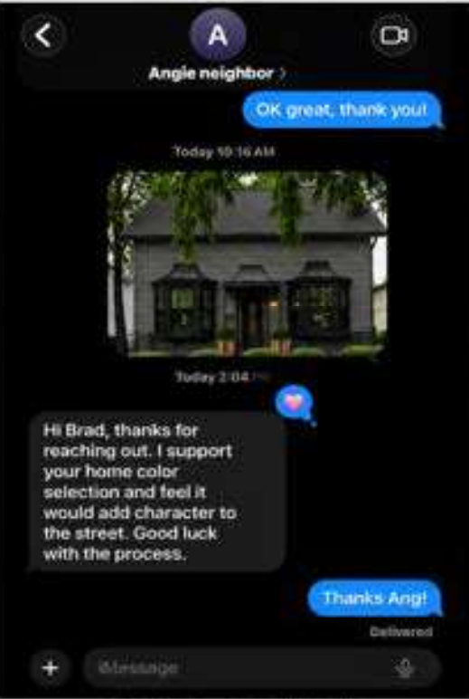
ANGIE KNEE – 55 S RIVERVIEW