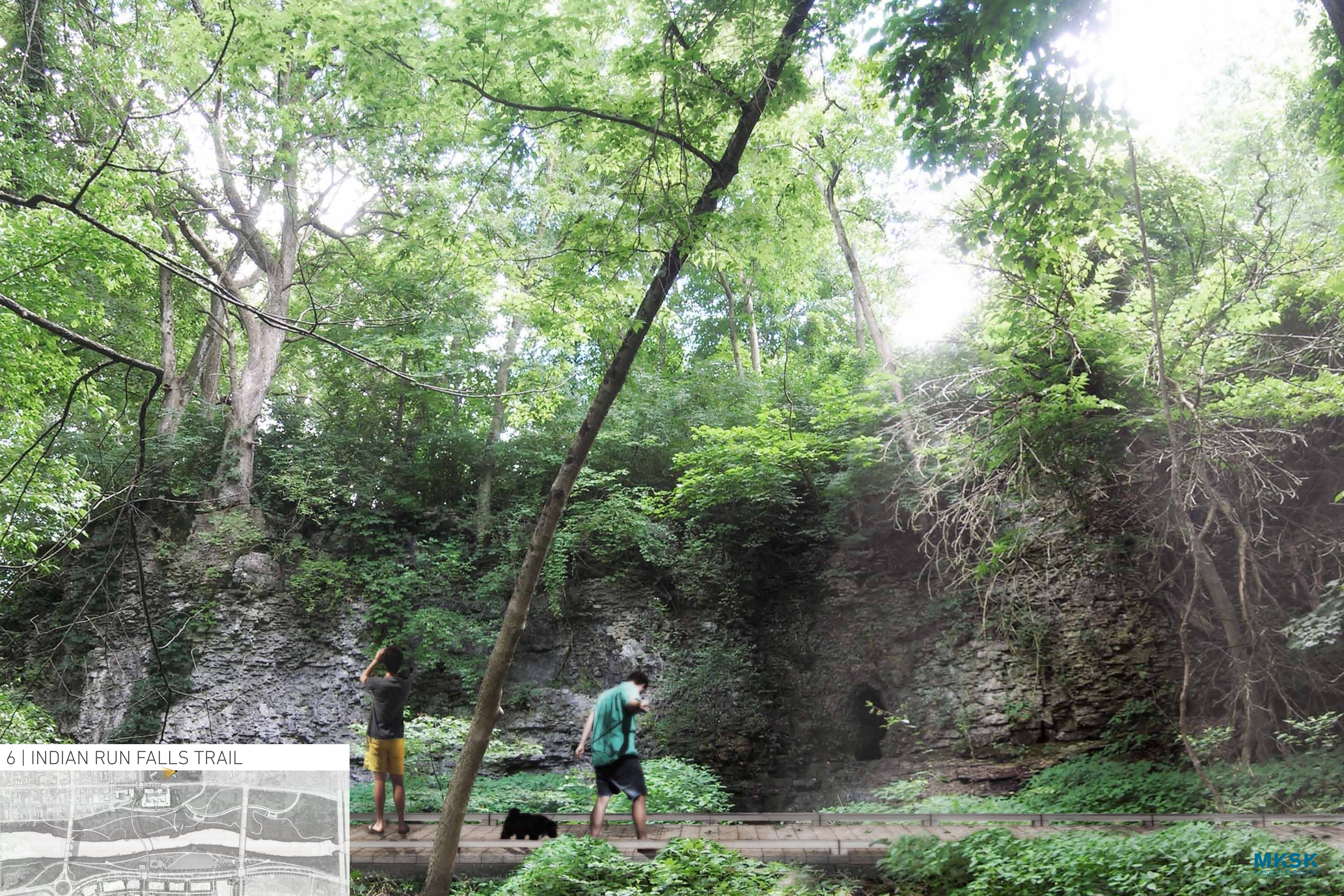
6 | INDIAN RUN FALLS TRAIL