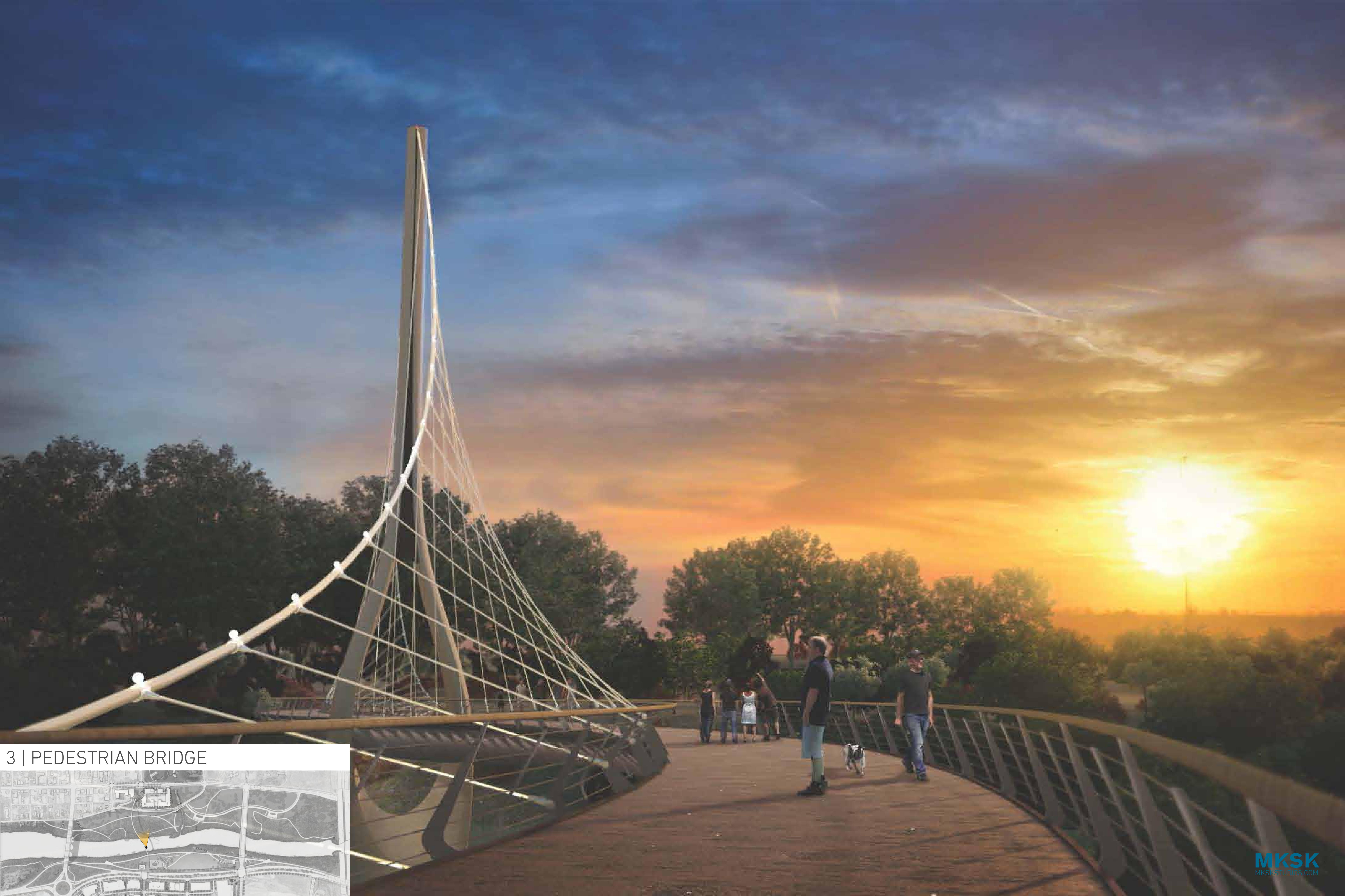
3 | PEDESTRIAN BRIDGE