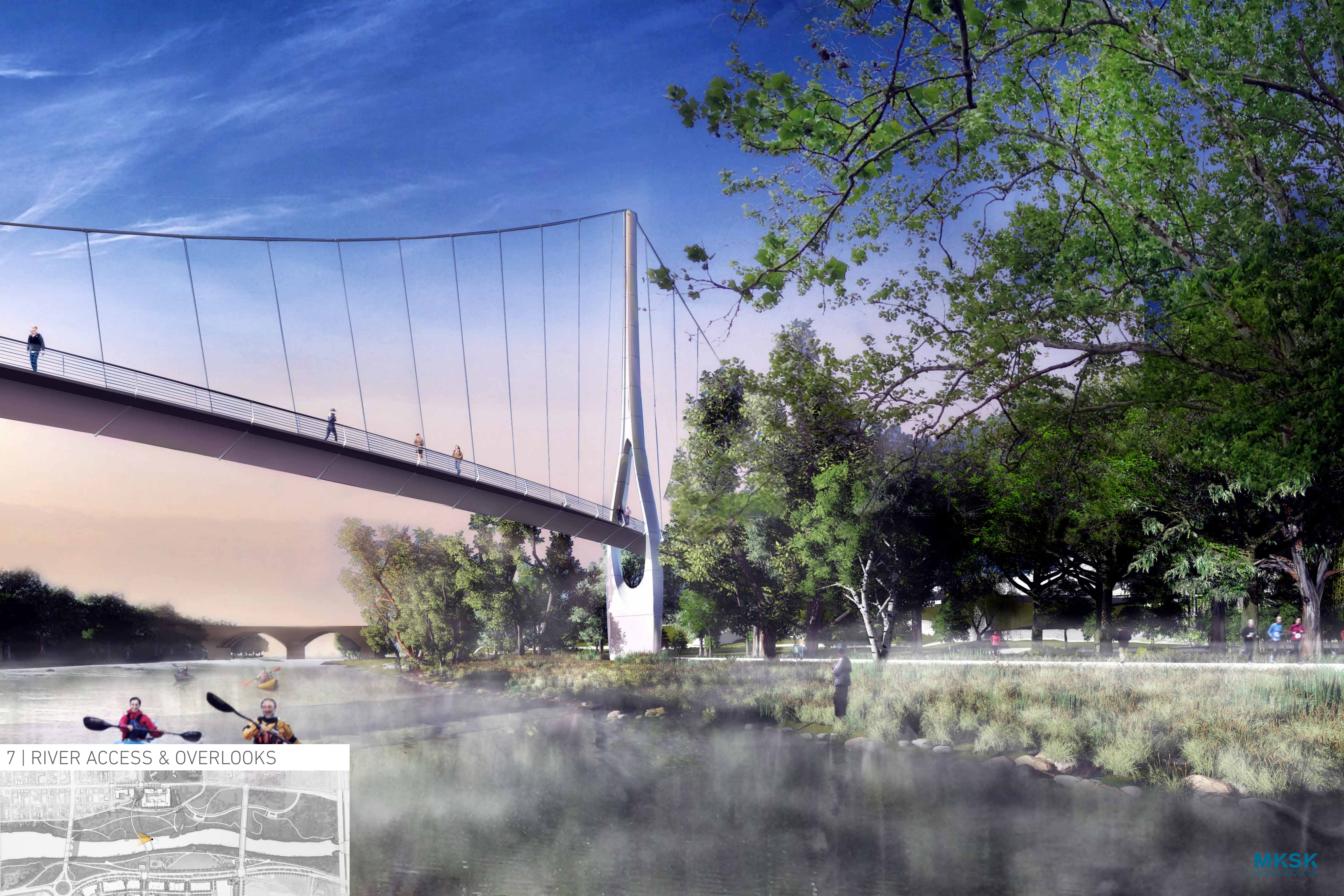
7 | RIVER ACCESS & OVERLOOKS