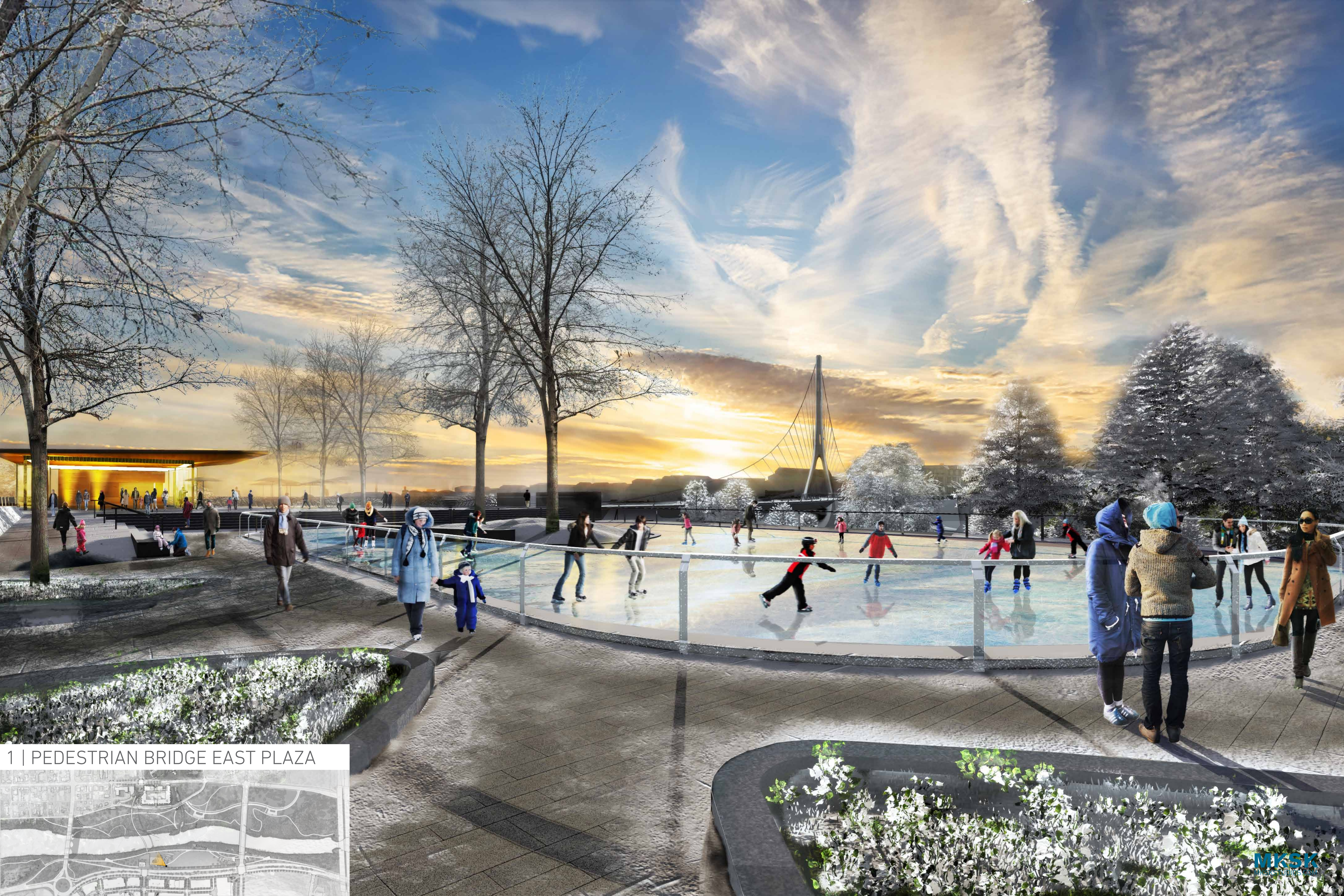
1 | PEDESTRIAN BRIDGE EAST PLAZA