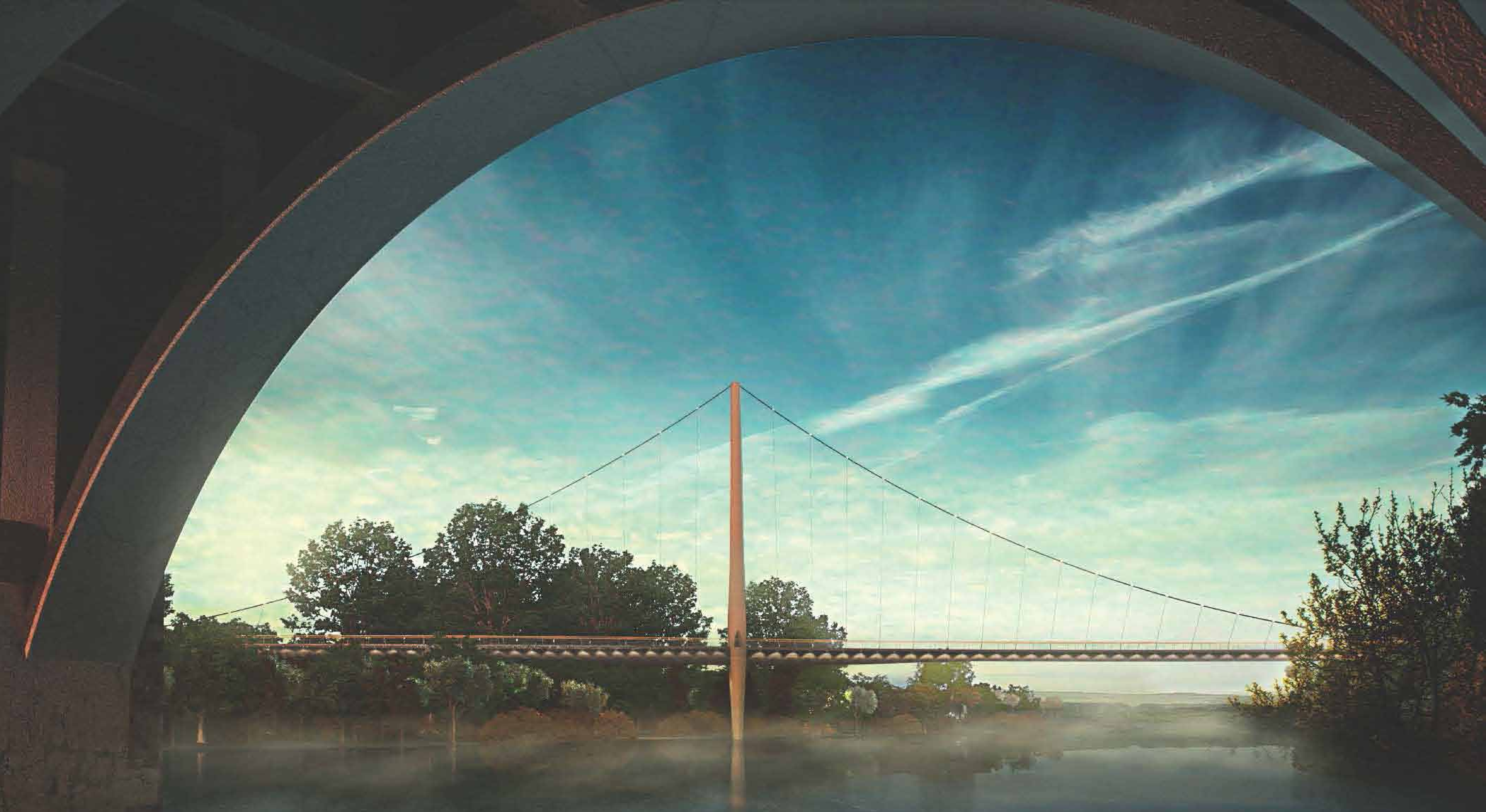
3 | PEDESTRIAN BRIDGE