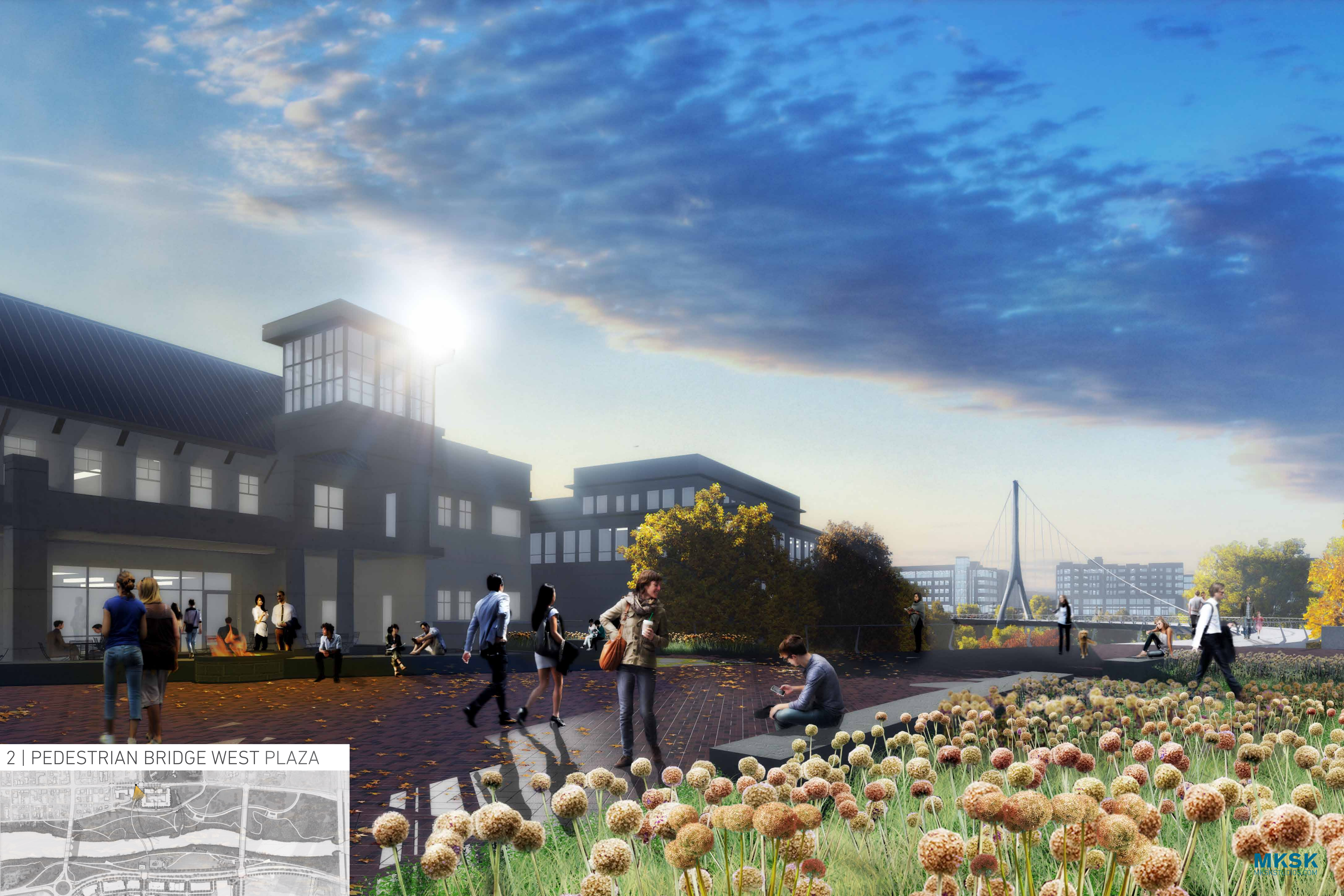
2 | PEDESTRIAN BRIDGE WEST PLAZA