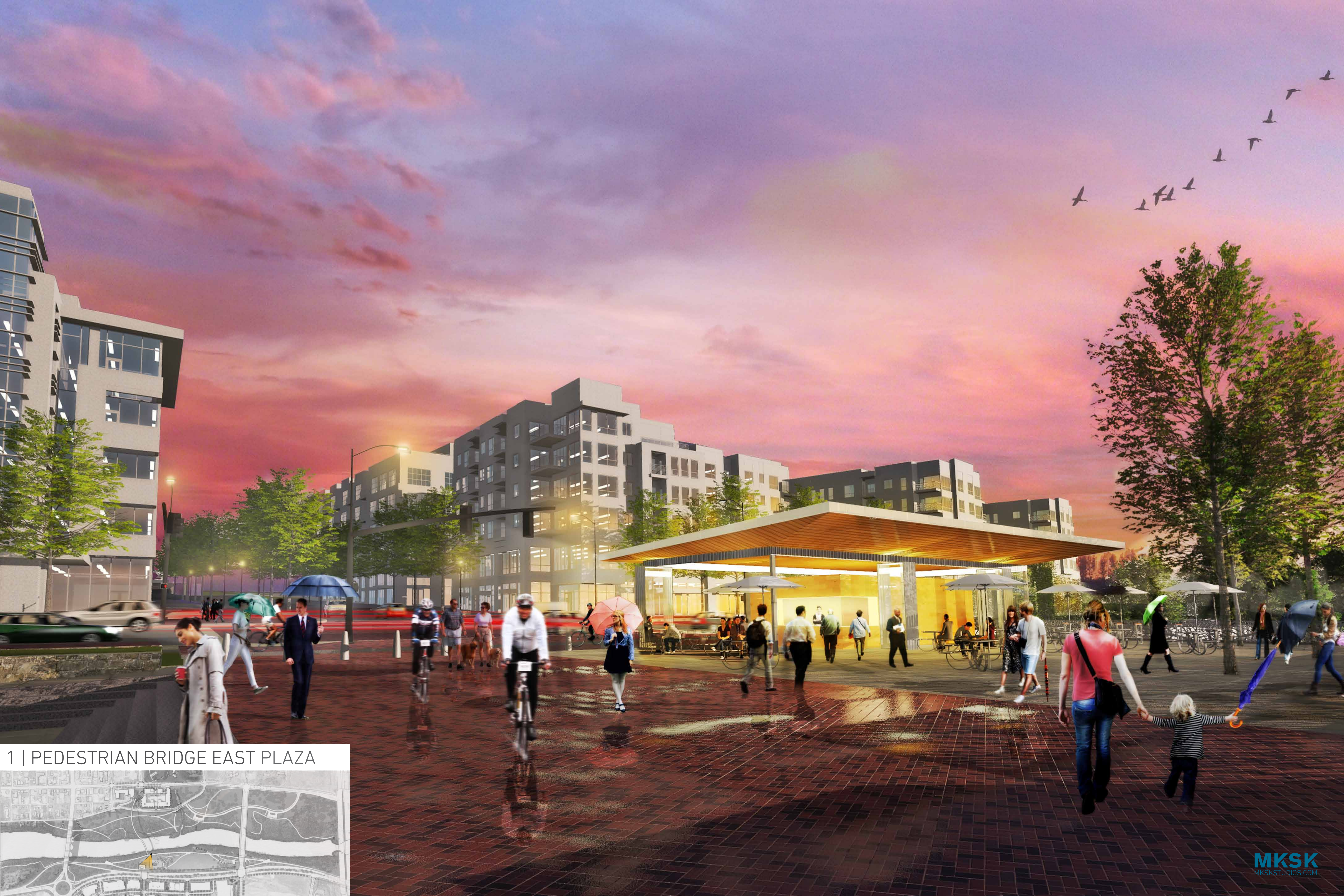
1 | PEDESTRIAN BRIDGE EAST PLAZA