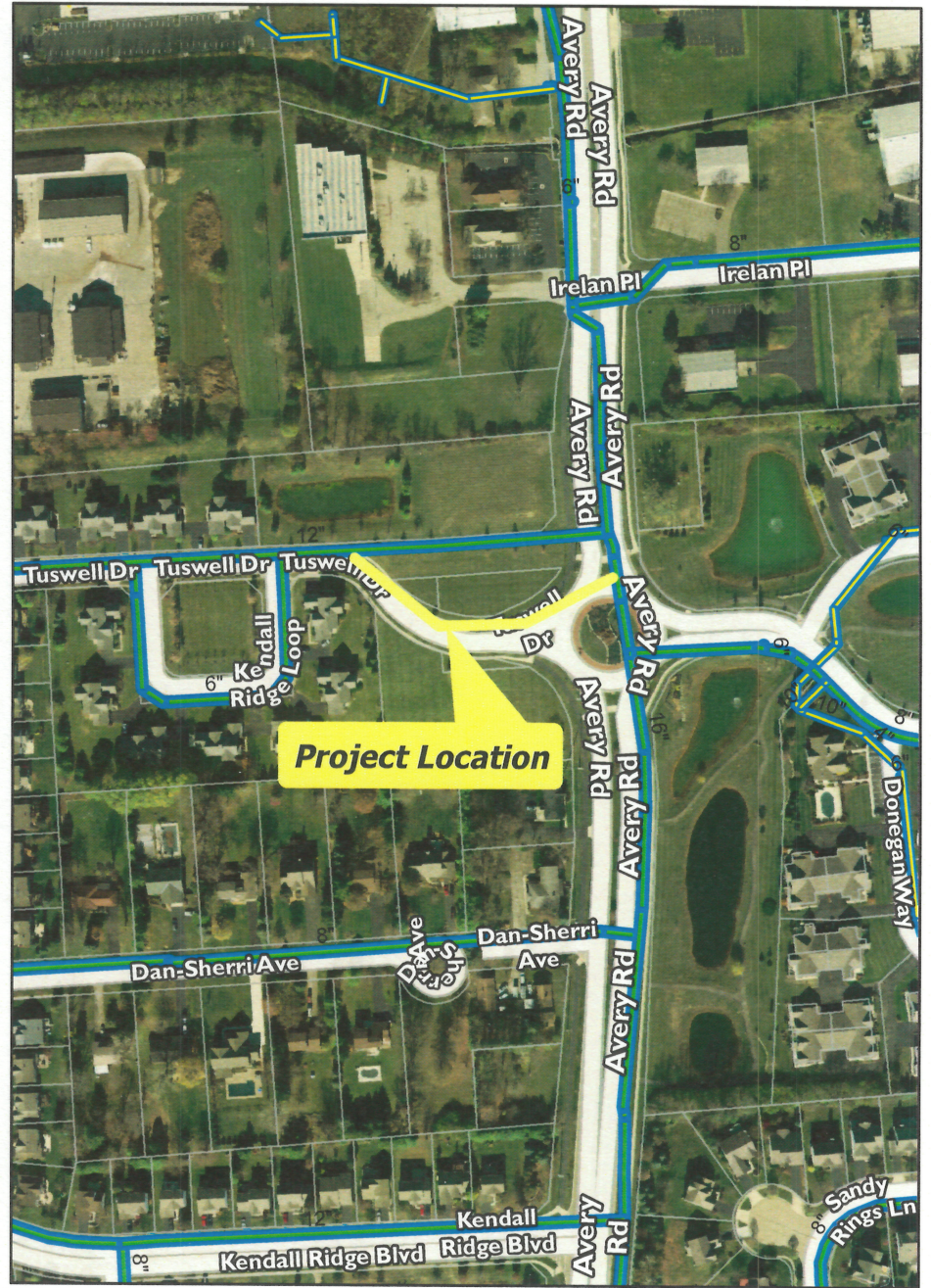
Resolution 03-17 Location Map for Rings Road Waterline Extension and Tuswell Drive Waterline Relocation Project