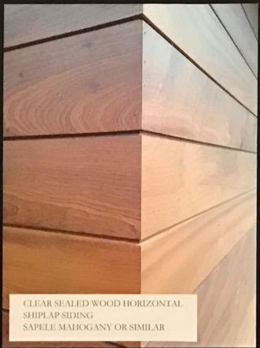
CLEAR SEALED WOOD HORIZONTAL SHIPLAP SIDING SAPELE MAHOGANY OR SIMILAR