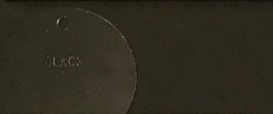
BLACK ANODIZED ALUMINUM STOREFRONT WITH GLAZED VERTICAL MULLIONS TUBEITE OR SIMILAR