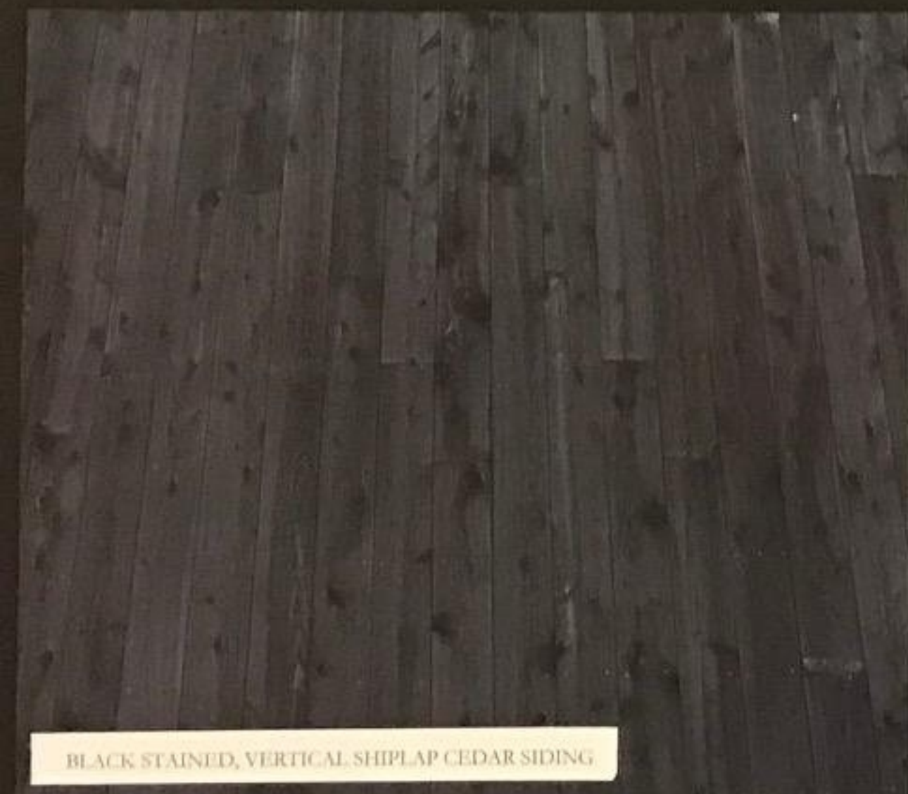
BLACK STAINED, VERTICAL SHIPLAP CEDAR SIDING