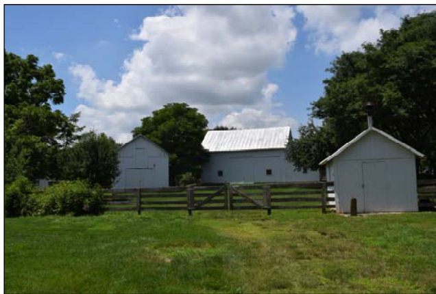
6659 Coffman Rd, outbuildings, looking west