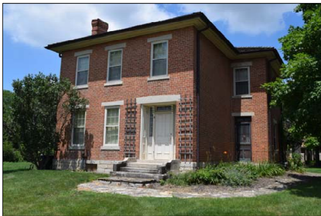
6659 Coffman Rd, house, looking northwest