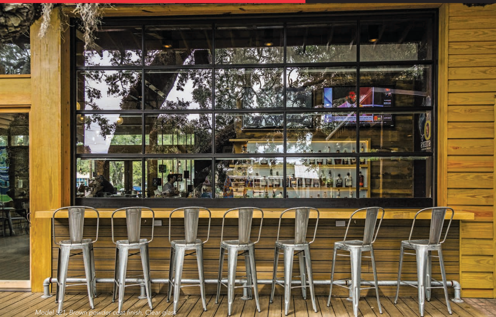
Model 521, Brown powder coat finish, Clear glass