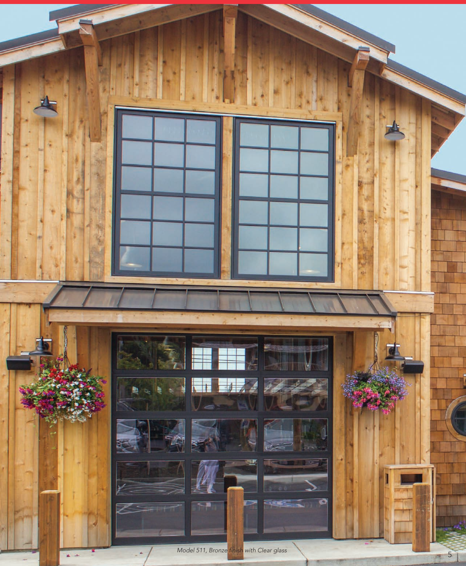
Model 511, Bronze finish with Clear glass