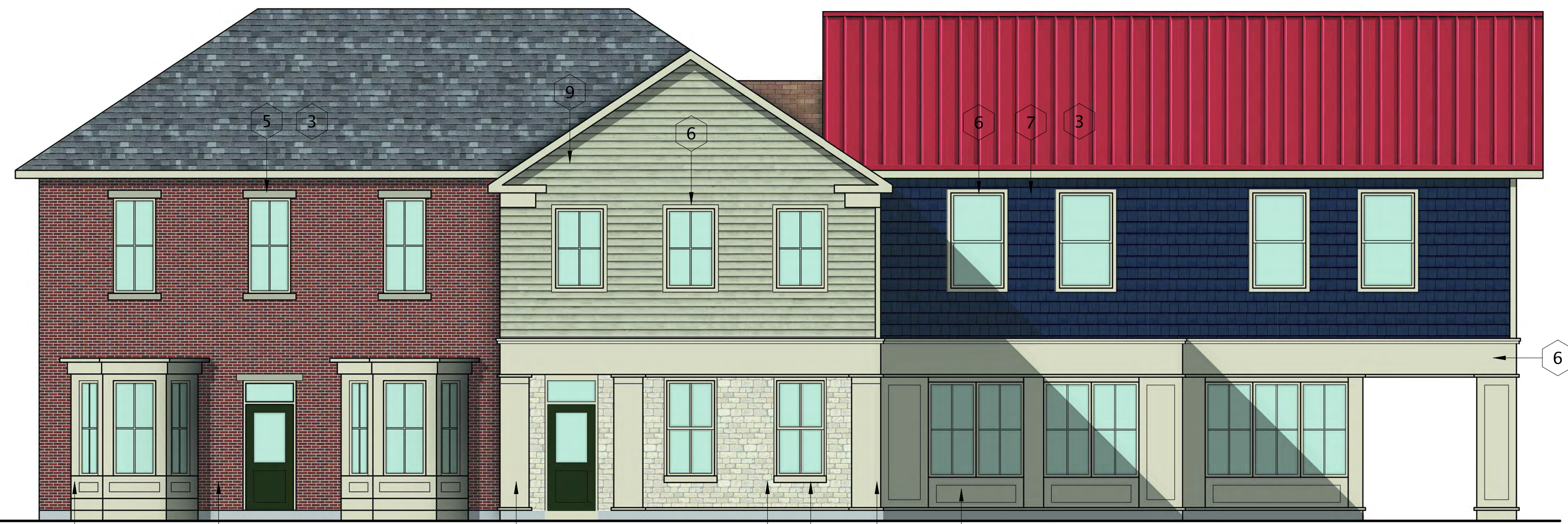
1 EAST ELEVATION Scale: 3/16" = 1'-0"