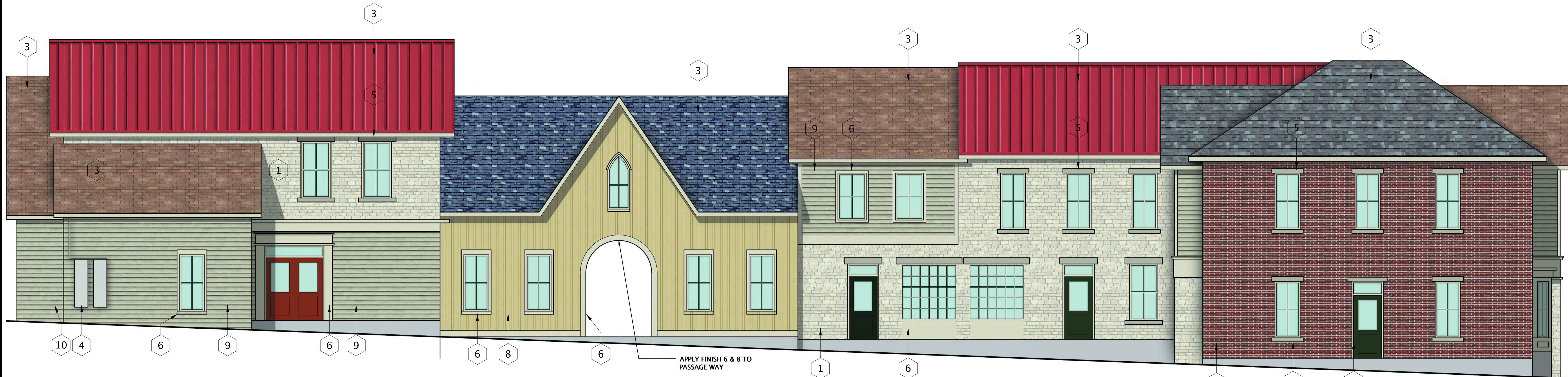
2 NORTH ELEVATION Scale: 3/16" = 1'-0"