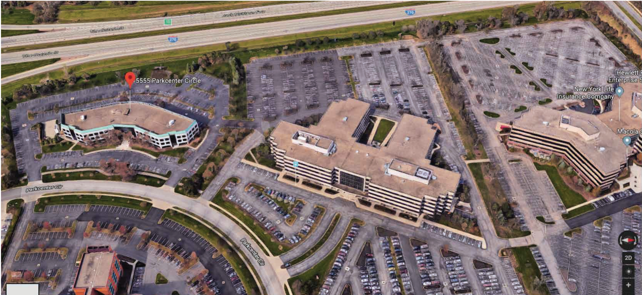
AERIAL PHOTO , N.T.S.