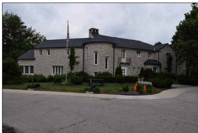
7125 Riverside Dr, looking northwest