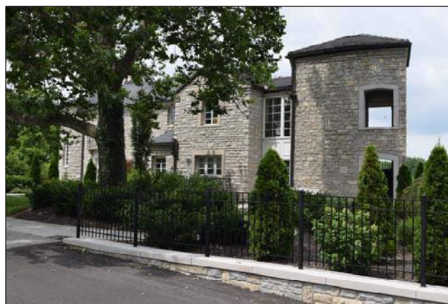
7125 Riverside Dr, looking west-southwest