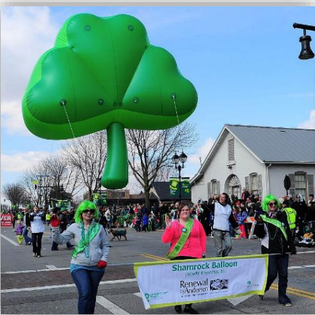
Three Shamrocks $500 Each