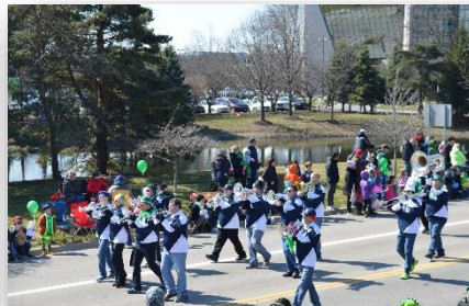
Blue Coats Band $300