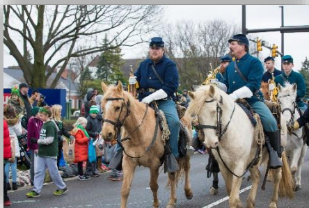
Equestrian Bugle Corp $500