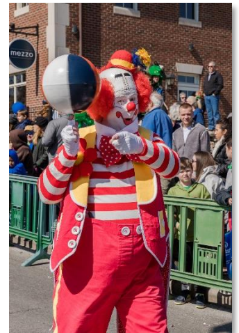
Aladdin Shrine Clowns $500