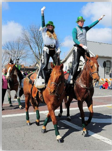
Renegade Equestrian Team $500