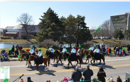
American Side Saddle $500