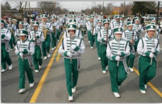
Dublin Scioto High School $500