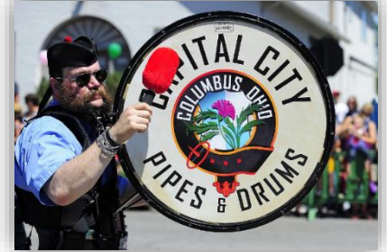
Capital City Pipes & Drums $500