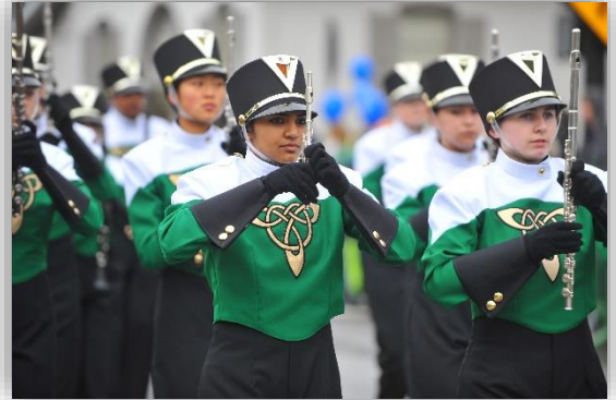
Dublin Jerome High School $500