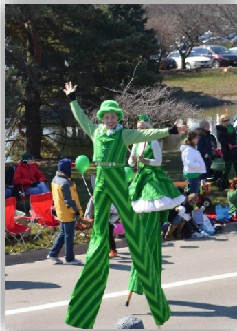
Stilt Walkers $500