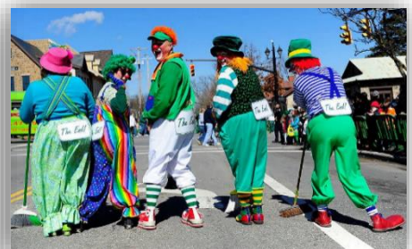
Parade Ending Clowns $500