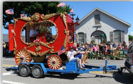
Circus Calliope $500