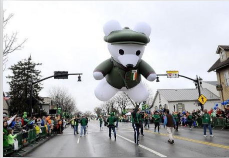
Irish Bear $1,500