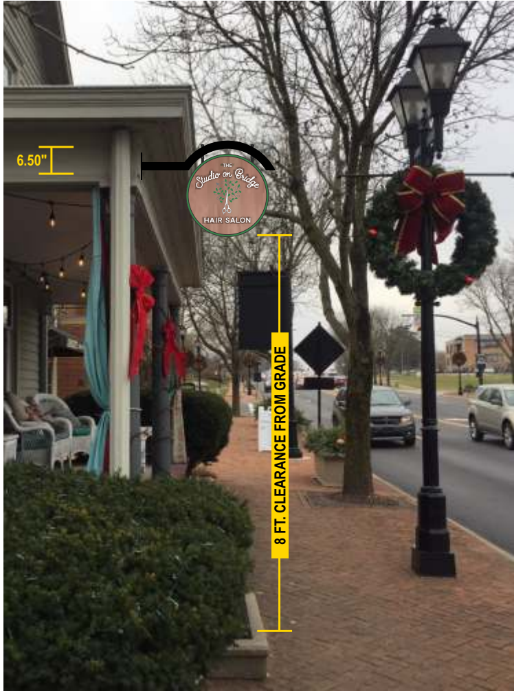
SCALE 3/8" = 1'