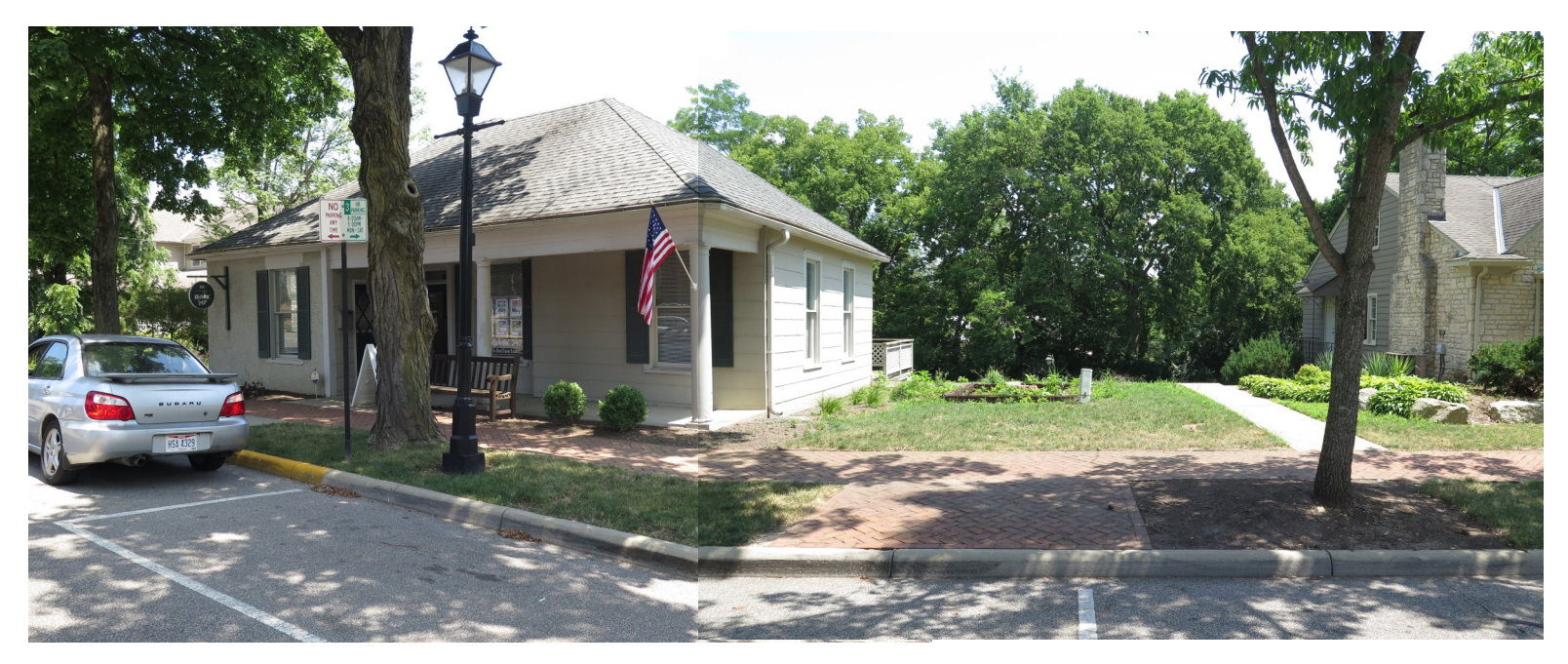
EXISTING FRONT (WEST) & EAST FACADE & SOUTH OPEN SPACE