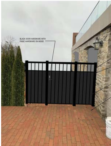
PROPOSED PATIO GATE

THE FOLLOWING DRAWINGS DOCUMENT THE PLANNED CHANGES TO THE EXTERIOR OF BUILDING 22 IN THE OLD DUBLIN DEVELOPMENT, AS PART OF THE NO SOLICITING TENANT PROJECT. PARTS OF THE BUILDING & SITE NOT NOTED OR SHOWN ON THESE DRAWINGS WILL EITHER REMAIN UNCHANGED FROM THE PREVIOUSLY APPROVED SUBMISSION OR ARE OUTSIDE THE SCOPE OF THIS PROJECT.