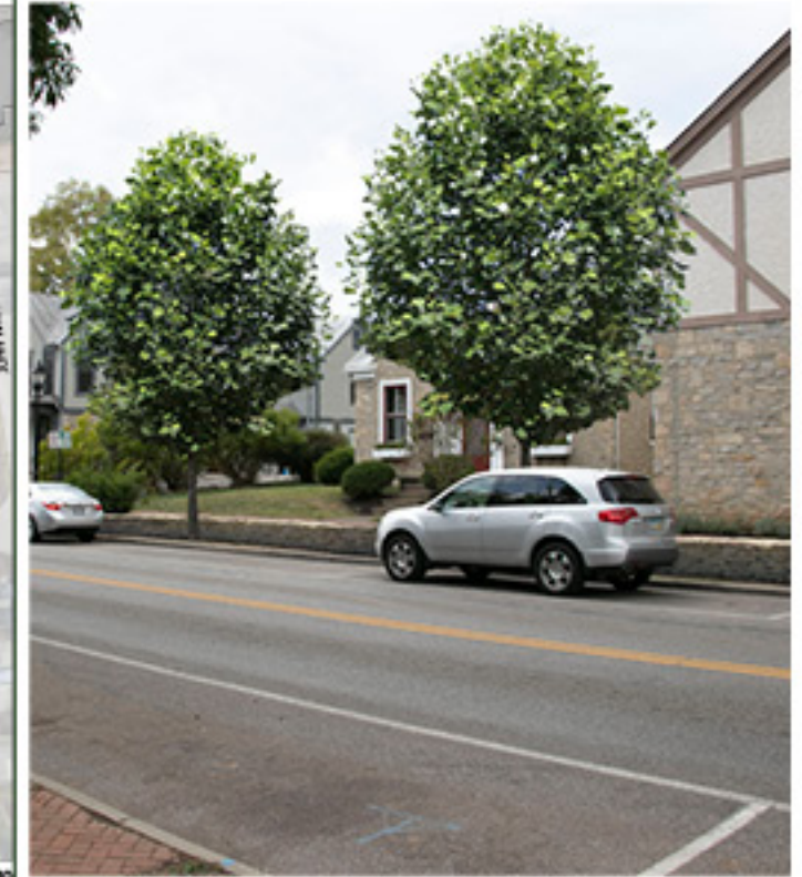
Tuliptree 'Emerald City' with natural stone retaining wall