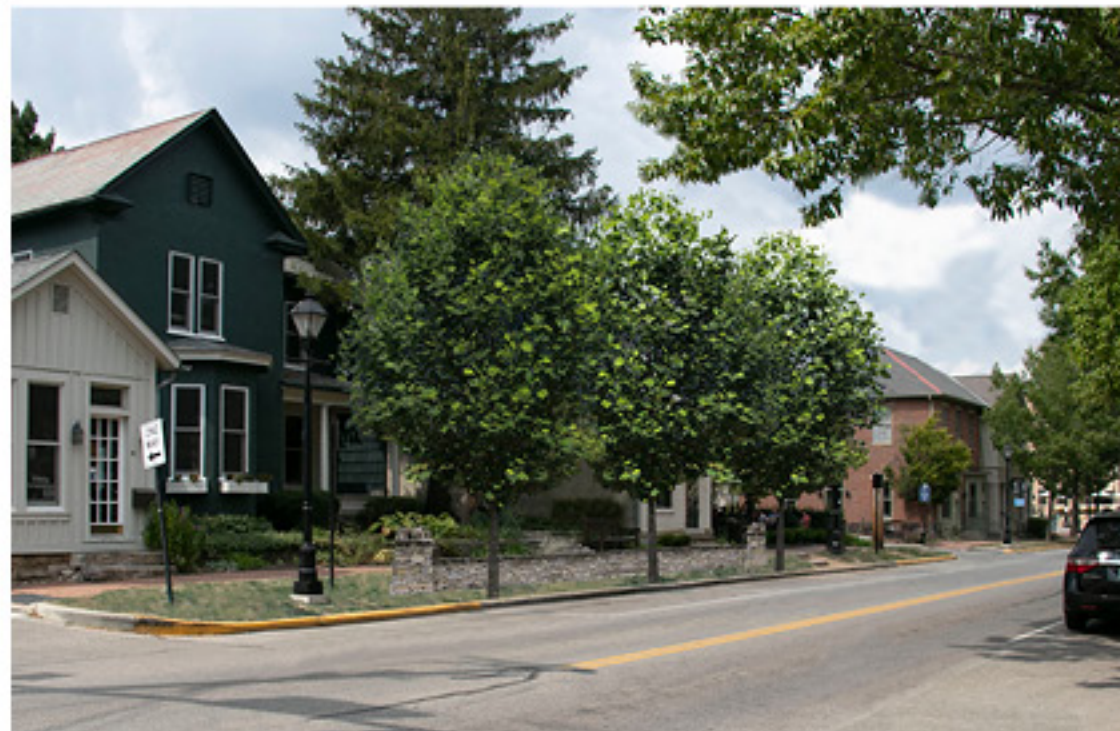
Tuliptree 'Emerald City' with natural stone retaining wall