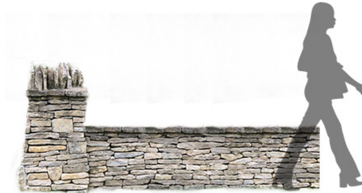
Proposed Stone Wall Treatment - - 24" ht seat wall with columns at various locations to be determined - Natural limestone veneer w/mortared joints