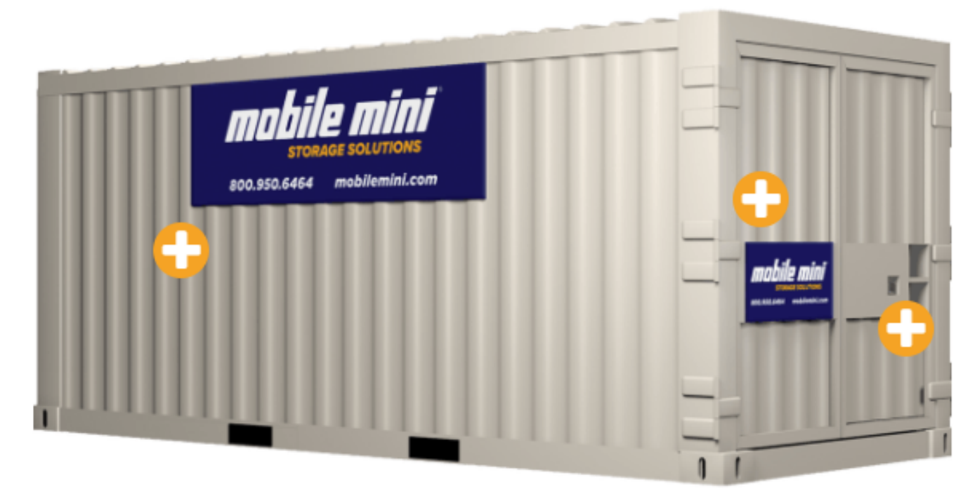
PROPOSED STORAGE UNIT