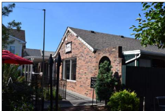
35 N High St, looking southwest

District: Yes Local Historic Dublin district Contributing Status: Recommended contributing National Register: Recommended Dublin High Street Historic District, boundary increase Property Name: N/A