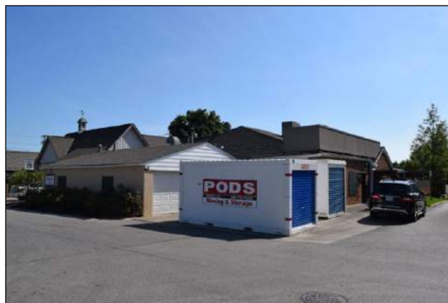
35 N High St, looking northeast