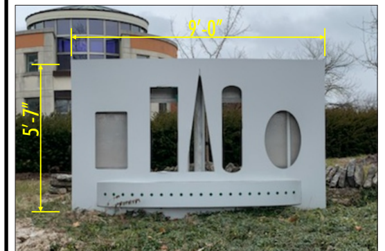
EXISTING SIGN TO BE REMOVED