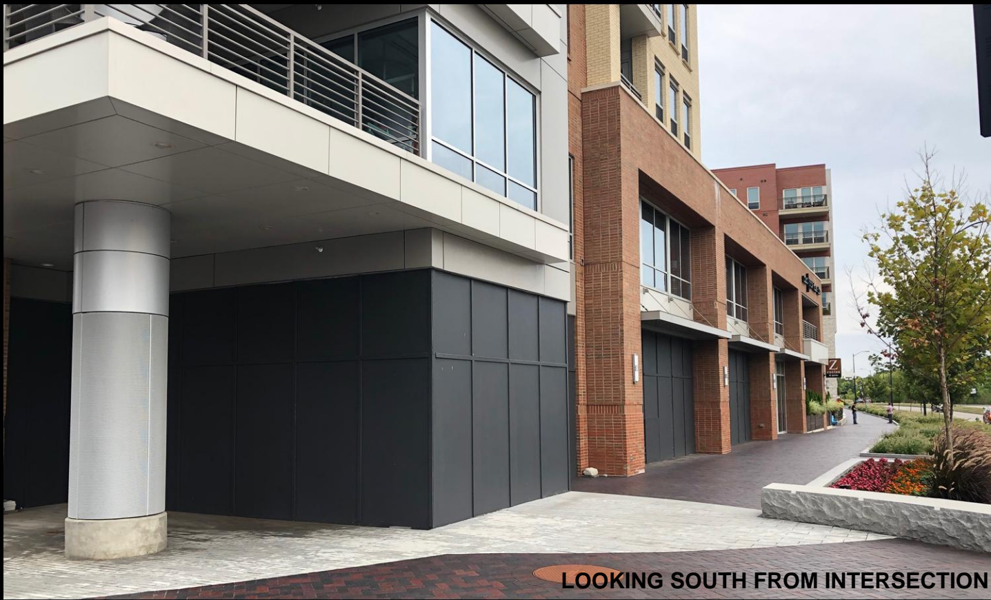
LOOKING SOUTH FROM INTERSECTION