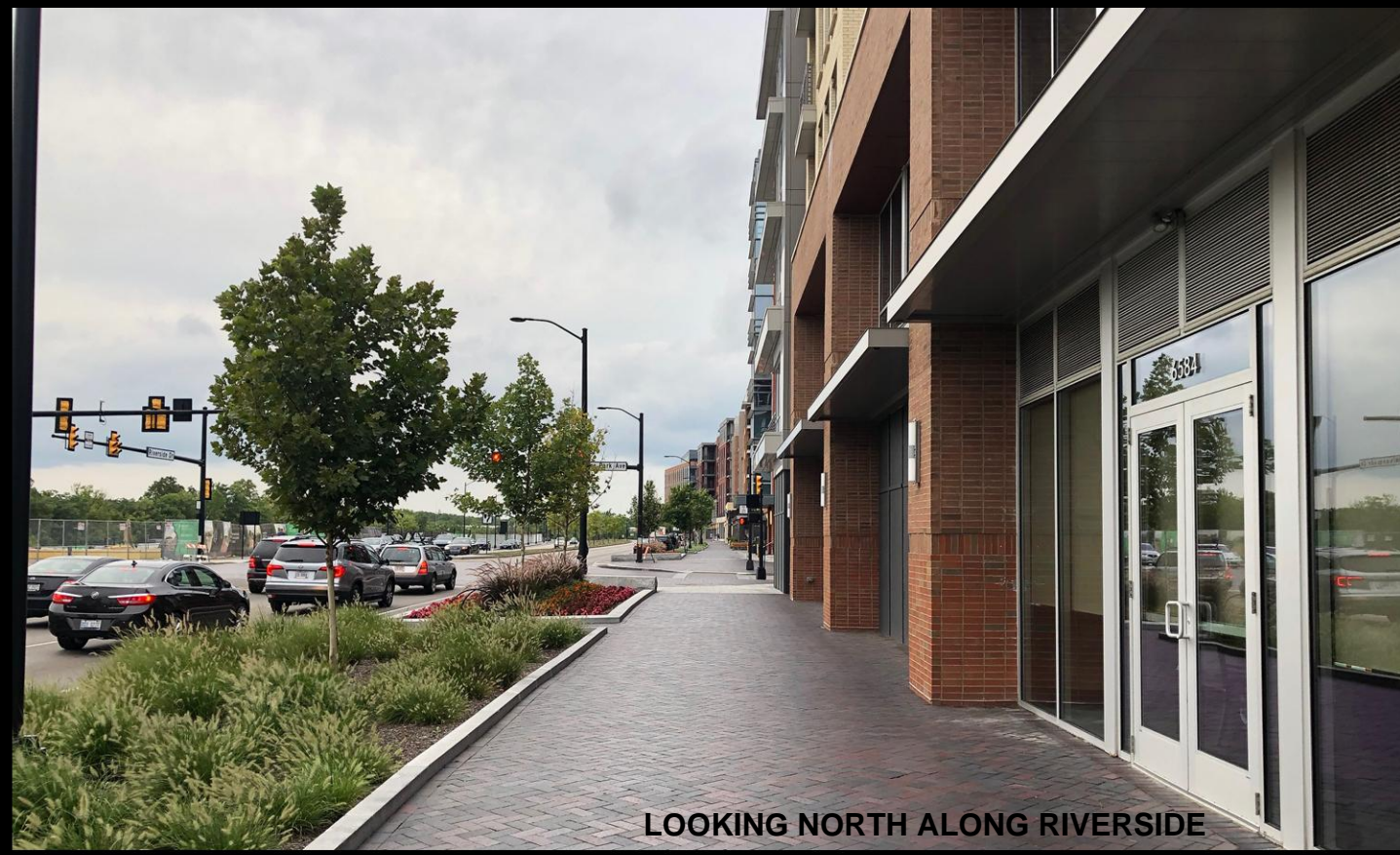
LOOKING NORTH ALONG RIVERSIDE