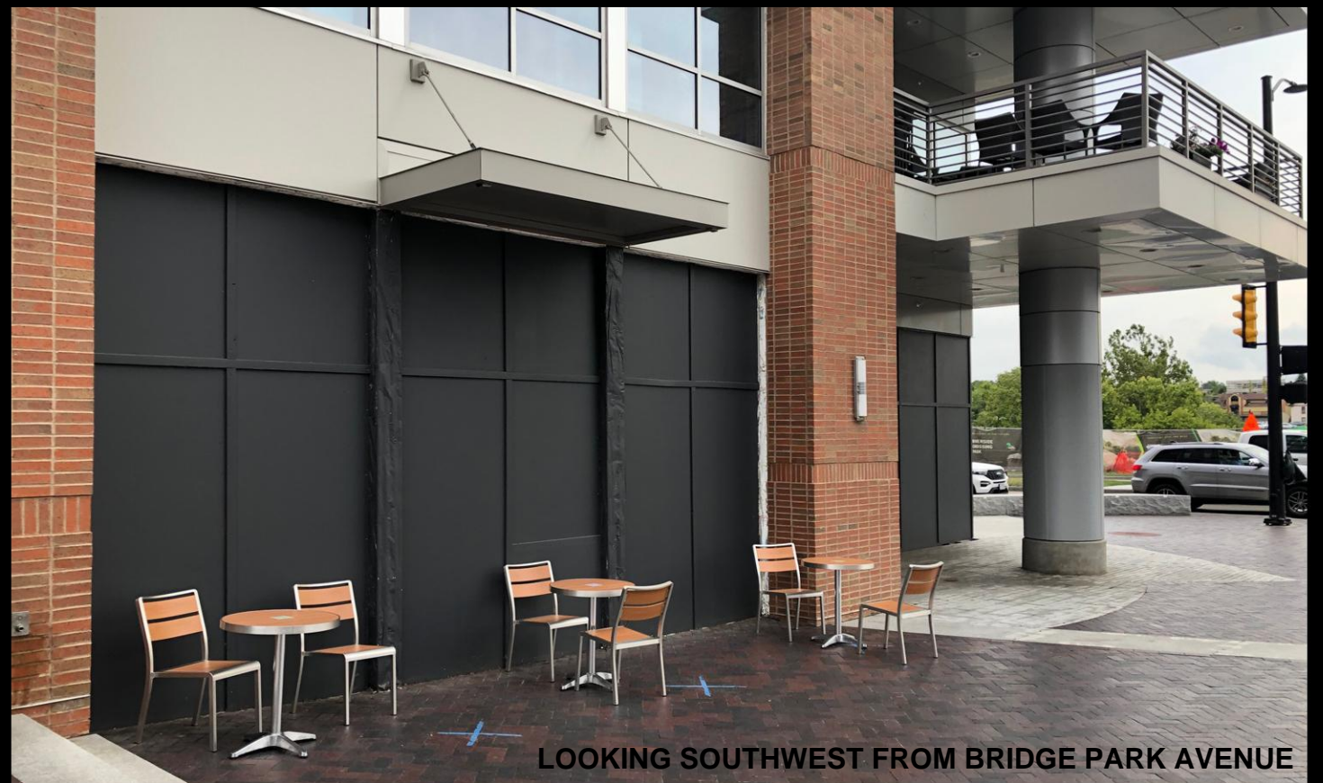
LOOKING SOUTHWEST FROM BRIDGE PARK AVENUE