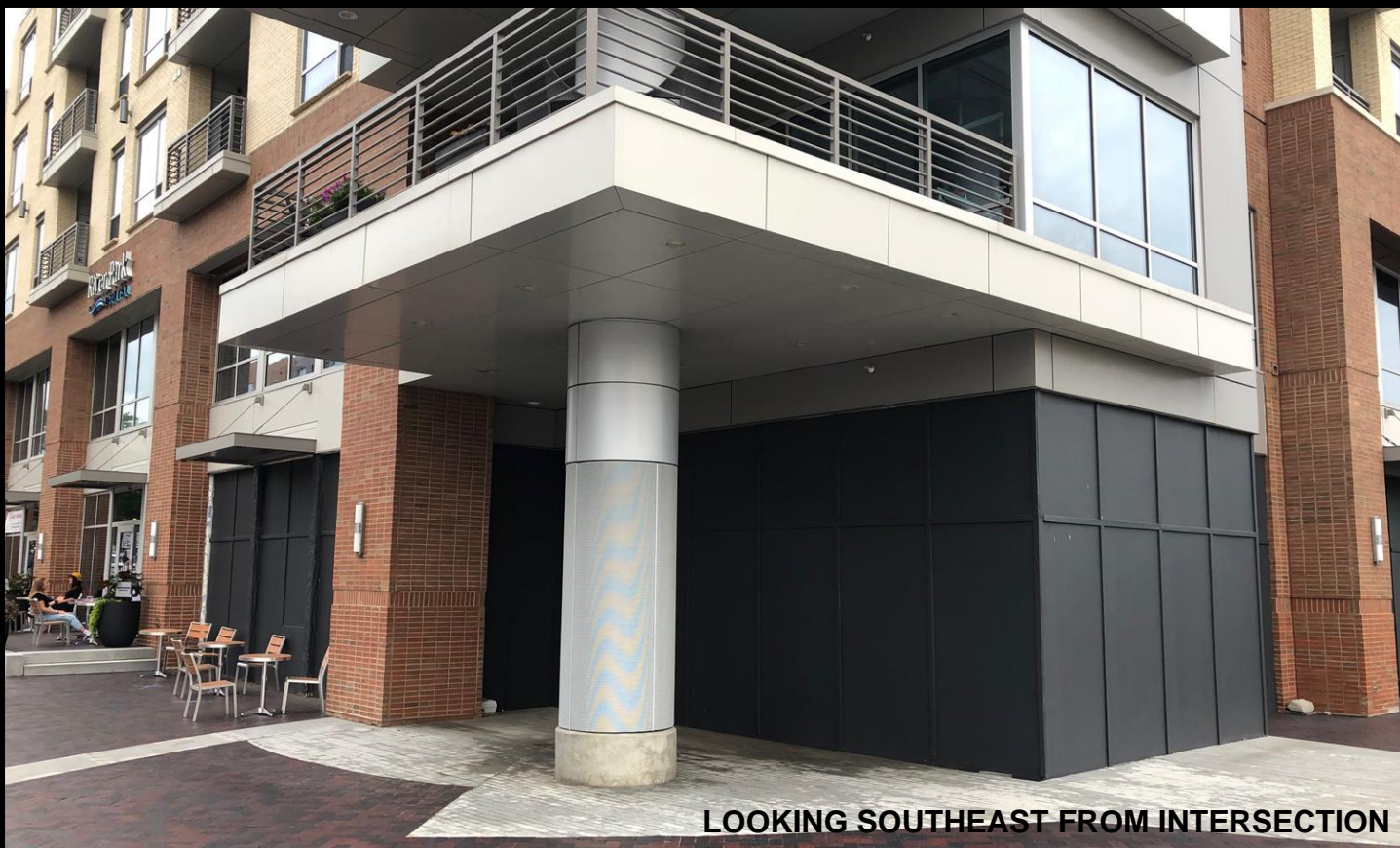
LOOKING SOUTHEAST FROM INTERSECTION