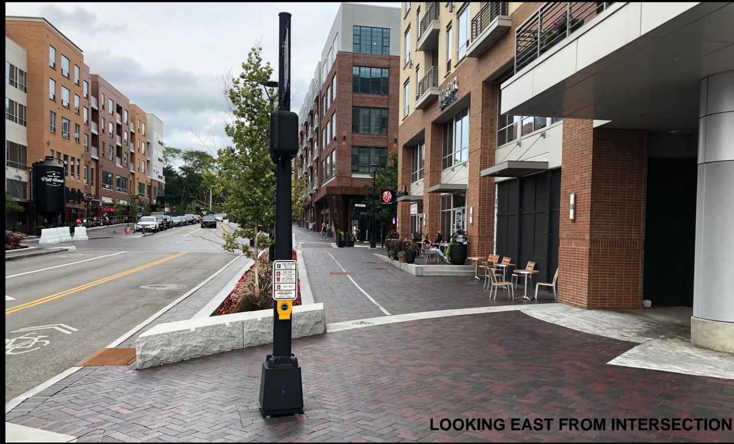
LOOKING EAST FROM INTERSECTION