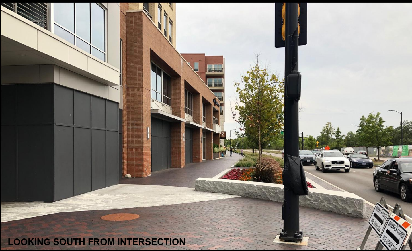
LOOKING SOUTH FROM INTERSECTION