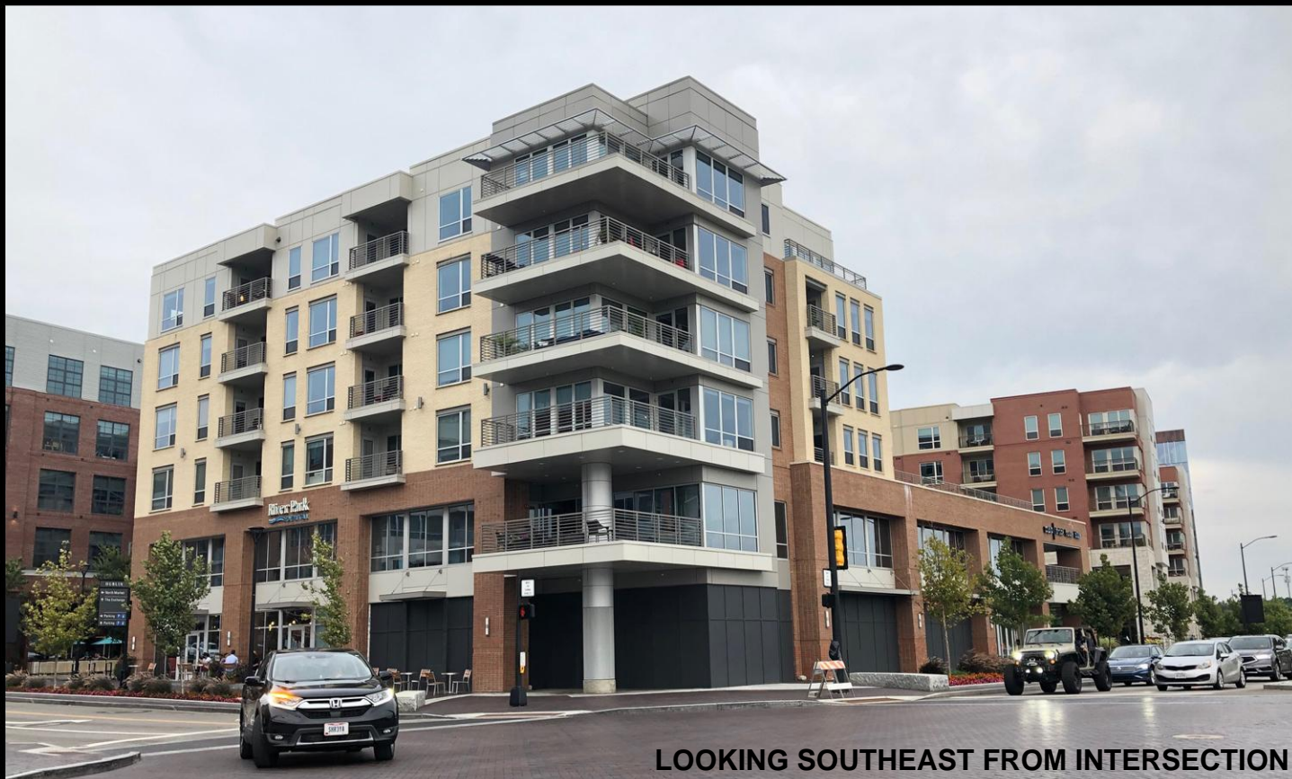
LOOKING SOUTHEAST FROM INTERSECTION