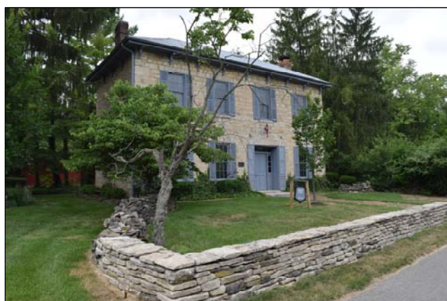
5707 Dublin Rd, house looking northwest