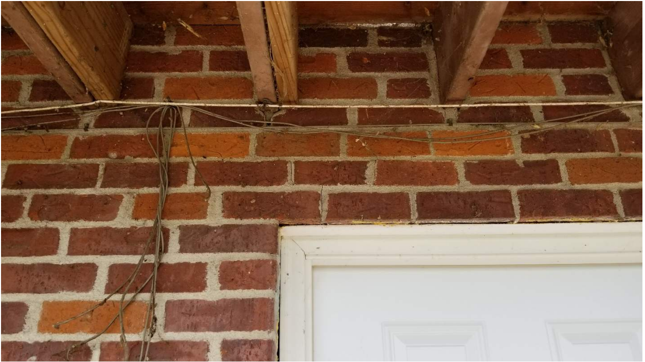
Decking penetrating brick veneer. Crack in masonry at lintel.