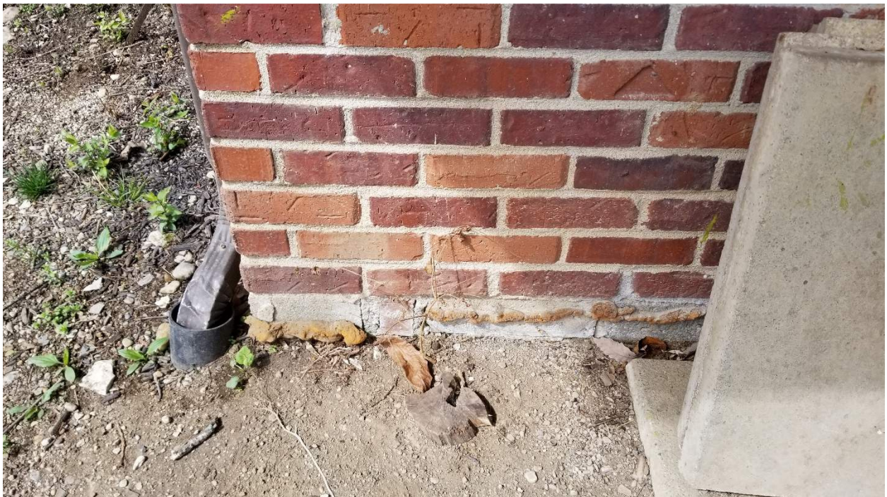
Crack in foundation and deterioration of CMU