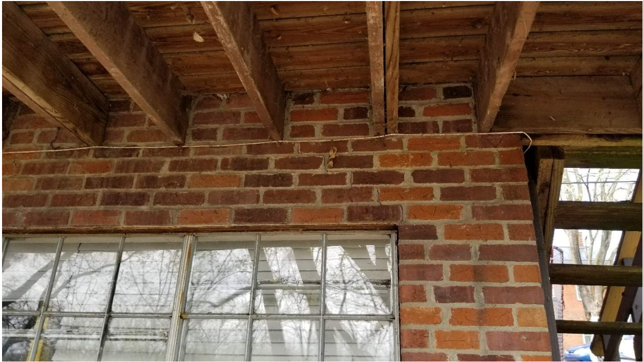
Decking penetrating brick veneer. Crack in masonry and sagging lintel.