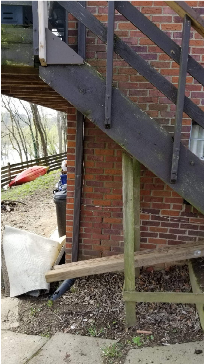
Crack at north wall at rear of house. Deteriorated and unsafe decking and railing.