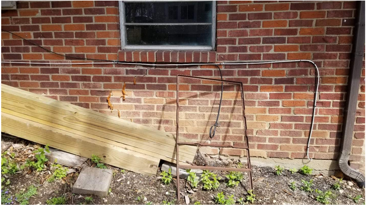
Cracks in foundation and brick at south rear corner.