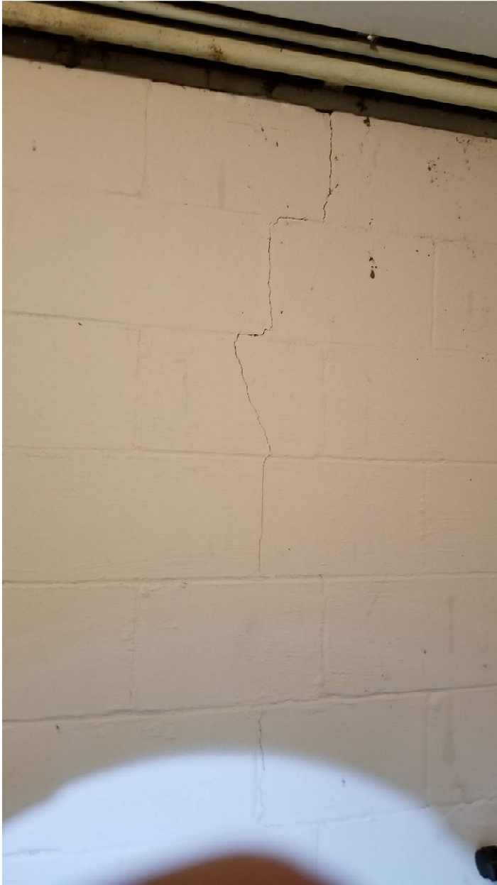
Interior foundation crack at front of house