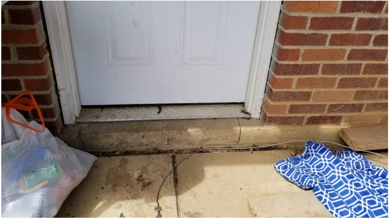
Crack in foundation.