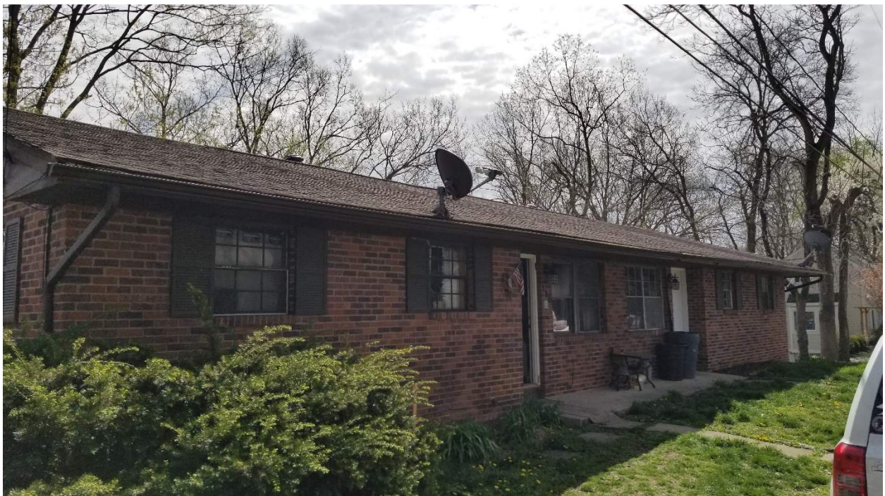
Unevenness in roof lines