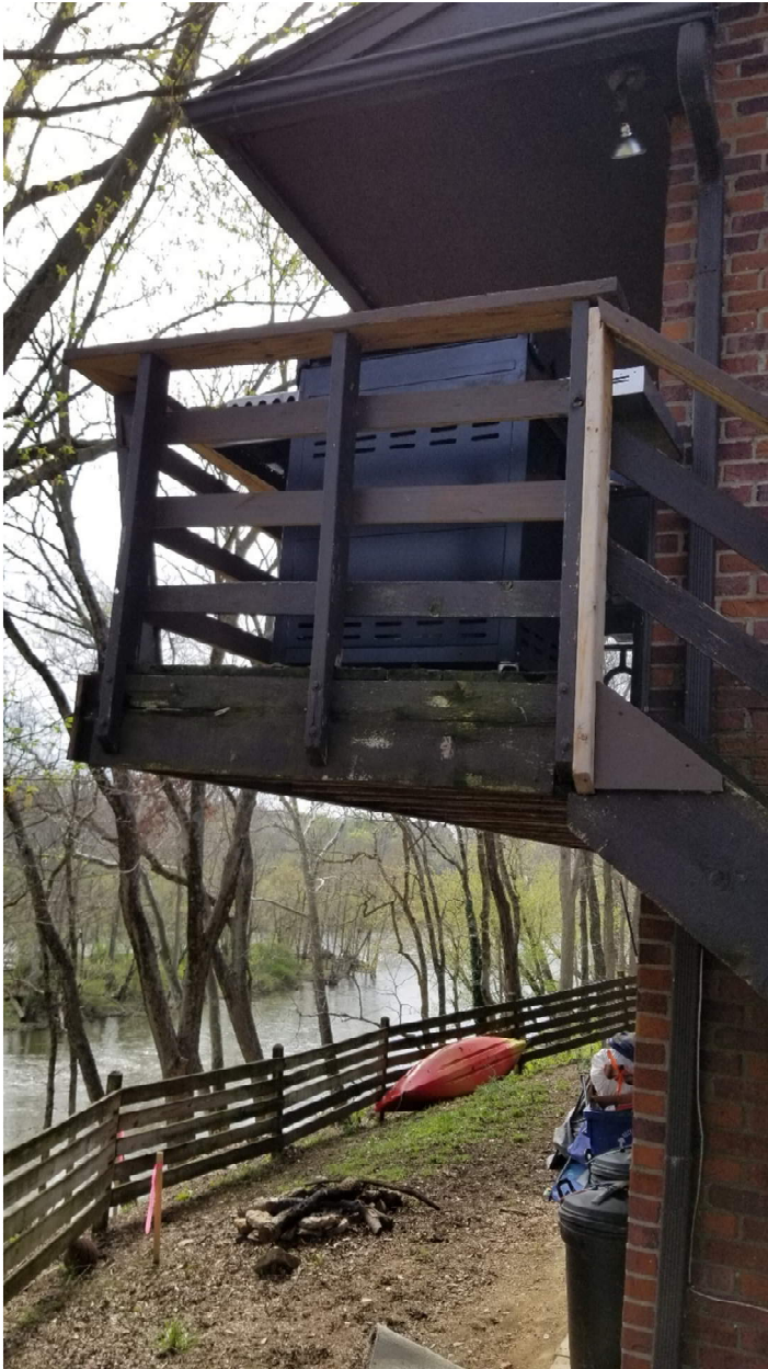
Deteriorated and unsafe decking and railing.