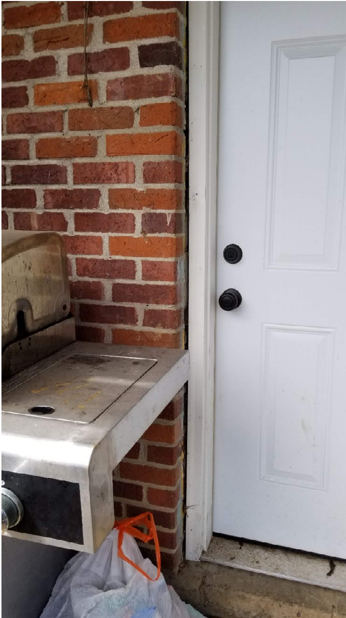
Gap between door and brick.