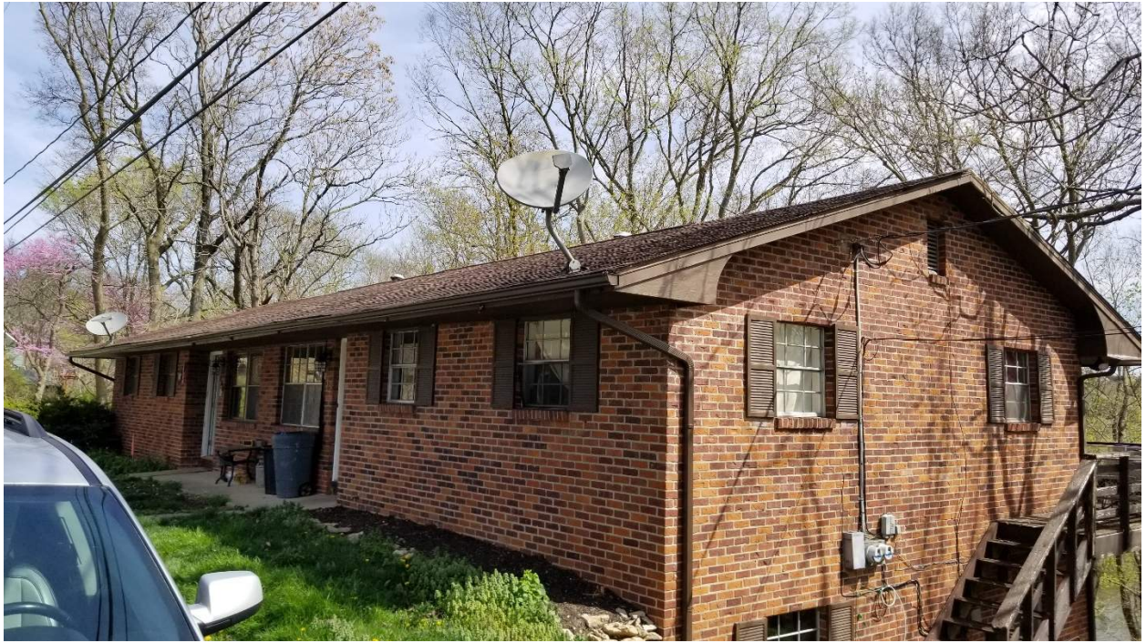
Unevenness in roof lines