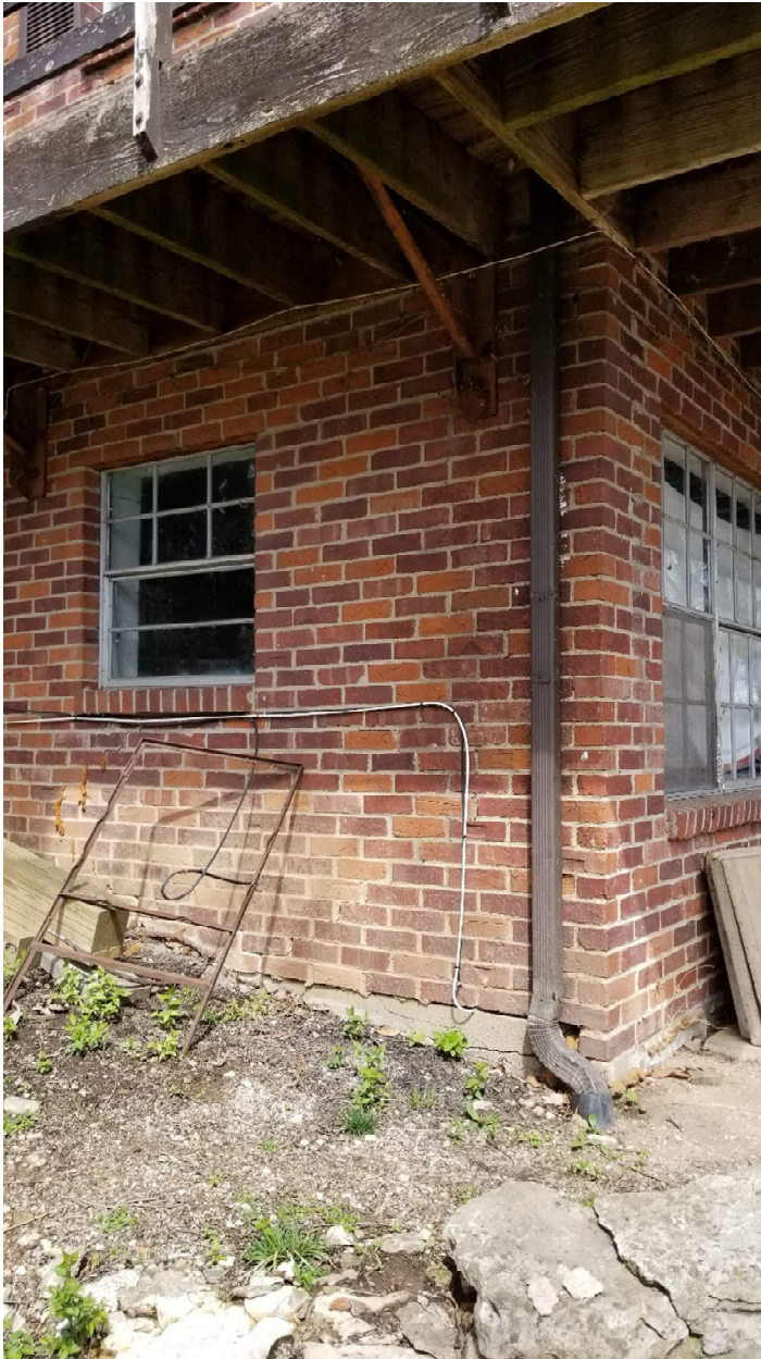
Cracks in foundation and brick at south rear corner.