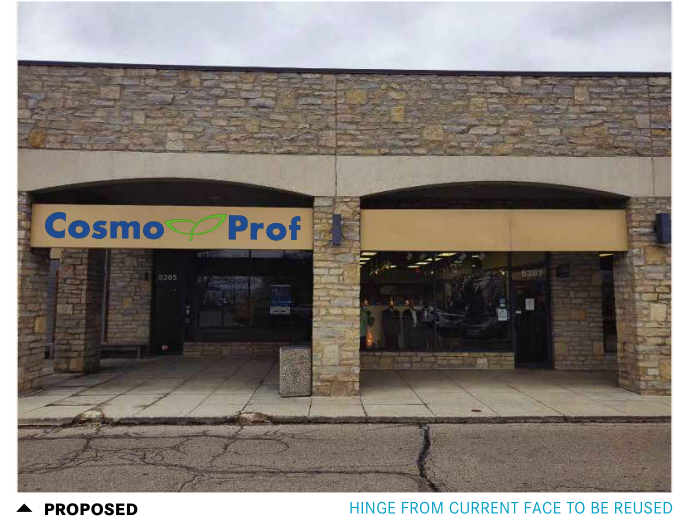
HINGE FROM CURRENT FACE TO BE REUSED MOUNTING HOLES TO BE DRILLED IN THE FIELD